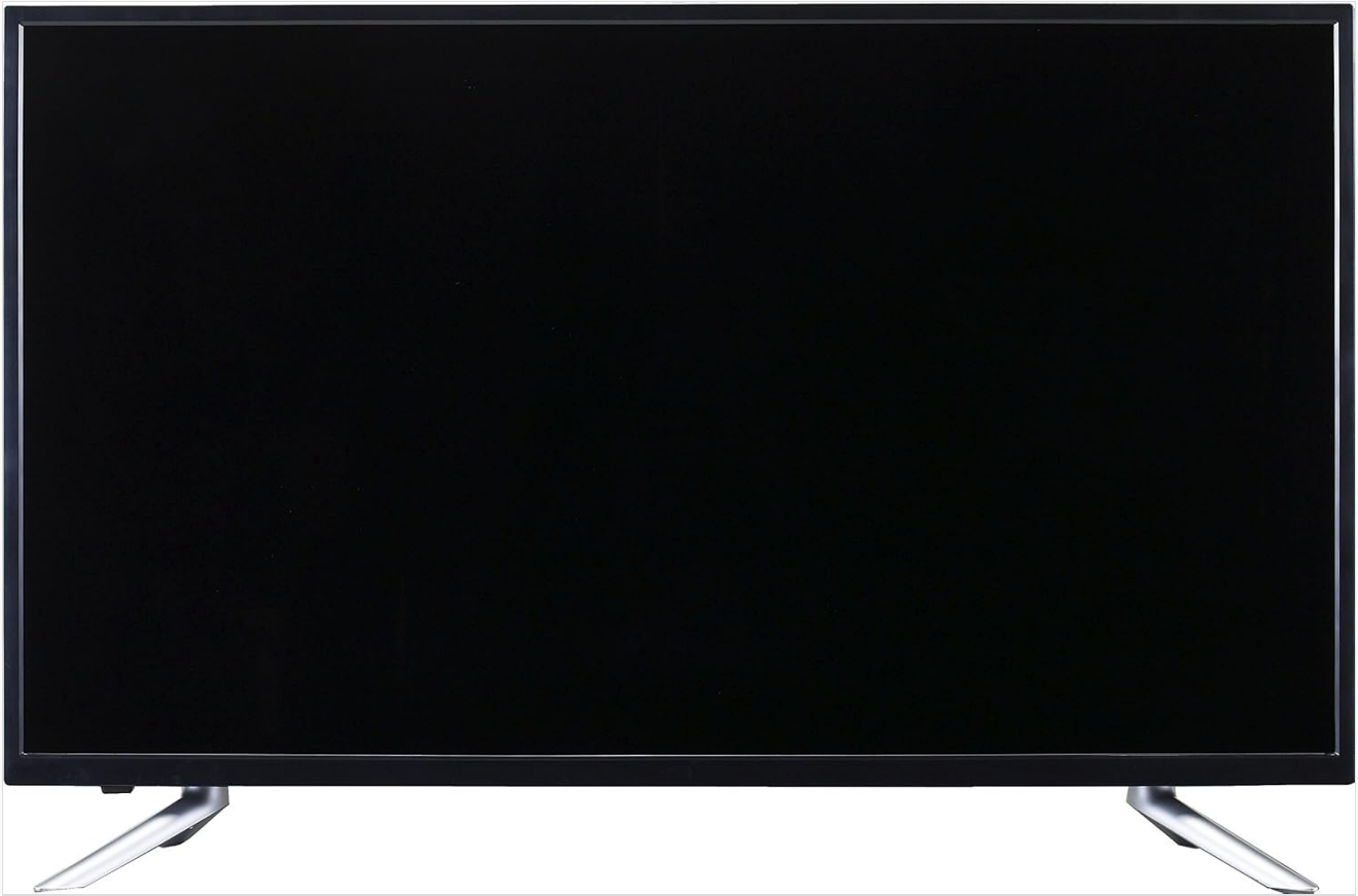
Image: Front view of the SANSUI SCM39-B11 TV with its stand, showing the display and the two silver-colored feet.

Carefully place the television screen-down on a soft, flat surface. Attach the included stand to the bottom of the television using the provided screws. Ensure the stand is securely fastened before placing the television upright.