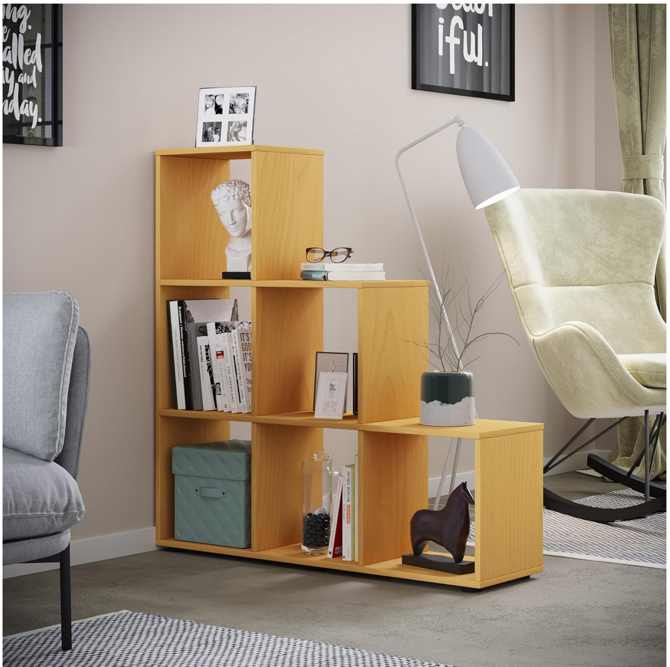
Image: The VCM Step Cube Shelf positioned in a modern living room, demonstrating its function as both a storage unit and a decorative element. The shelf holds books, a sculpture, and other personal items, blending seamlessly with the room's decor.