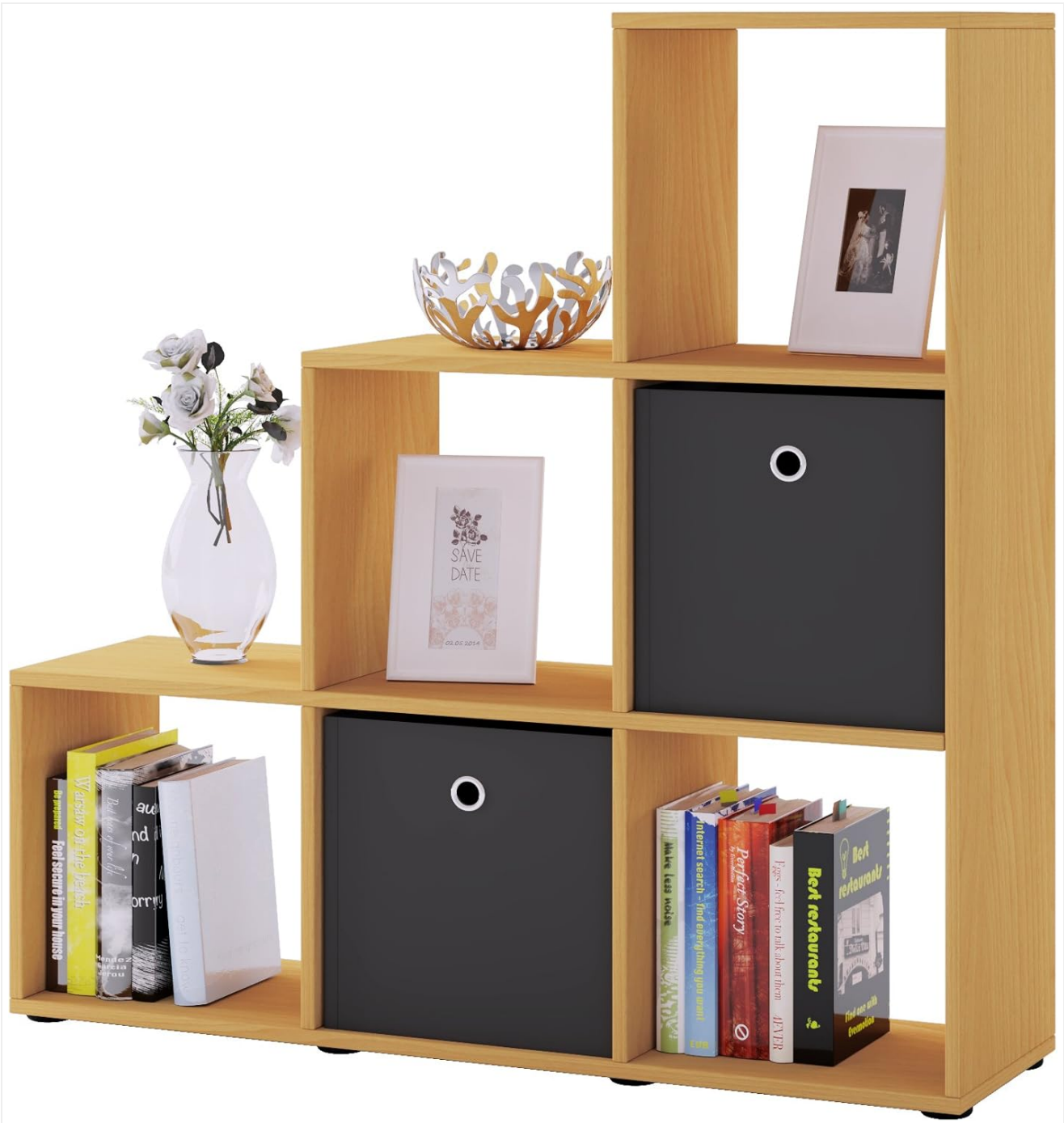
Image: The VCM Step Cube Shelf in a beech finish, showcasing its six compartments filled with books, decorative items, and storage boxes. This image illustrates the shelf's practical use and aesthetic appeal in a living space.