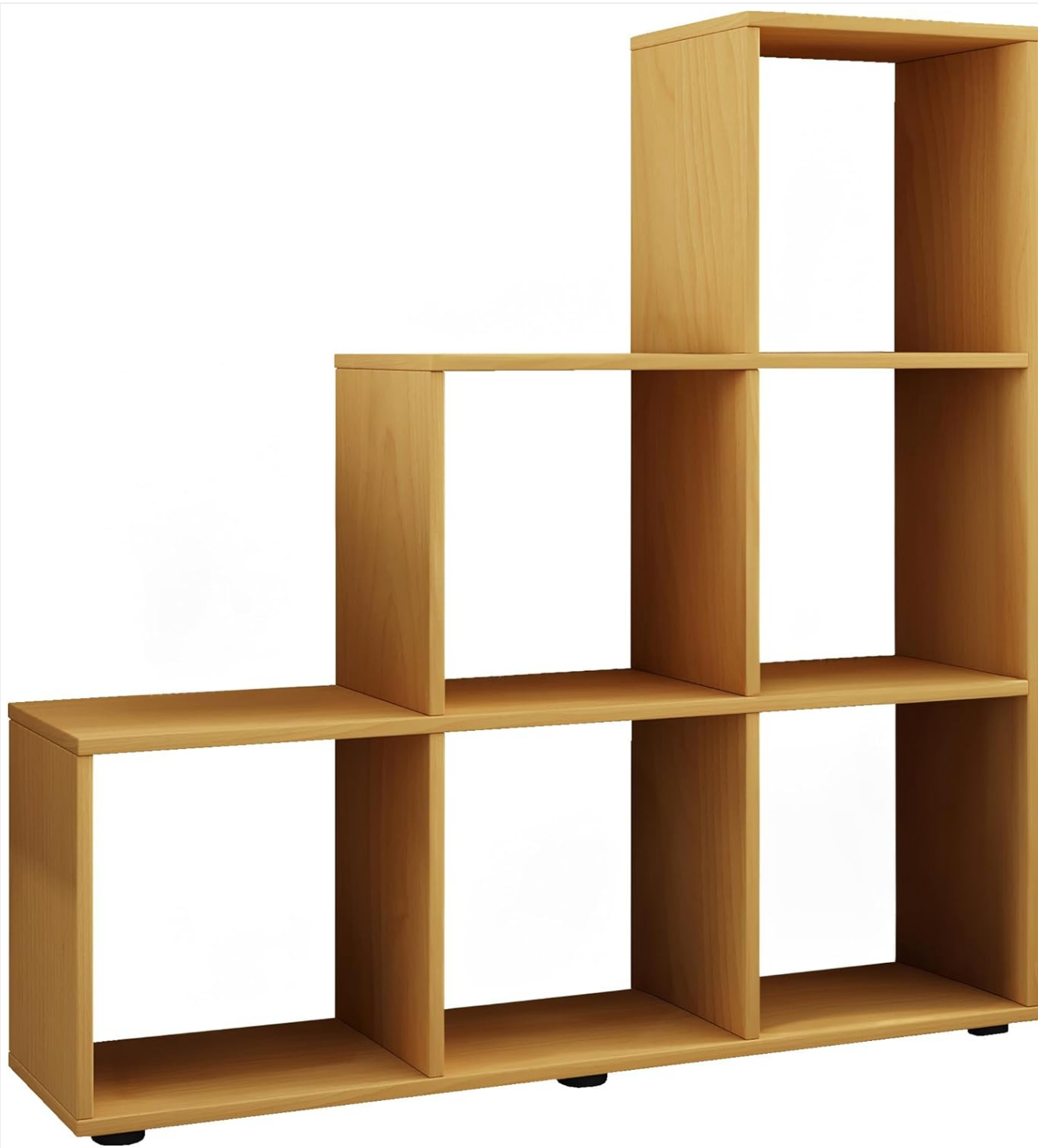
Image: An empty VCM Step Cube Shelf, highlighting its six distinct compartments and the step-like design. This image provides a clear view of the shelf's structure before any items are placed on it.