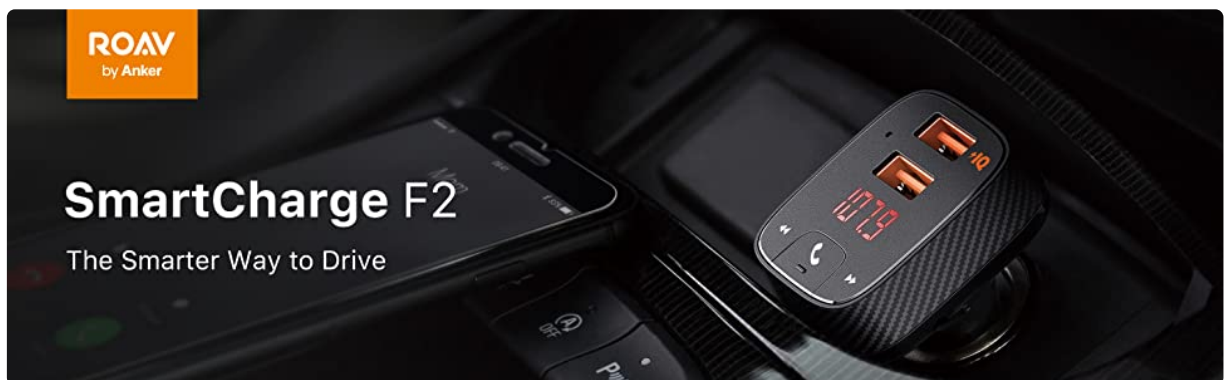
Image: ROAV SmartCharge F2 Bluetooth FM Transmitter banner, highlighting its smart driving features.

The ROAV SmartCharge F2 is a versatile Bluetooth FM Transmitter designed to enhance your in-car audio experience. It allows you to stream music from your phone, make hands-free calls, and charge your devices simultaneously. With its stable Bluetooth 4.2 and FM connections, dual USB ports featuring PowerIQ technology, and a convenient car finder app feature, the SmartCharge F2 integrates modern connectivity into any vehicle.