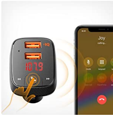
Image: A hand interacting with the call button on the SmartCharge F2, demonstrating hands-free call functionality.