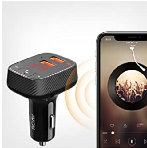
Image: The SmartCharge F2 actively charging a smartphone, highlighting PowerIQ and VoltageBoost technologies for fast and efficient charging.