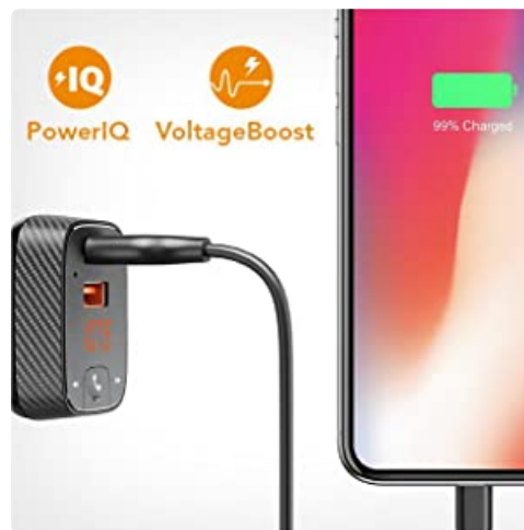
Image: The SmartCharge F2 connected via Bluetooth to a smartphone, indicating music streaming capability.