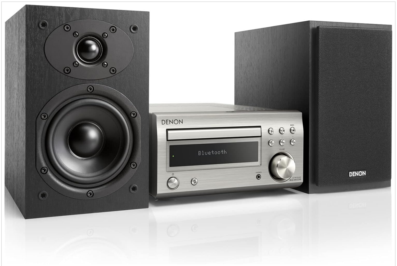
Figure 3.3: The Denon D-M41 system includes the main receiver unit and two SC-M41 speakers, designed for optimal audio performance and compact placement.