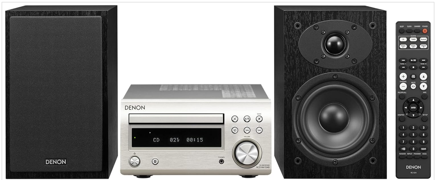
Figure 3.1: This image displays all primary components of the Denon D-M41 system: the central receiver, two SC-M41 bookshelf speakers, and the remote control unit.