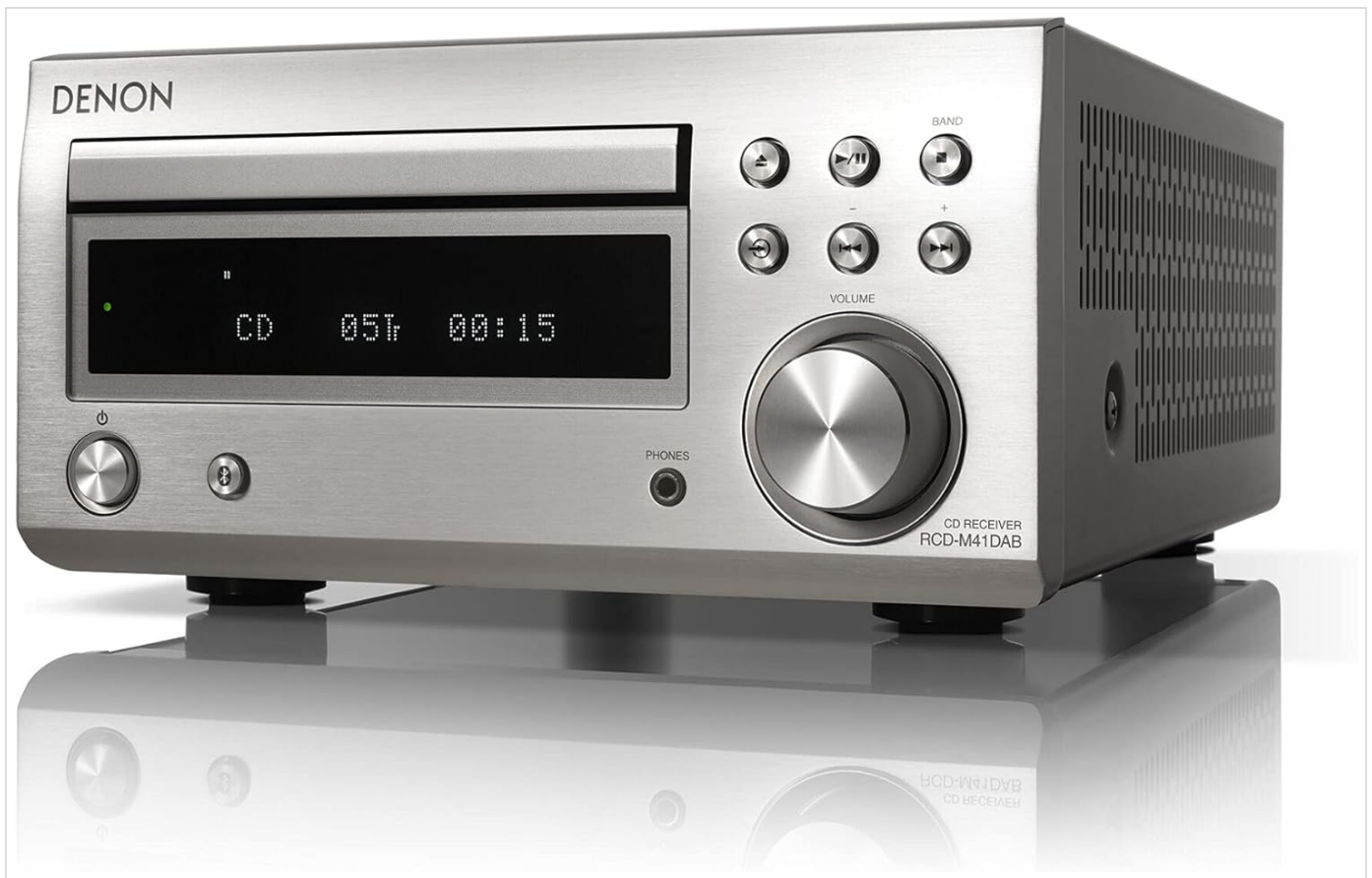
Figure 4.2: A close-up view of the Denon D-M41DAB receiver's front panel, showing the CD tray, display, volume knob, and various control buttons including power, source, and playback controls.