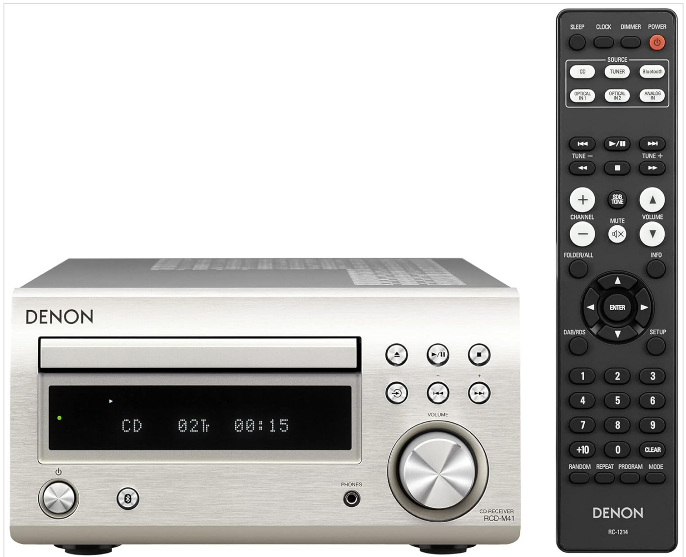
Figure 4.1: The Denon D-M41DAB receiver unit is shown alongside its comprehensive remote control, which allows for easy navigation and control of all system functions.