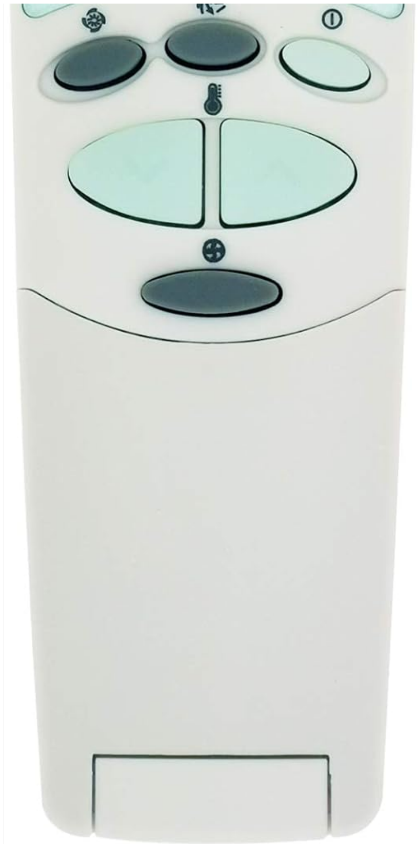
Figure 1: Front view of the remote control with main display and buttons.