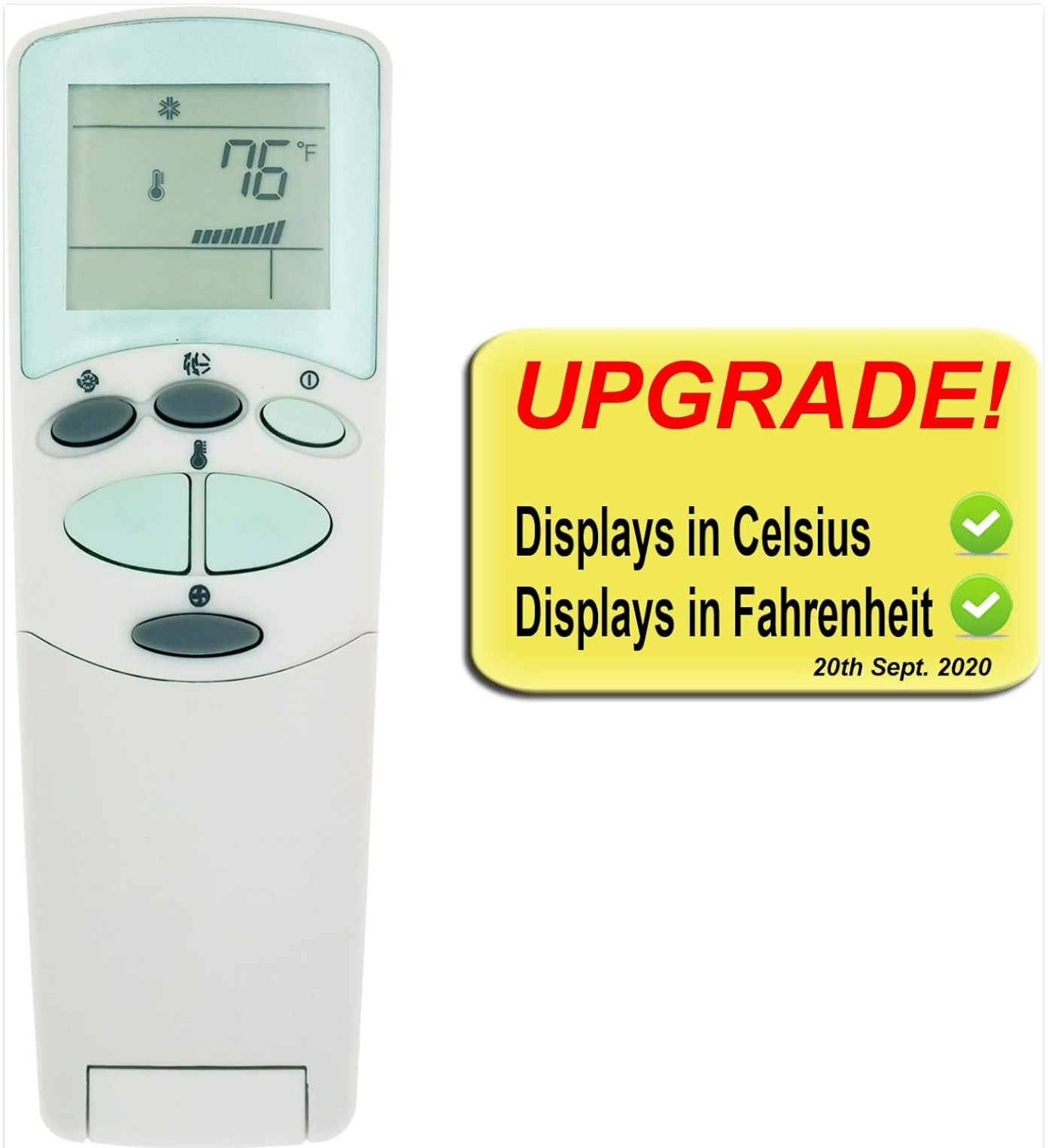
Figure 4: Remote control highlighting Celsius and Fahrenheit display capability.