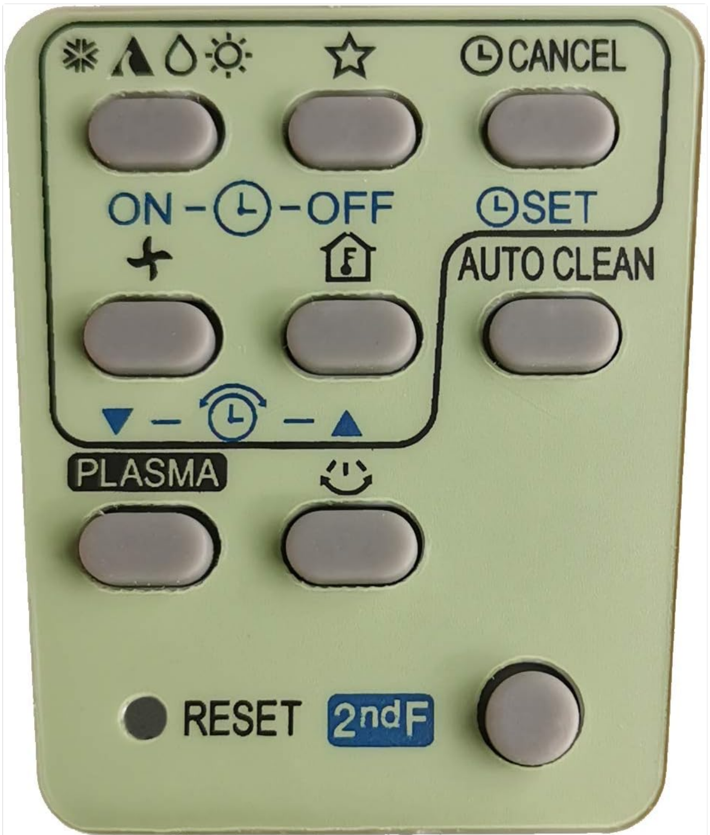
Figure 3: Detailed view of advanced function buttons.