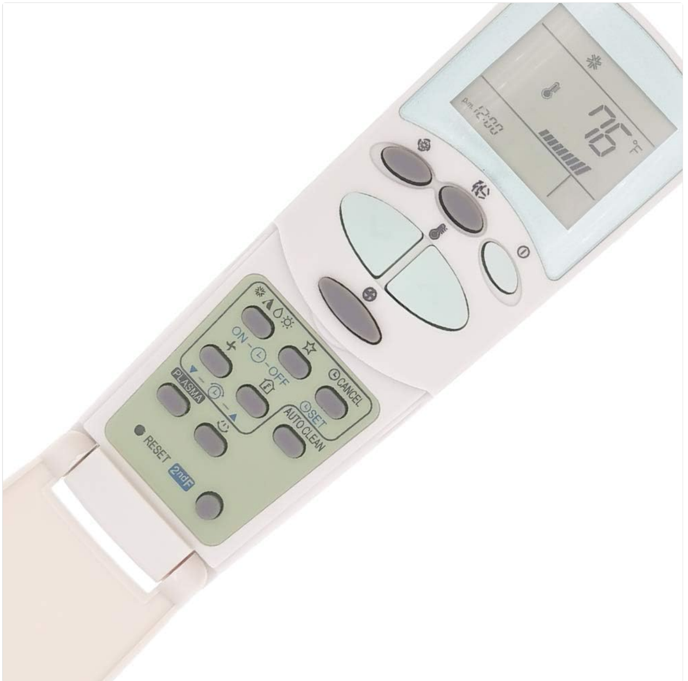
Figure 2: Remote control with the advanced function panel visible.