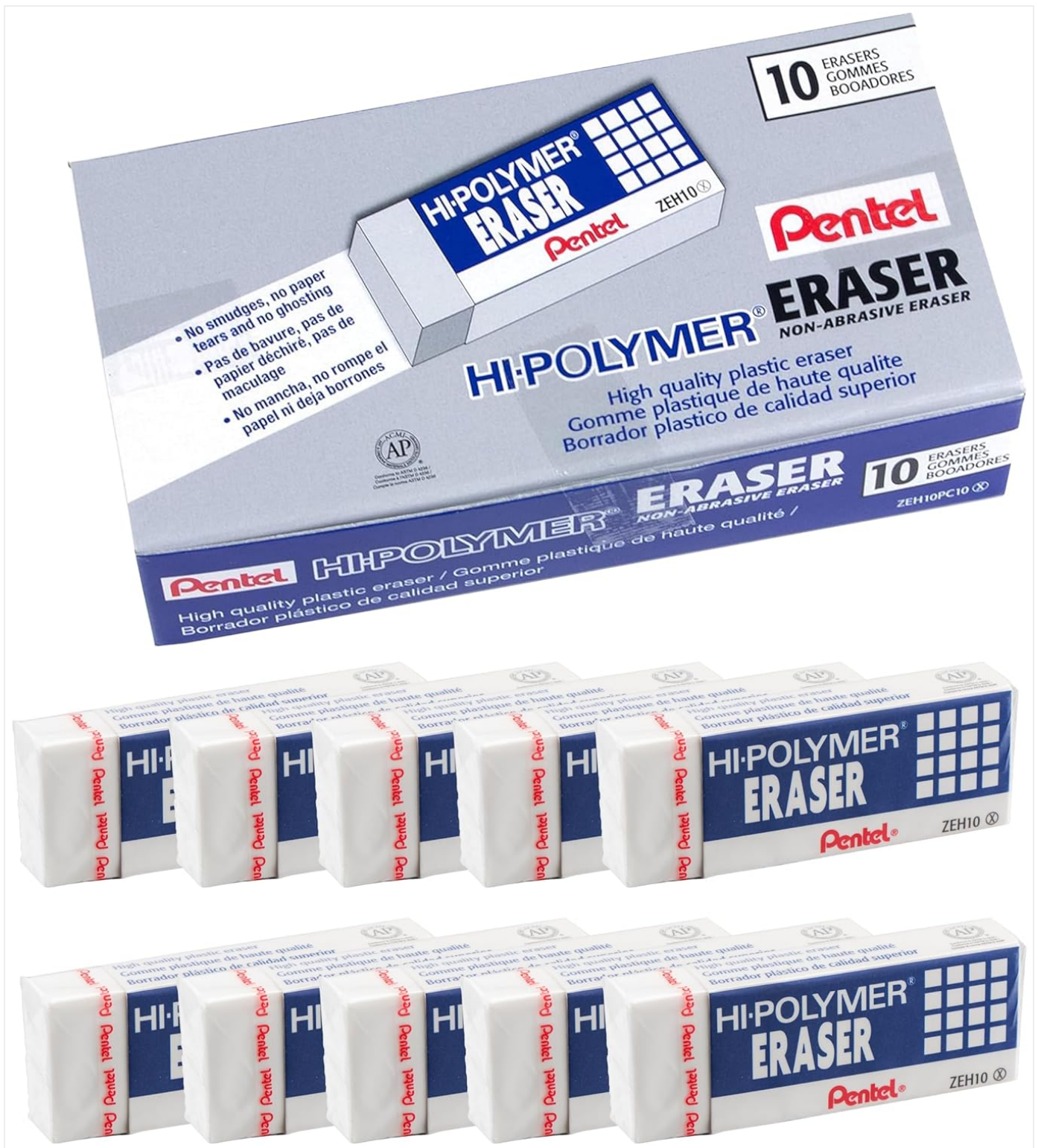
Image: A box containing ten Pentel Hi-Polymer Block Erasers, with several individual erasers displayed in front of the box. The erasers are white with blue and black branding.