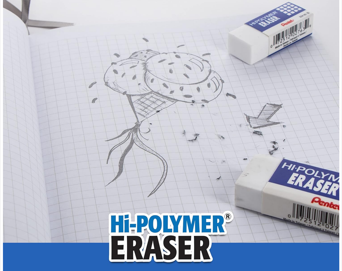
Image: A close-up view of a notebook page after using a Pentel Hi-Polymer Eraser, showing clean removal of pencil marks with minimal residue, highlighting the quality of erasure.