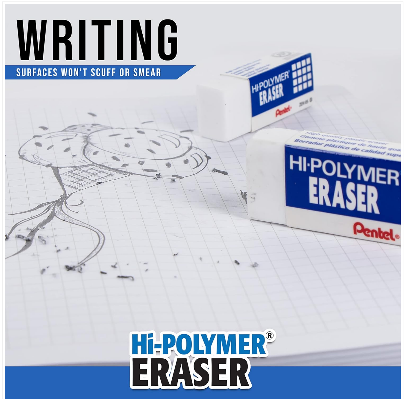
Image: A Pentel Hi-Polymer Eraser positioned on a notebook page, demonstrating the process of erasing pencil marks. Eraser residue is visible next to the erased area.