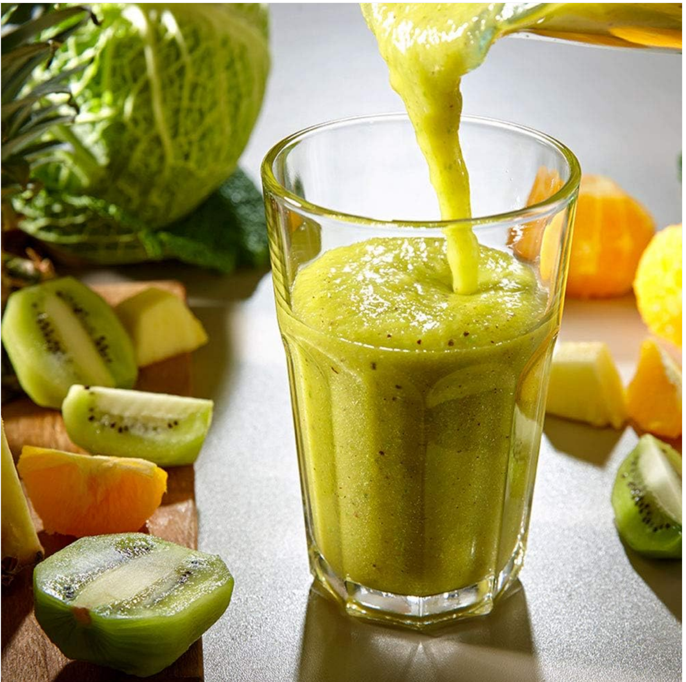
Image 5.2: A vibrant green smoothie being poured from the Philips HR3652/01 blender's jar into a tall glass, showcasing the final blended product.