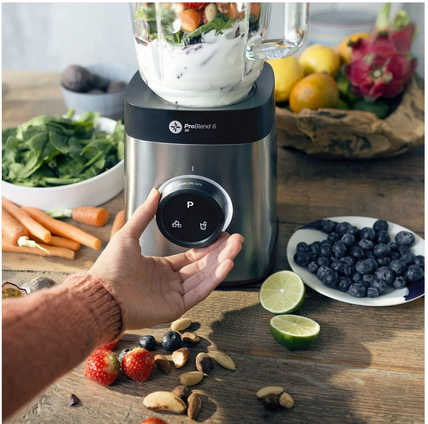
Image 5.1: A hand turning the central control dial of the Philips HR3652/01 blender, which features 'P' for Pulse and other settings, demonstrating how to select blending modes.