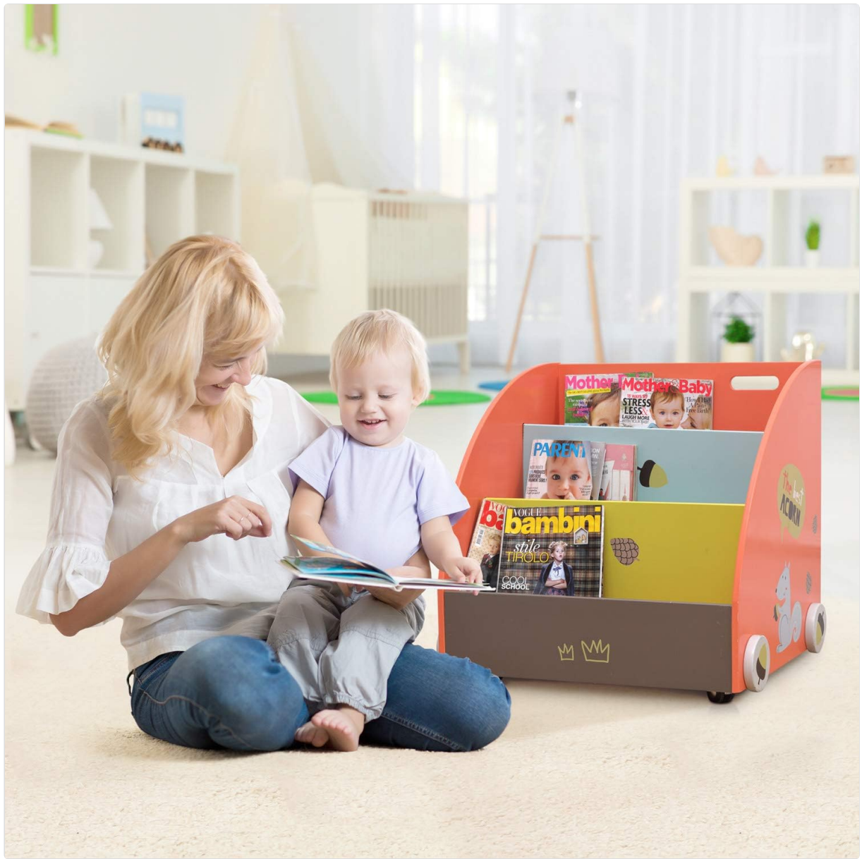
Image 3: A child and adult engaging with the bookshelf in a home setting.