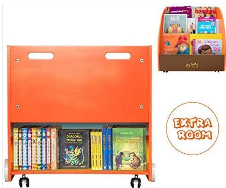
Image 4: Rear view of the bookshelf, illustrating the hidden storage compartment filled with books.