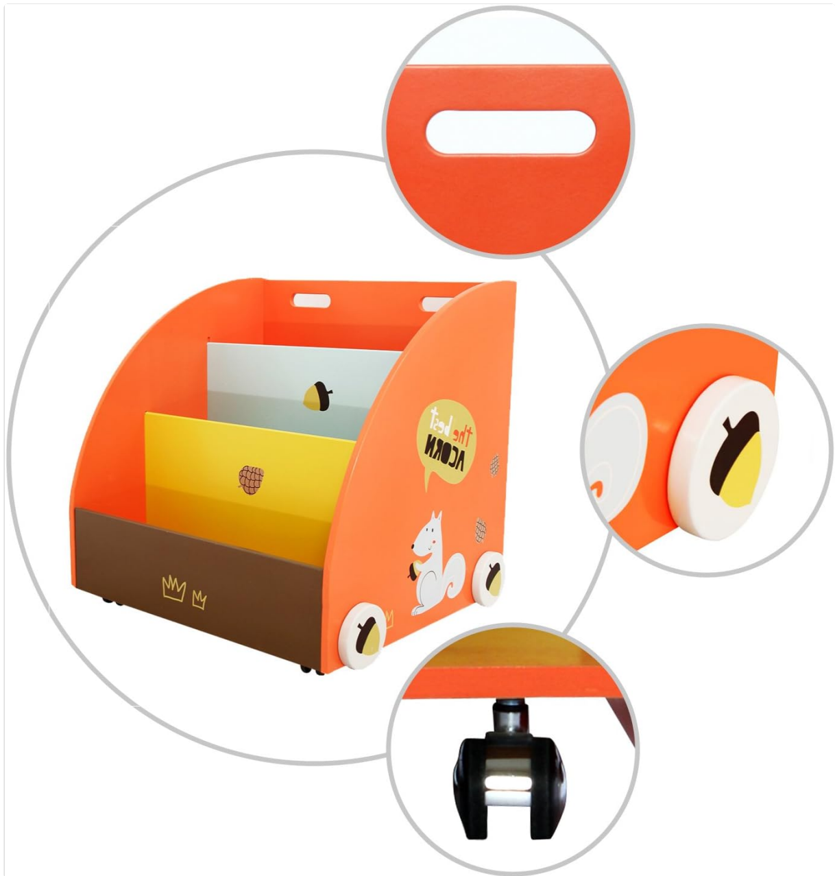
Image 2: Detailed view of the bookshelf's handles, decorative wheels, and functional caster wheels.