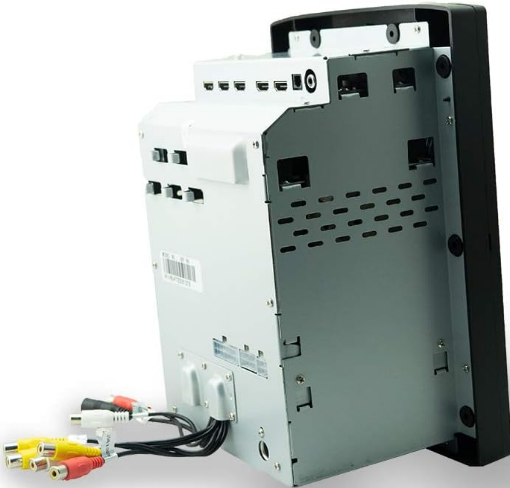
Image: The back of the iRV66 unit, displaying multiple RCA audio and video output jacks, along with other connectors for power and speakers.

The rear panel houses the main power, speaker, and additional audio/video connections. These are crucial for integrating the iRV66 into your RV's entertainment system.