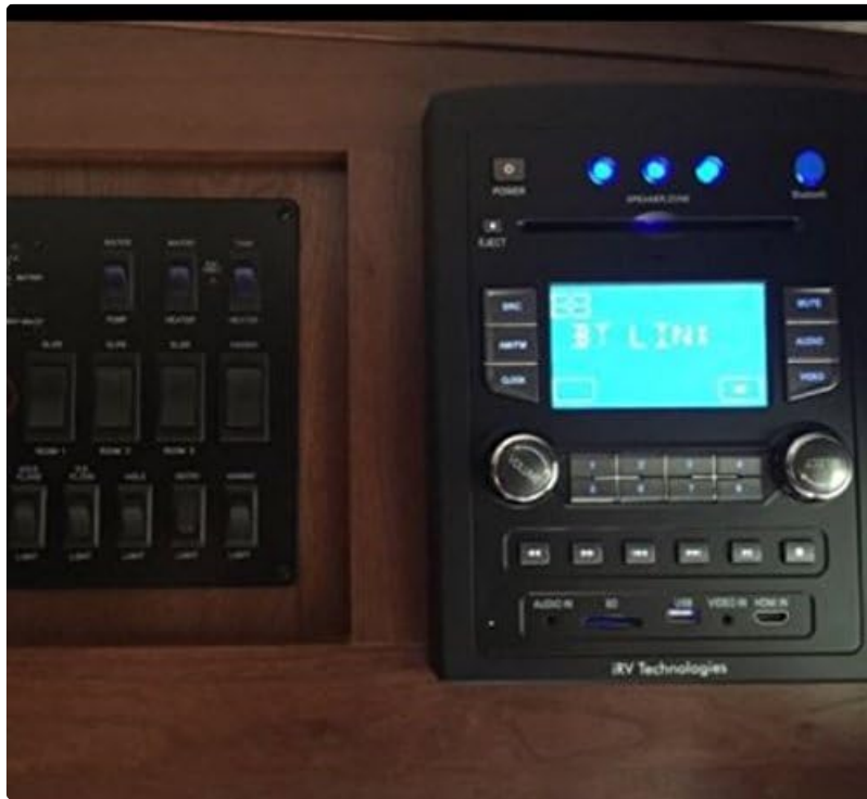
Image: The iRV66 unit seamlessly installed in an RV's interior panel, demonstrating its fit and integration with other vehicle controls.