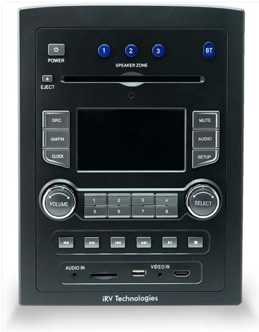
Image: Front panel of the iRV66 unit, displaying the power button, speaker zone selectors, disc slot, display screen, control buttons (SRC, AM/FM, Clock, Setup, Mute, Audio), volume and select knobs, and front input ports.

The front panel provides access to all primary controls and inputs. Key elements include: