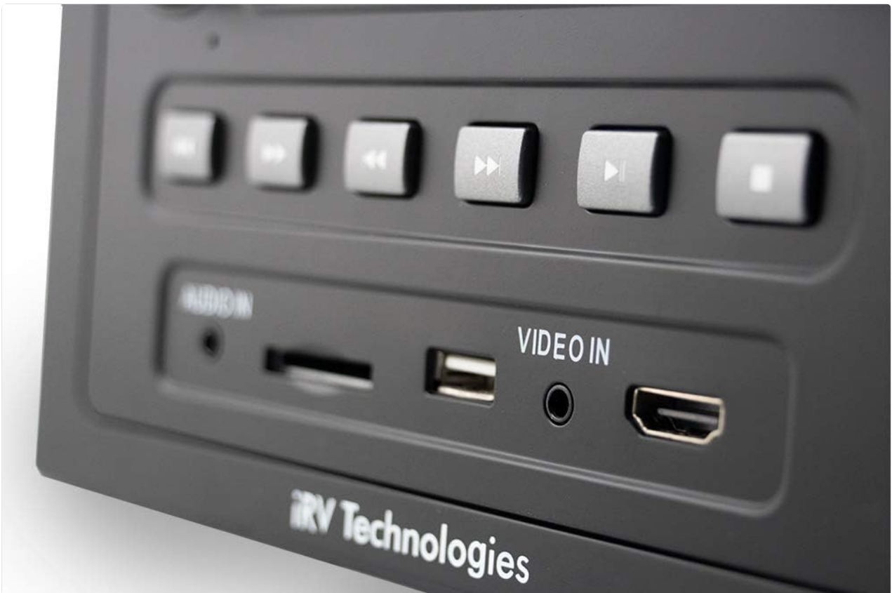
Image: A detailed view of the front panel's input section, highlighting the Audio In (3.5mm jack), SD card slot, USB port, Video In (3.5mm jack), and HDMI In port.

The front panel features convenient input ports for various media and devices: