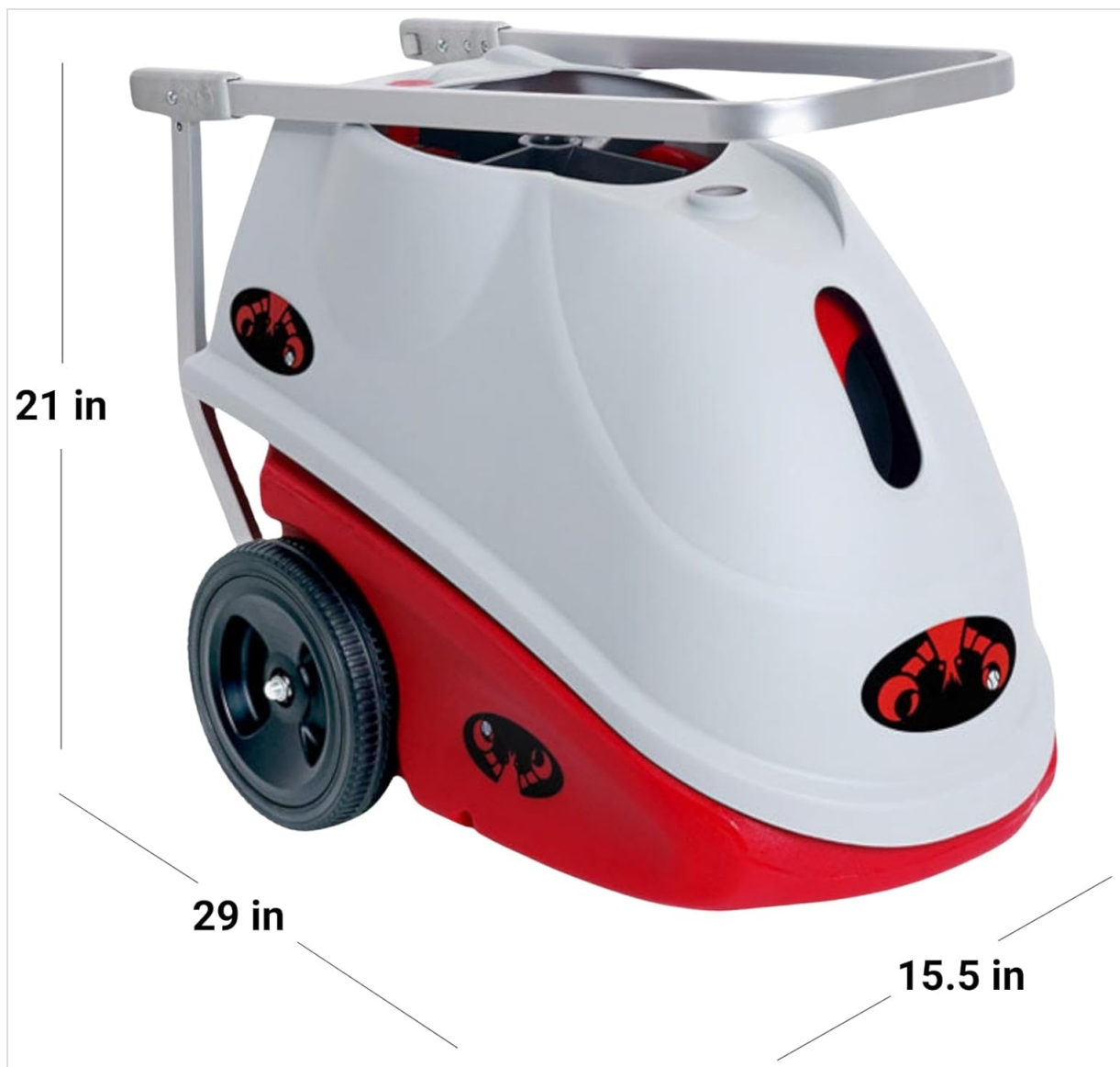
Figure 2: The Lobster Sports Elite Two Tennis Ball Machine in its folded configuration, ready for transport. The hopper is inverted, and the handle is retracted, reducing its height to 21 inches for easy storage and portability.