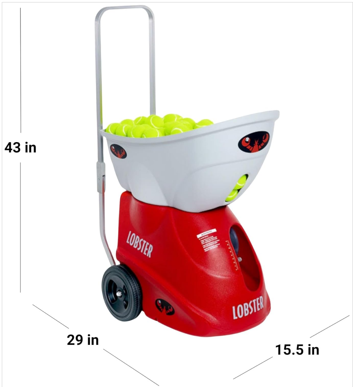
Figure 1: The Lobster Sports Elite Two Tennis Ball Machine, shown fully assembled with its hopper extended and handle raised. Dimensions are indicated: 43 inches height, 29 inches length, and 15.5 inches width. The machine is red and white, with tennis balls visible in the hopper.