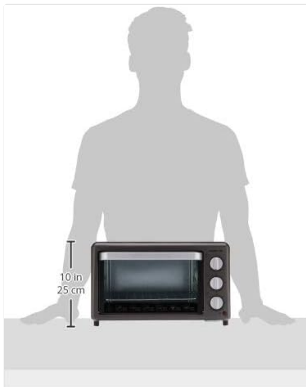
Figure 7.1: Diagram illustrating the approximate dimensions of the MISTRAL MO17D Electric Oven.