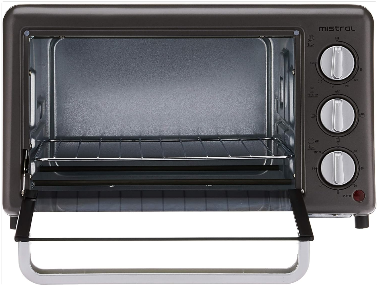
Figure 2.3: The MISTRAL MO17D Electric Oven with its glass door open, revealing the interior cavity and the removable baking rack.