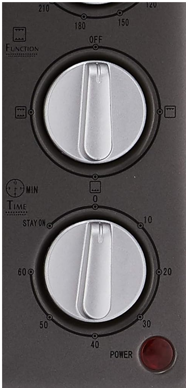
Figure 2.2: Close-up view of the three control knobs on the MISTRAL MO17D Electric Oven: Temperature (top), Function (middle), and Timer (bottom).