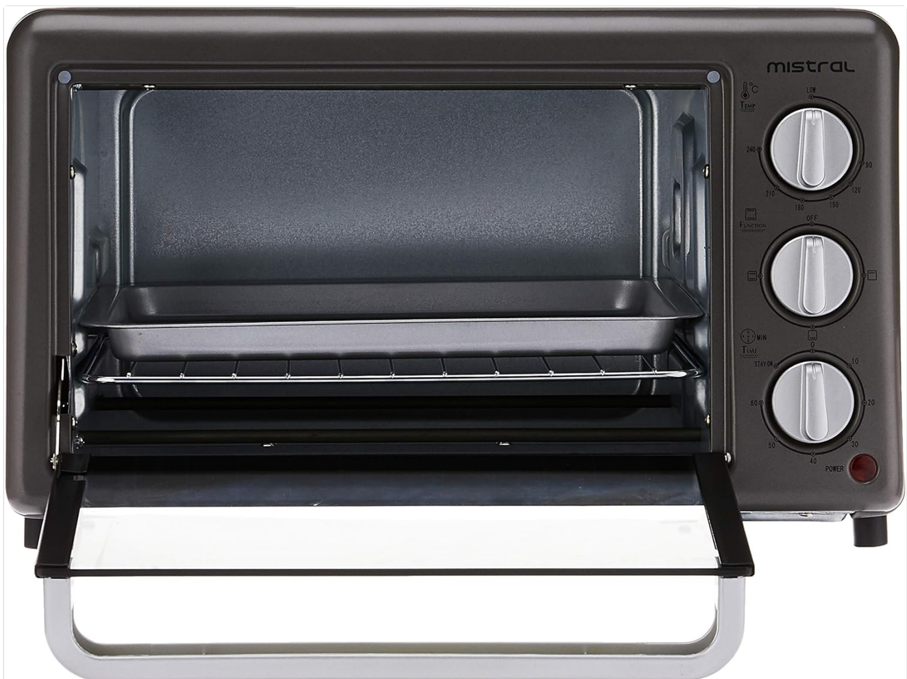
Figure 4.1: The MISTRAL MO17D Electric Oven with its door open, showing both the baking rack and the baking tray inserted into the cavity.