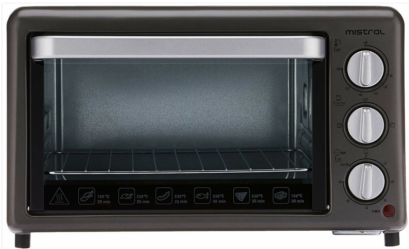
Figure 2.1: Front view of the MISTRAL MO17D Electric Oven, showing the main body, glass door, and control panel on the right side.