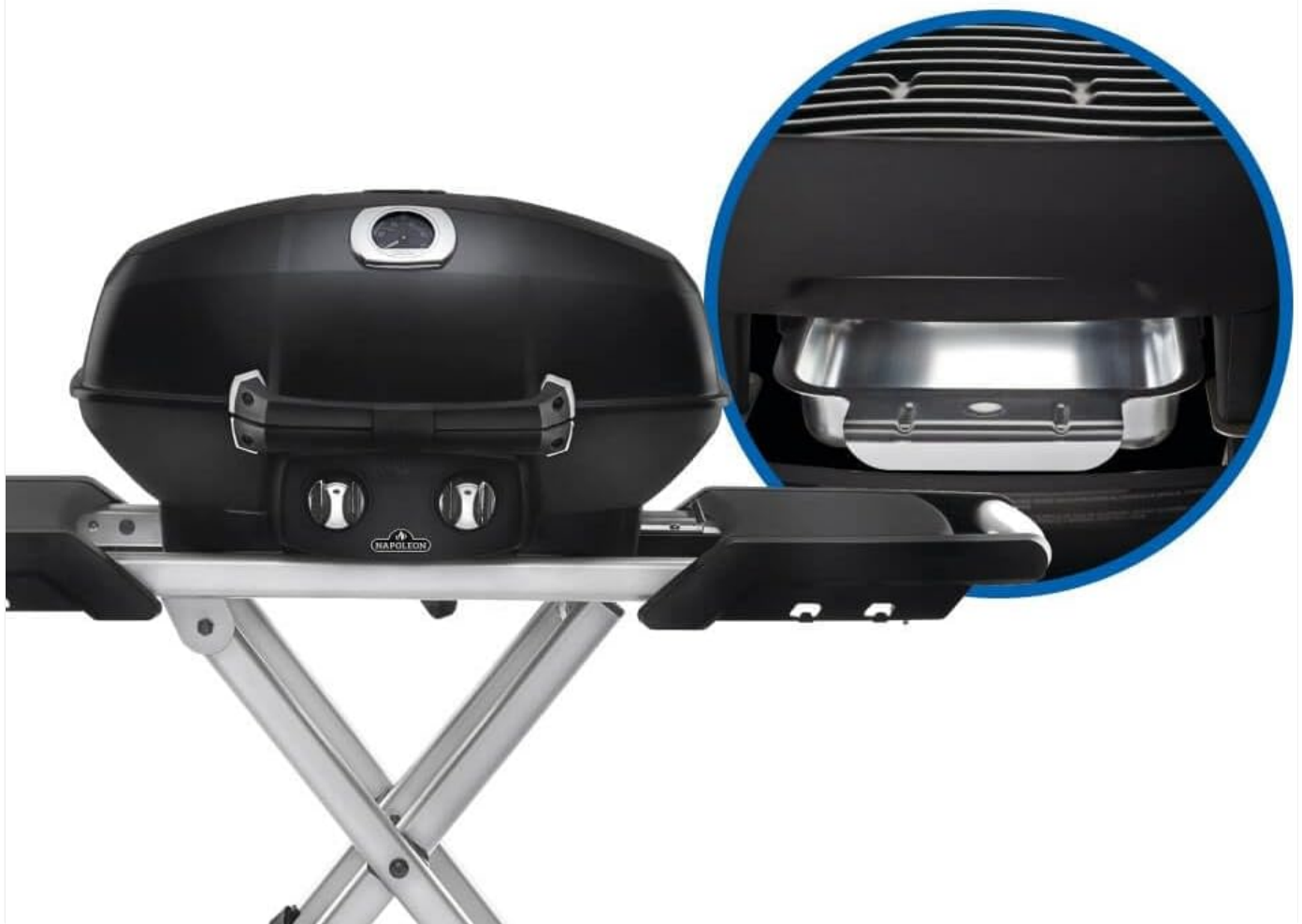
Image: Close-up view of the accessible drip tray on the Napoleon TravelQ PRO285X grill, indicating its ease of cleaning and maintenance.