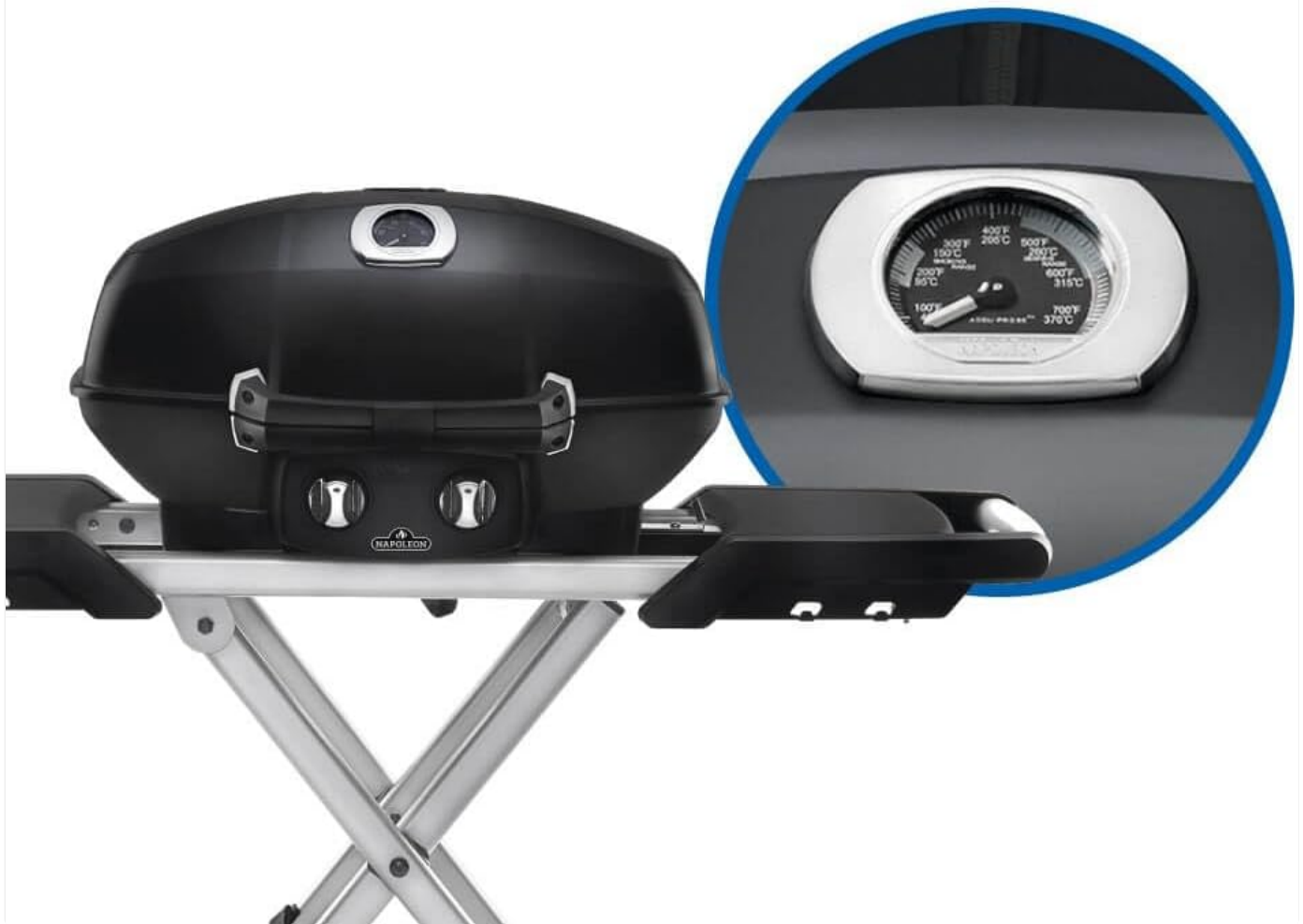
Image: Close-up of the ACCU-PROBE temperature gauge on the lid of the Napoleon TravelQ PRO285X grill, indicating its use for precision grilling.

Your browser does not support the video tag.