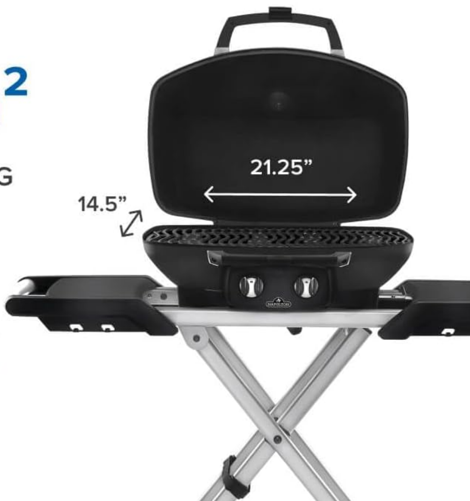
Image: The cast iron cooking grids of the Napoleon TravelQ PRO285X grill, highlighting the 285 square inches of cooking area, capable of fitting approximately 17 hamburgers.