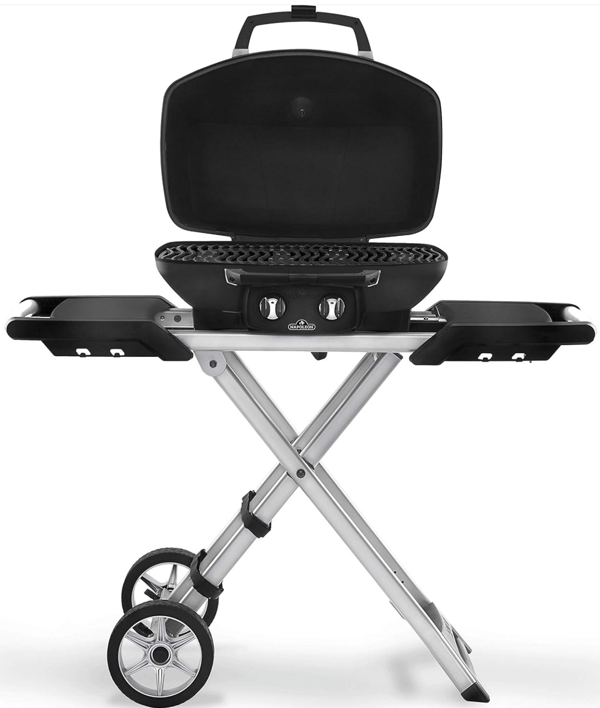
Image: The Napoleon TravelQ PRO285X grill with its foldable scissor cart in the upright position.