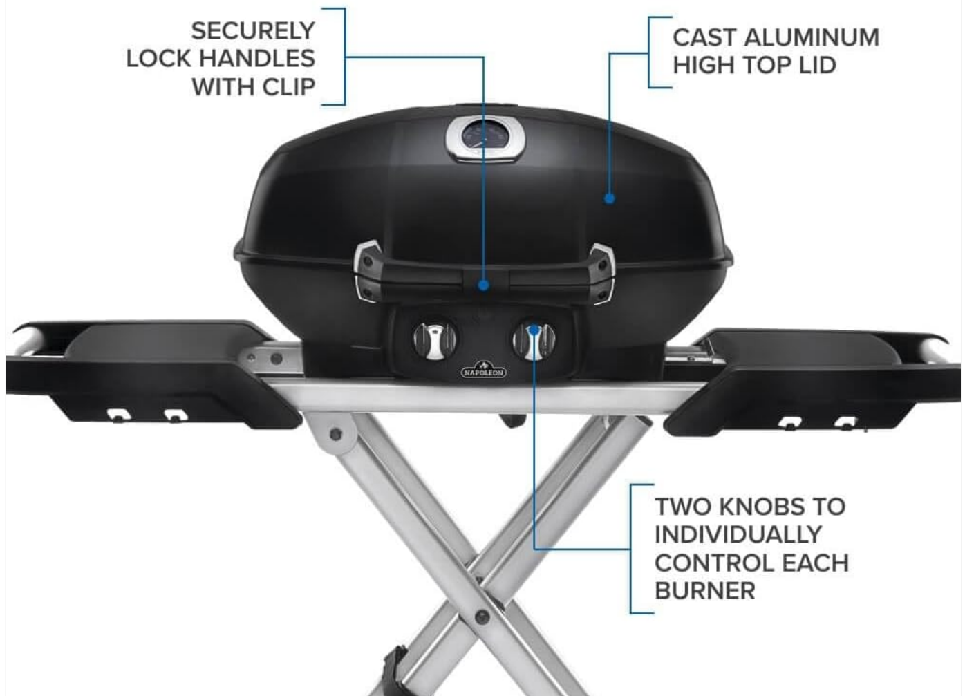
Image: The Napoleon TravelQ PRO285X grill in its folded, compact position, highlighting convenient storage, easy setup, and easy mobility.