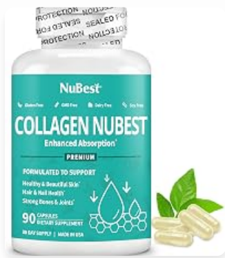
Image 2.3: Explanation of Bovine Collagen, its sources, types, and benefits for the body.