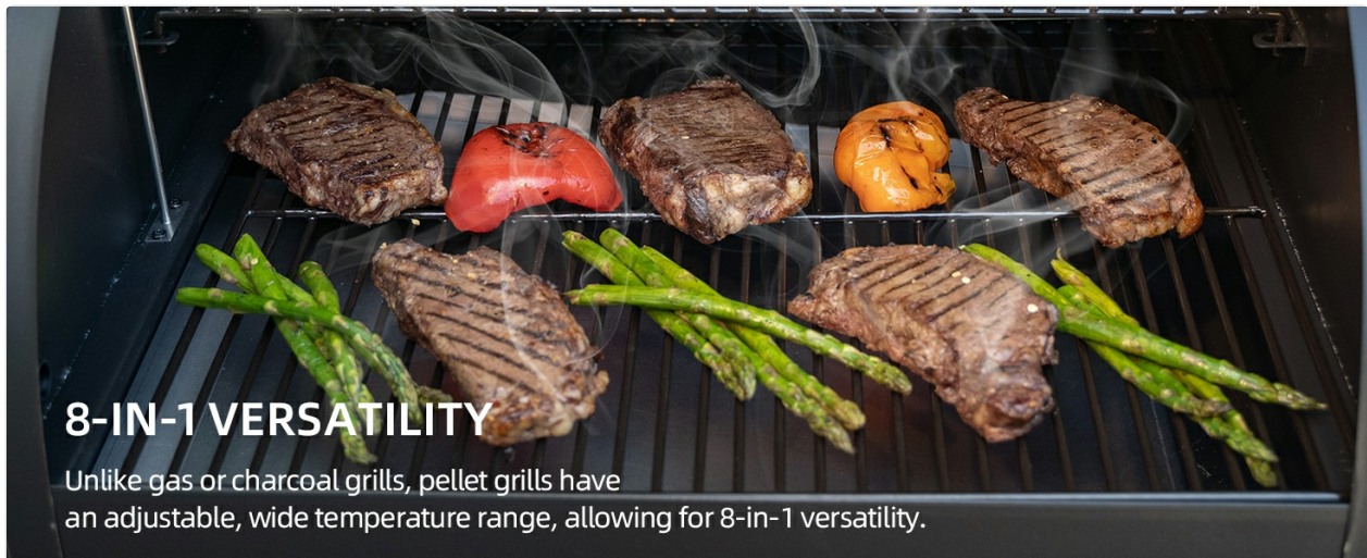
Figure 6.3: Various cuts of steak and asparagus cooking on the main grates of the Z GRILLS pellet grill, demonstrating its grilling capability.