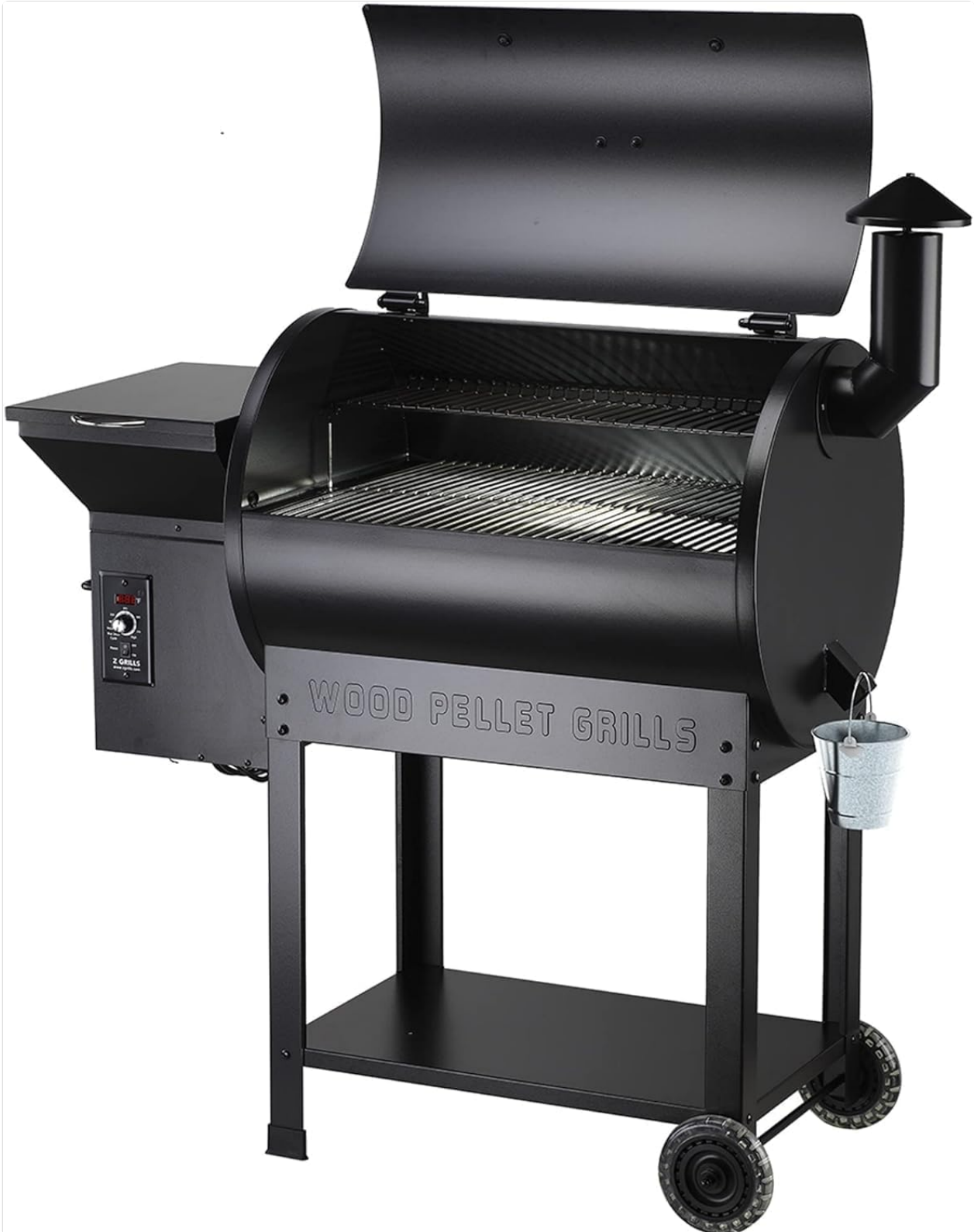
Figure 4.1: The Z GRILLS ZPG-7002B with its lid open, revealing the main cooking grates and the secondary warming rack. This view is typical during the final stages of assembly or before cooking.