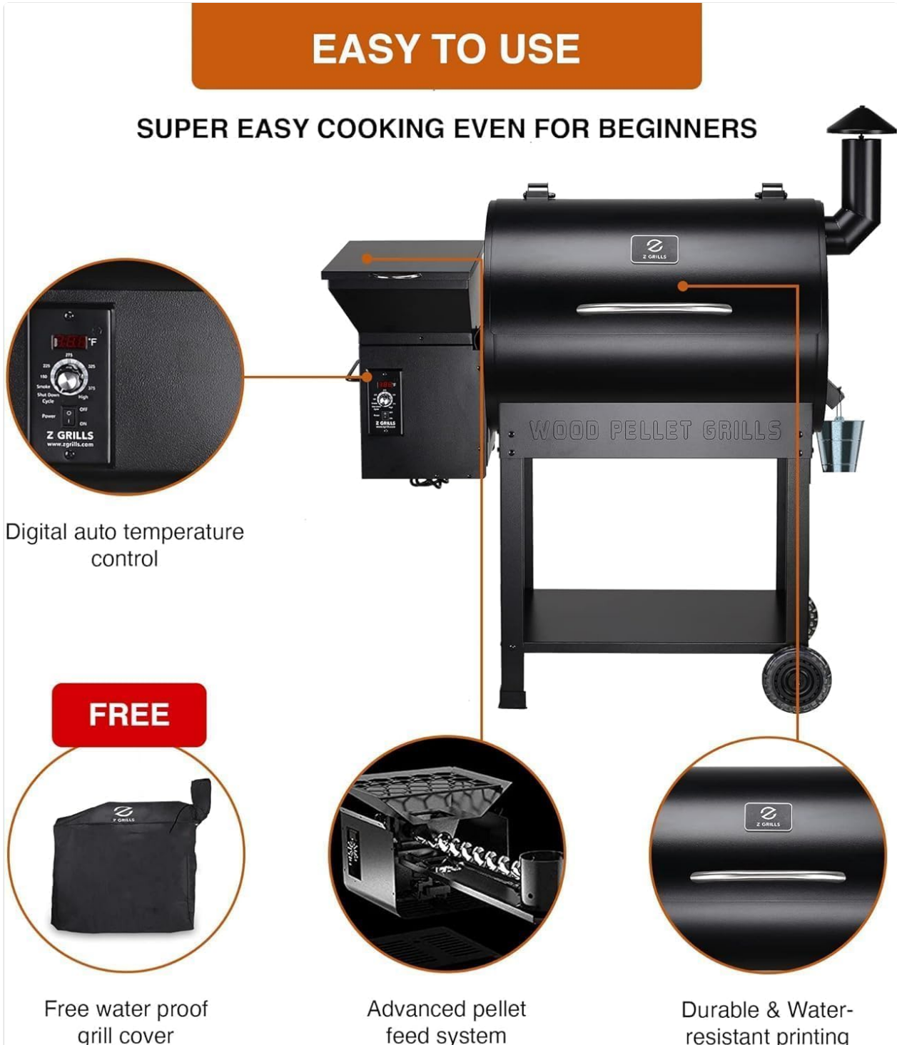
Figure 6.2: A close-up of the Z GRILLS ZPG-7002B's digital control panel, highlighting the temperature display and control knob. This image also points out the advanced pellet feed system and the durable, water-resistant printing on the grill.