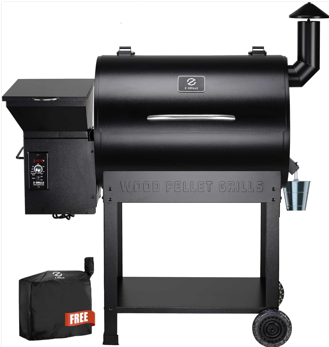
Figure 1.1: The Z GRILLS ZPG-7002B Wood Pellet Grill and Smoker, shown with its main body, pellet hopper, control panel, and chimney. A free grill cover is also visible.