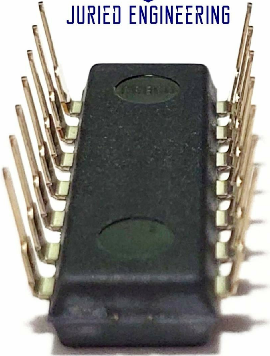
Figure 3: Angled view of the UA723CN IC, showing its physical dimensions and pin arrangement.

To adjust the output voltage, external resistors are typically used in a feedback network connected to the IC's error amplifier inputs. Current limiting can be implemented using an external sense resistor to protect the regulator and load from excessive current.