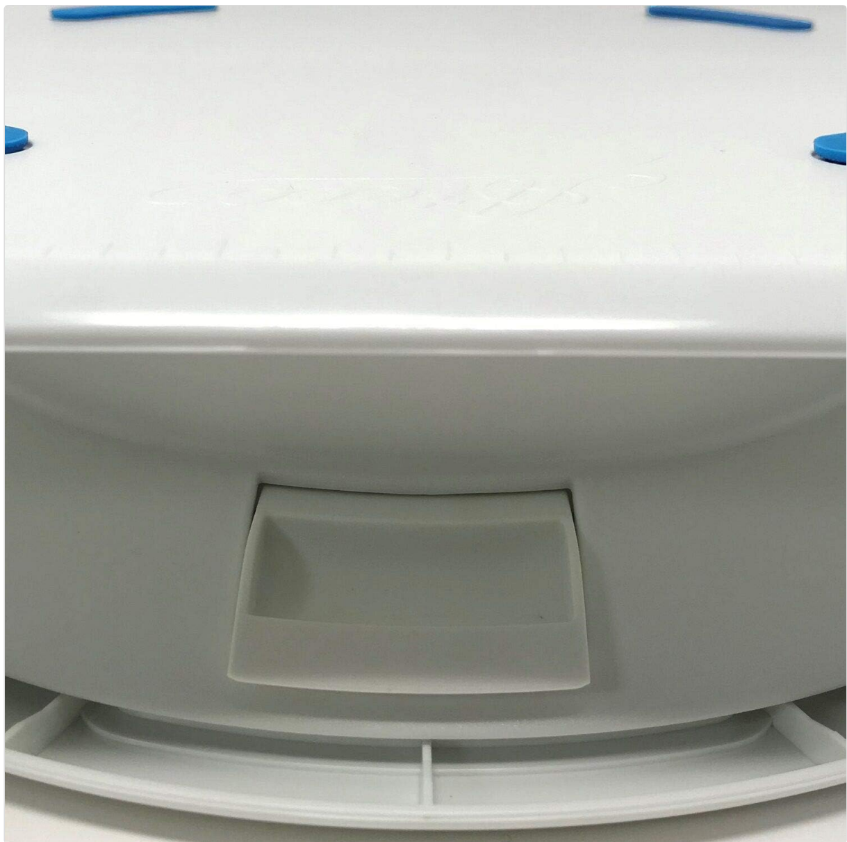
Image 3.1: Detail of the locking mechanism located on the base of the stand, used to secure the turntable.