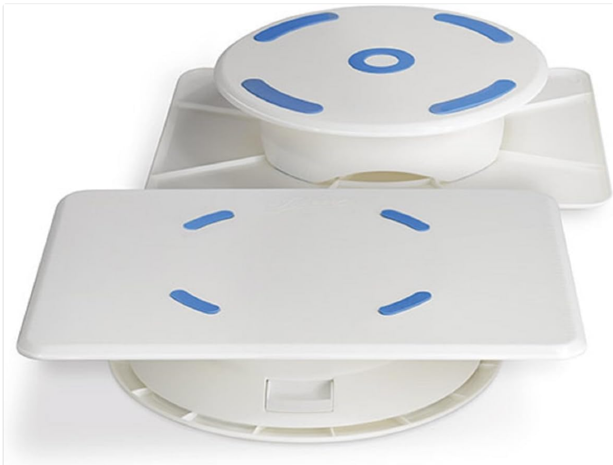
Image 1.1: The Ateco Model 609 stand, showcasing its reversible design with both rectangular and round decorating

The Ateco Model 609 Reversible 2-Sided Revolving Cake Decorating Stand is designed to assist in the decoration of both round and rectangular cakes. This versatile stand features two distinct decorating surfaces: a 12-inch by 16-inch rectangular turntable for sheet cakes and a 12-inch diameter circular turntable for round cakes. Both turntables are equipped with blue non-skid inserts to prevent cake slippage during use and can be locked in place when rotation is not desired. The stand is constructed from durable, food-grade plastic.