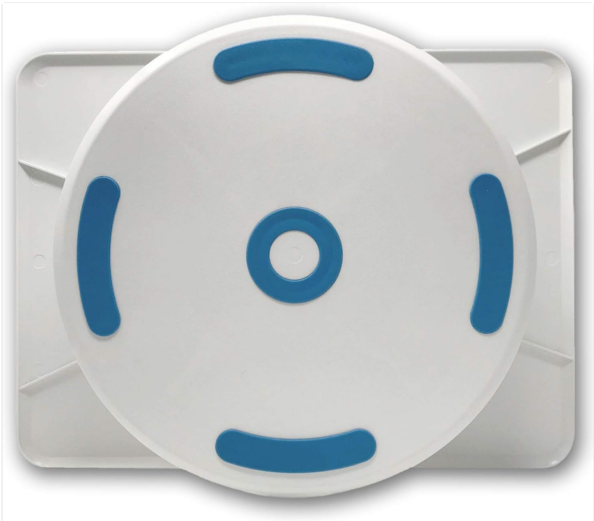
Image 2.2: Top view of the round decorating surface, also with non-skid inserts.