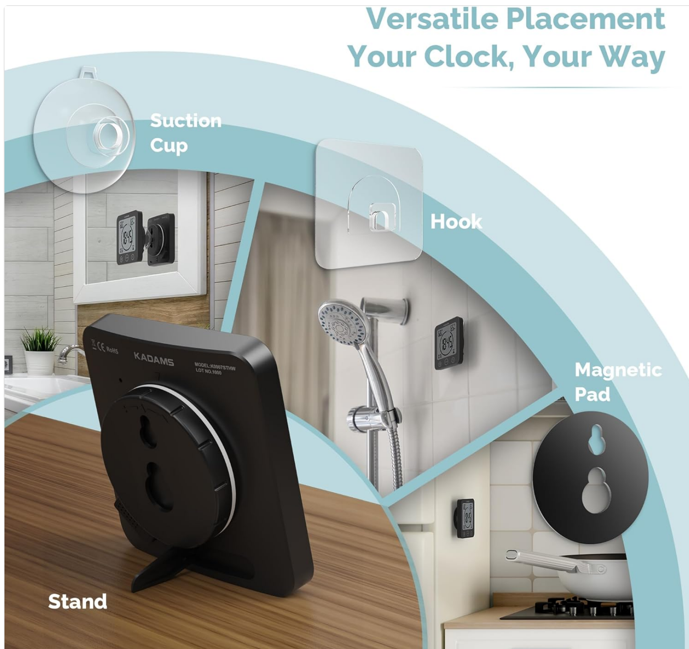
Image: Visual representation of the clock's versatile placement options, including standing on a surface, suction-cupped to a mirror, and magnetically attached to a refrigerator.

granite, and stainless steel. For best adhesion, clean and dry the surface thoroughly, and apply a small amount of moisture to the suction cup before pressing firmly to remove air. Avoid using on textured or porous tiles.