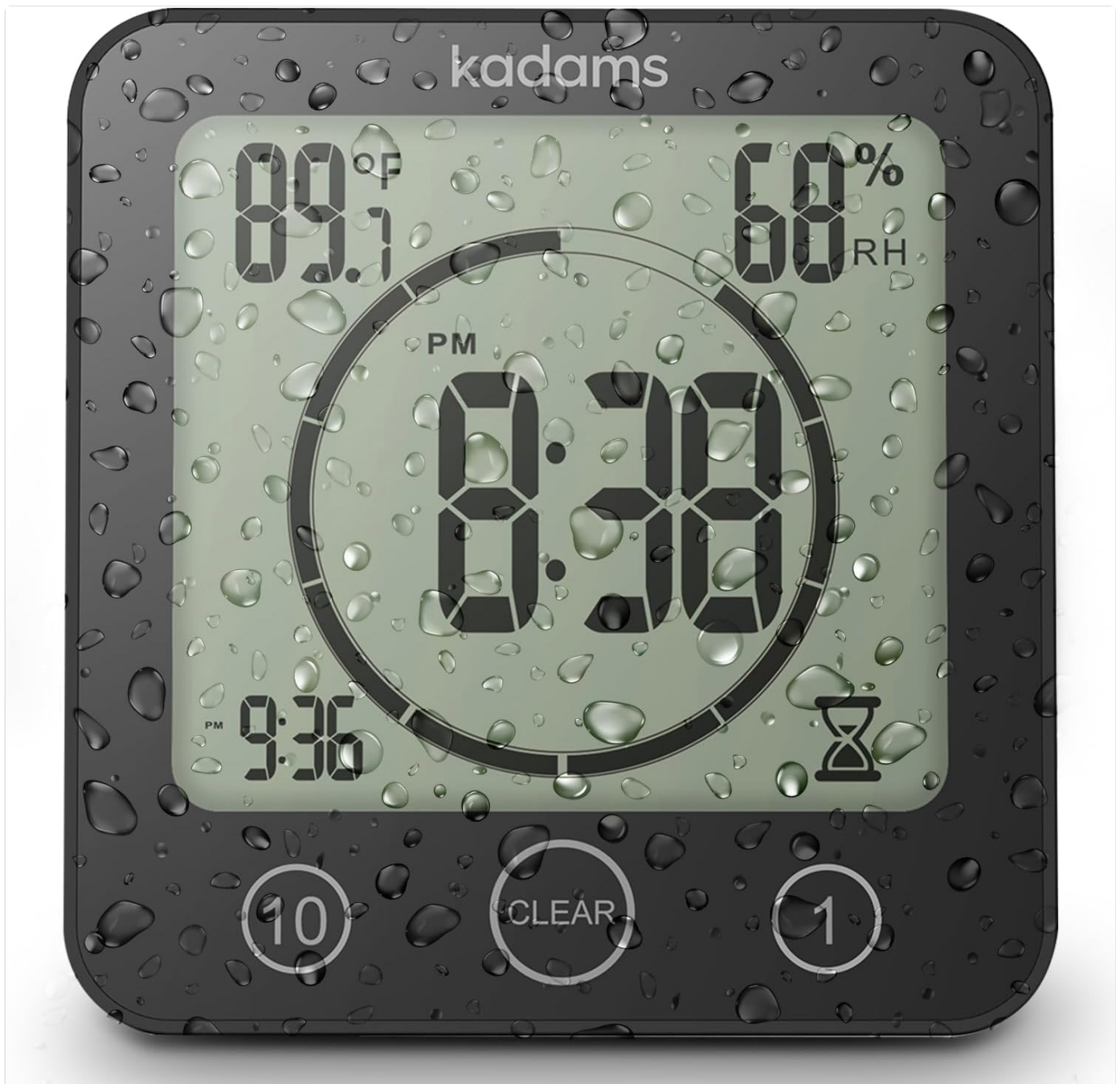
Image: KADAMS Shower Clock displaying time, temperature, and humidity with water droplets on the screen, indicating its waterproof design.