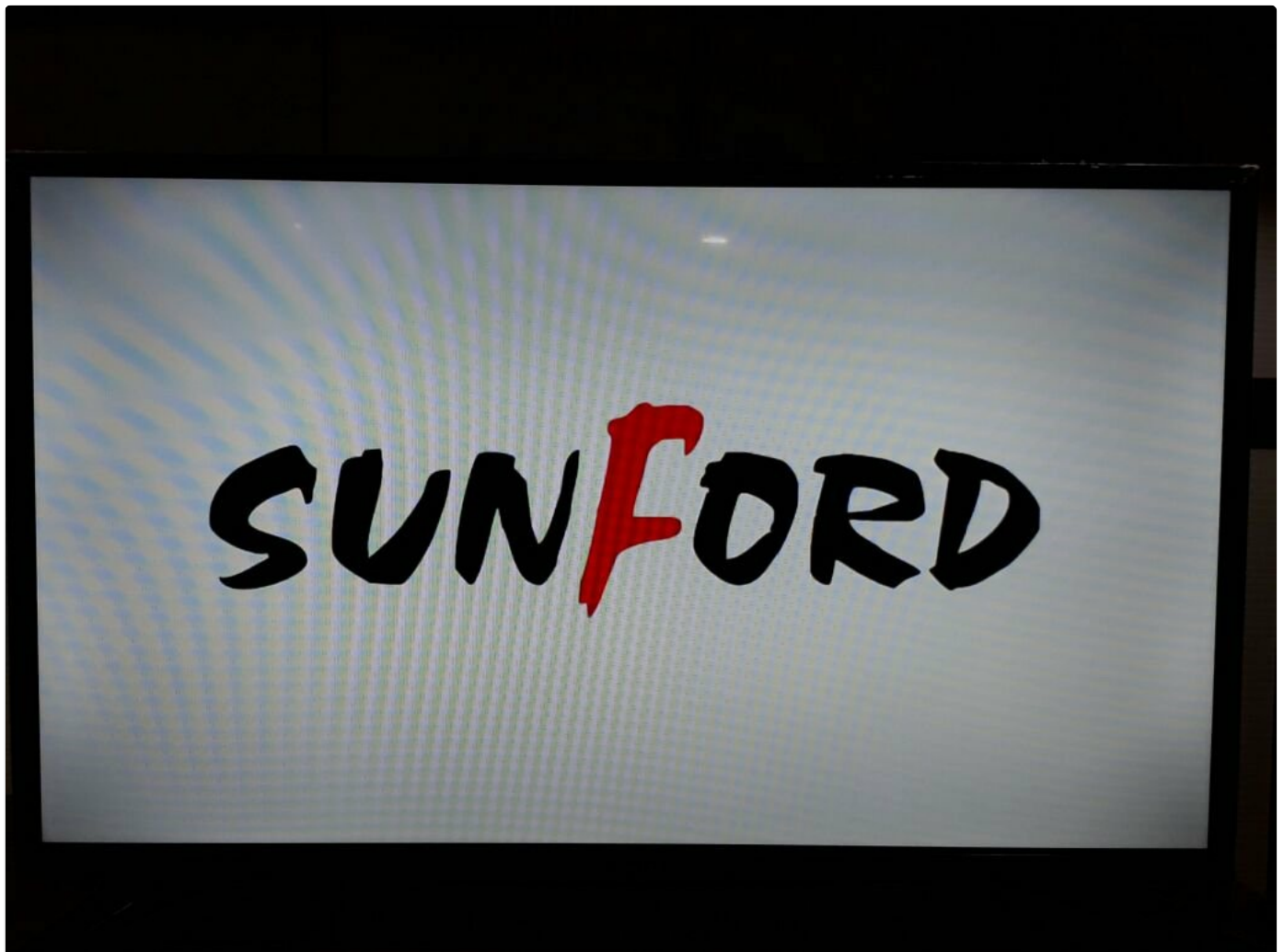
Image: A front view of the SUNFORD 32" LED Television, showcasing its slim bezel and display.