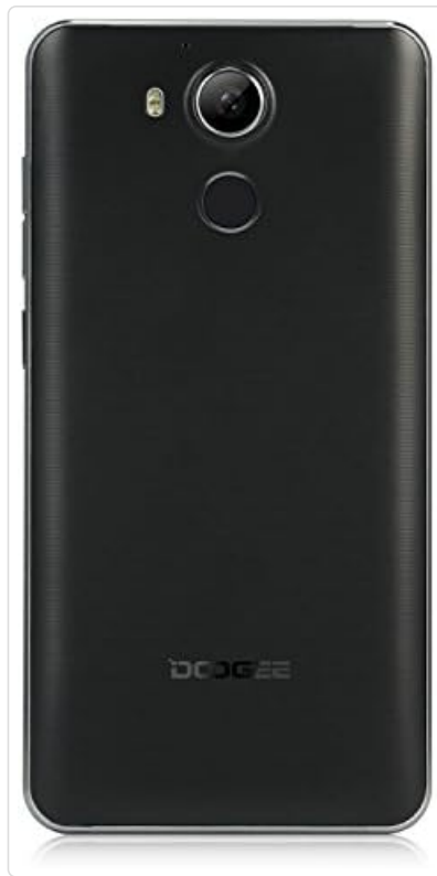
Figure 4.3: Back view of the DOOGEE F7 smartphone, showing the rear camera, LED flash, and fingerprint sensor placement.

The DOOGEE F7 features a sleek design with a 5.5-inch display on the front. The rear panel houses the main camera and a circular fingerprint sensor for secure unlocking. Volume and power buttons are located on the side for easy access.