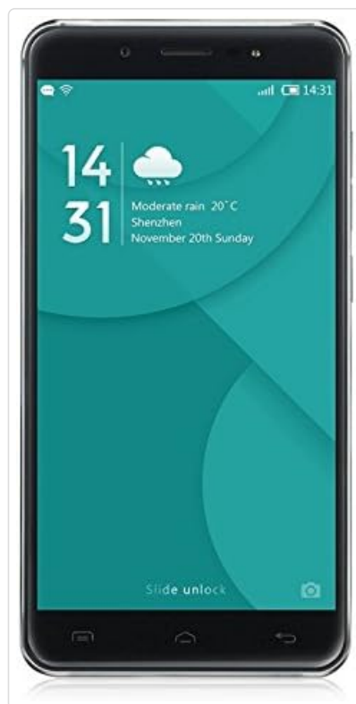
Figure 4.2: Front view of the DOOGEE F7 smartphone, highlighting the 5.5-inch display and front-facing camera.