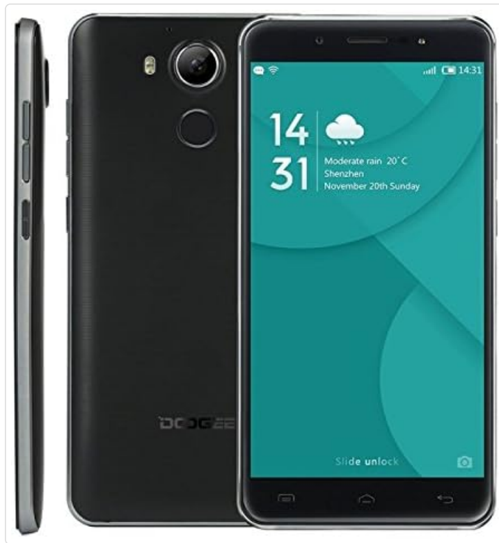
Figure 4.1: Front, back, and side view of the DOOGEE F7 smartphone. This image provides a comprehensive look at the device's design, including the display, rear camera, fingerprint sensor, and side buttons.