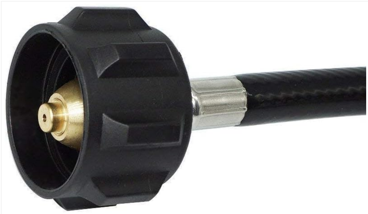
Figure 2: Close-up view of the QCC1/Type1 connector for 5-40lb propane tanks.