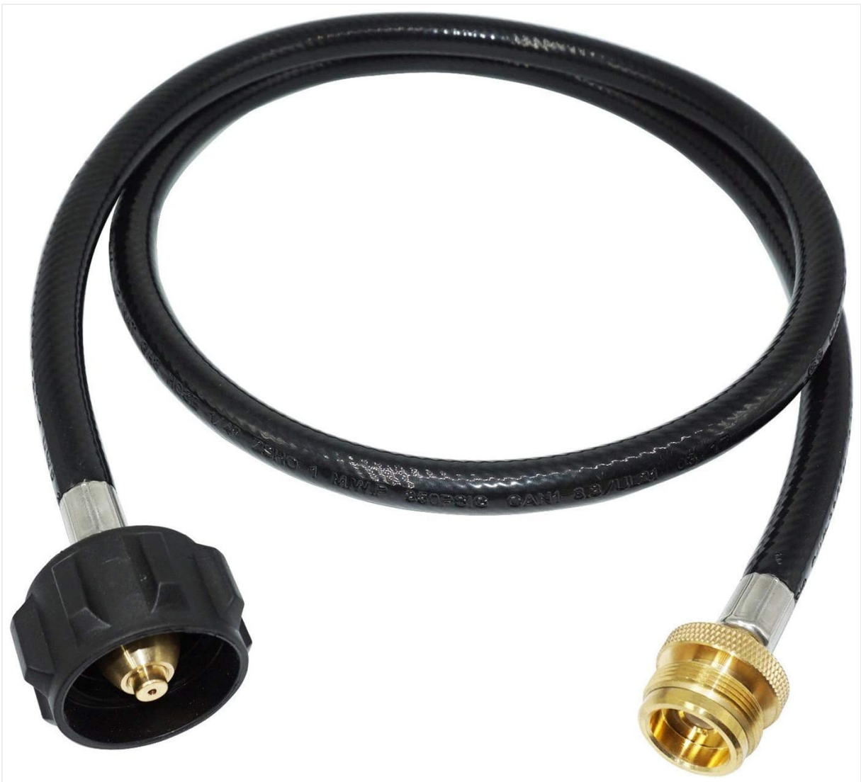
Figure 1: DozyAnt 4-Foot Propane Adapter Hose with QCC1/Type1 connector and 1"-20 throwaway cylinder thread connector.