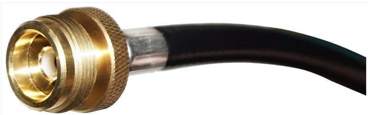
Figure 3: Close-up view of the 1"-20 throwaway cylinder thread connector for 1lb portable appliances.