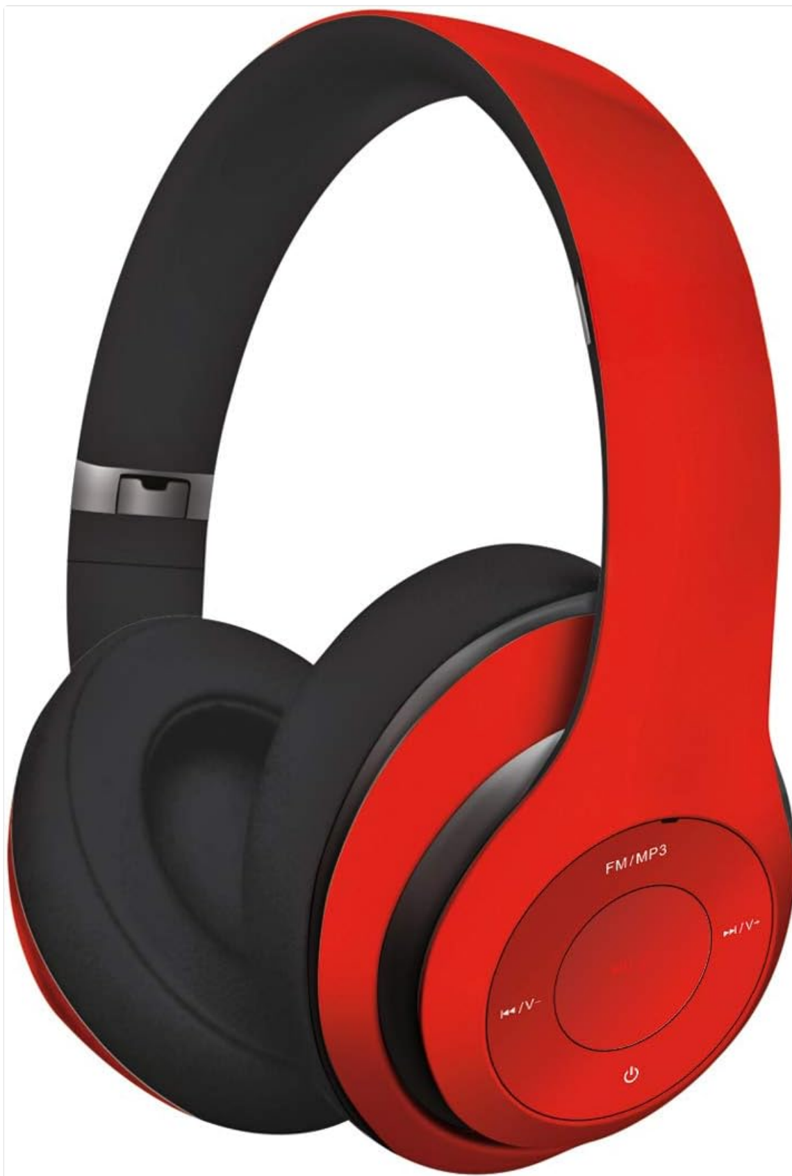
Figure 4.1: Front view of the Omega FREETYLE Freestyle FH0916R Bluetooth Headphones. This image displays the overall design of the red over-ear headphones with black earcups and headband padding.