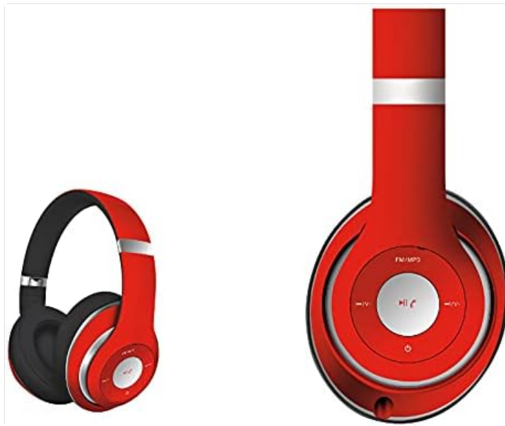
Figure 4.3: Side view of the headphones, illustrating the location of the 3.5mm audio jack, MicroSD card slot, and USB charging port, typically found on the bottom edge of one earcup.