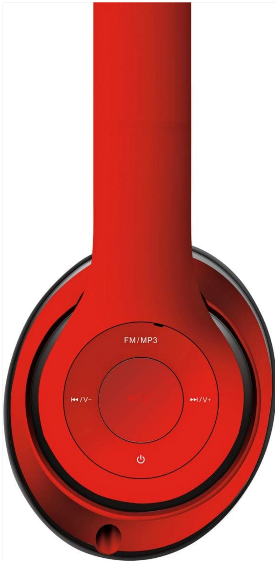
Figure 4.2: Close-up view of the right earcup controls. This image highlights the buttons for FM/MP3 mode, previous track/volume down, next track/volume up, and the power/play/pause button.