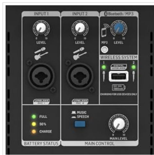
Figure 5: The rear panel of the MPA100BT features inputs for microphones, auxiliary devices, and controls for volume and wireless system pairing.

The rear panel provides all necessary inputs and controls for the MPA100BT.