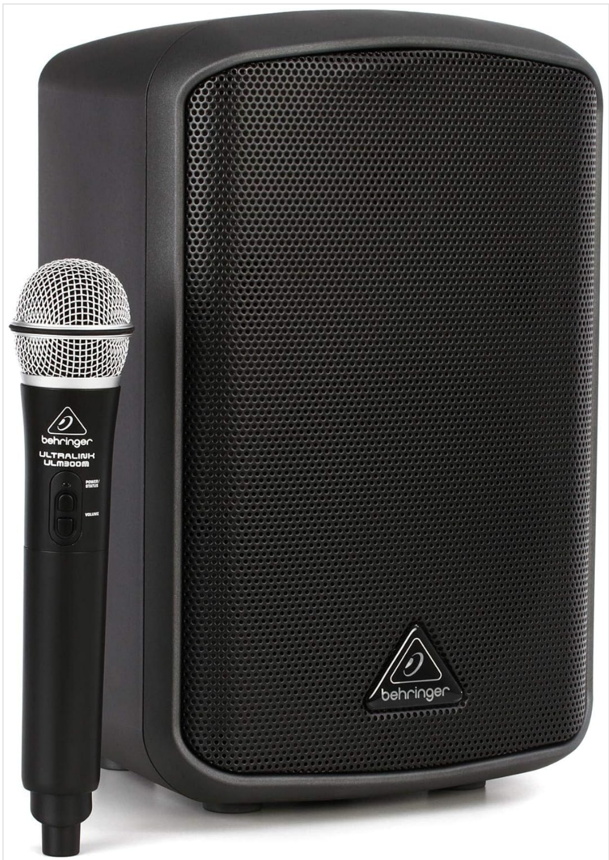
Figure 1: Behringer MPA100BT Portable PA System with Wireless Microphone. The system includes a compact speaker unit and a handheld wireless microphone.