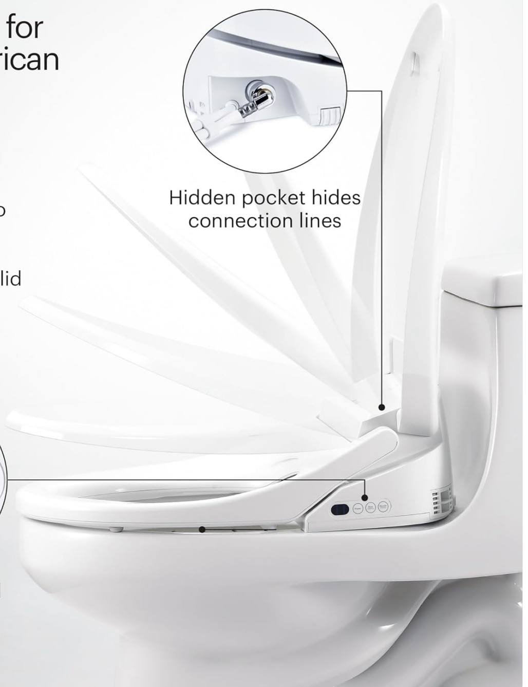
Image: Side view of the bidet seat highlighting the hidden pocket for connections and the convenient side control panel.

Access essential features with convenient side control panel