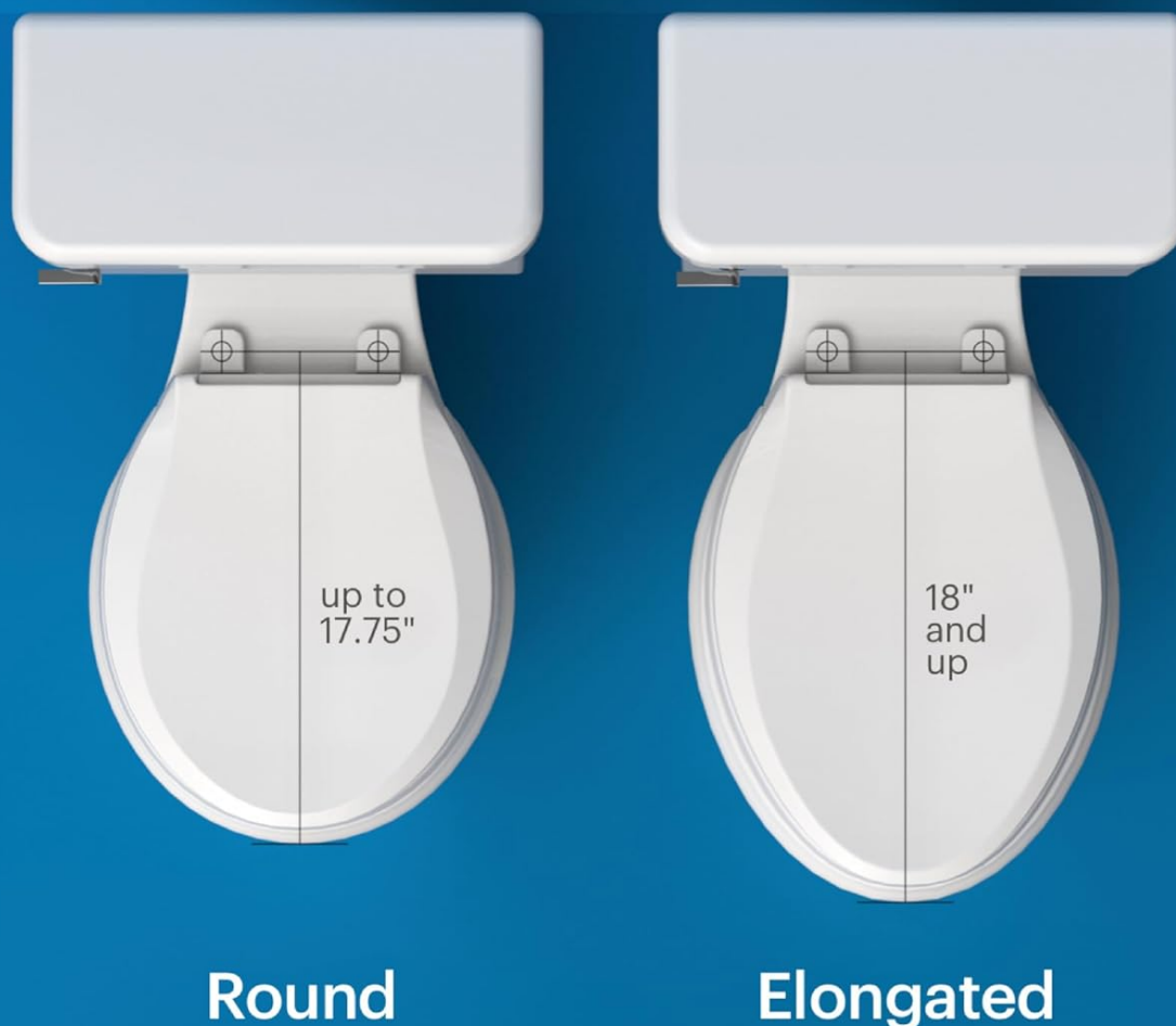
Image: Diagram illustrating the difference between round and elongated toilet bowl sizes, confirming the S1400 is for elongated models (18 inches and up).