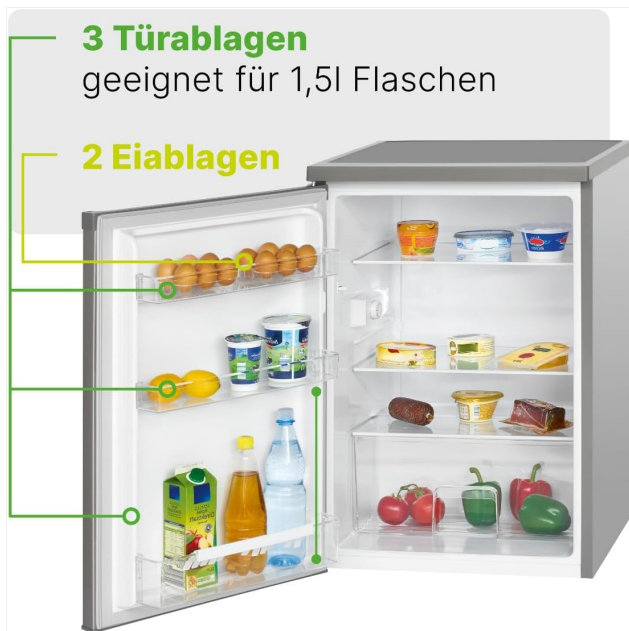
Figure 2.2: Interior view with 3 glass shelves (2 adjustable) and a transparent vegetable compartment.