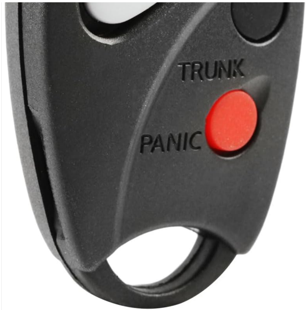
Image 1.1: Front view of the USARemote Key Fob, showing Lock, Unlock, and Panic buttons.