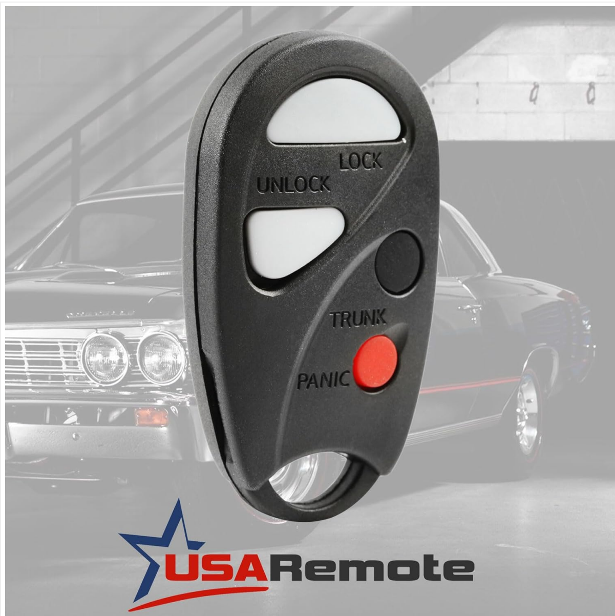
Image 4.1: The key fob displaying its buttons for lock, unlock, and panic functions.