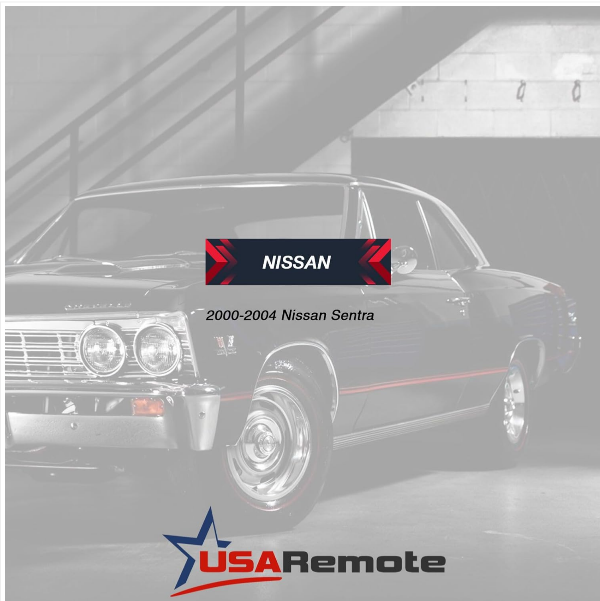
Image 2.1: Visual confirmation of key fob compatibility with 2000-2004 Nissan Sentra.