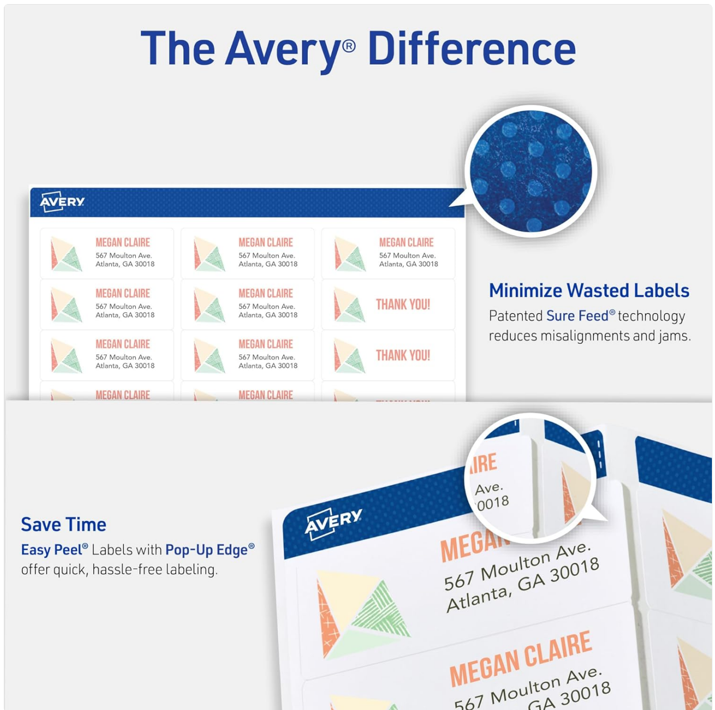
Figure 6: The Avery Easy Peel Feature.

The Easy Peel with Pop-up Edge feature allows for quick and hassle-free removal of labels from the sheet. Simply bend the sheet along the perforations to expose the label edges, then peel and apply.