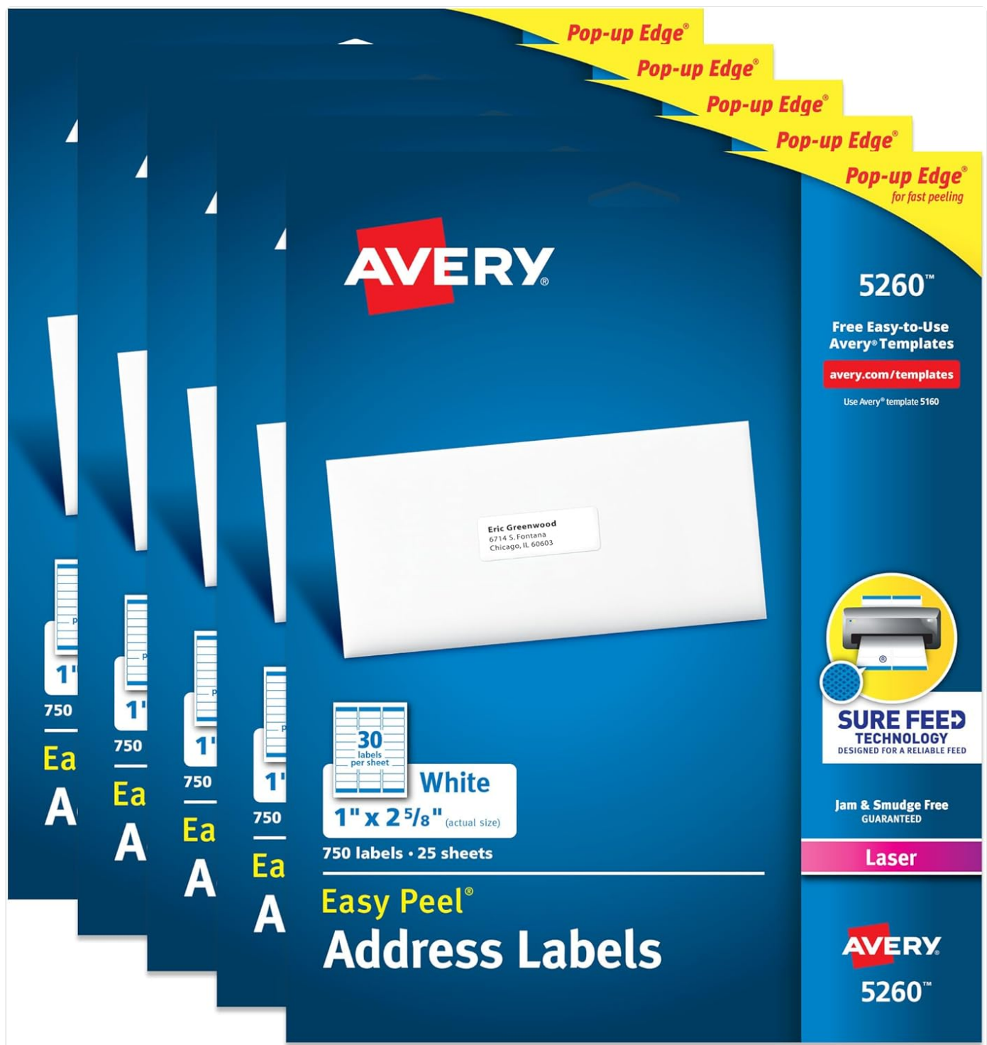
Figure 1: Avery Easy Peel Printable Address Labels (Model 5260) 5-Pack.