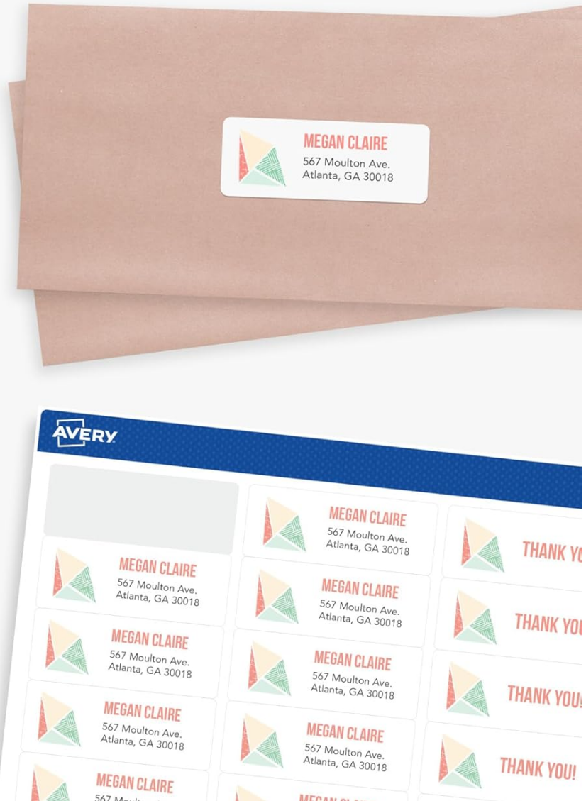
Figure 2: Key Features of Avery Labels.