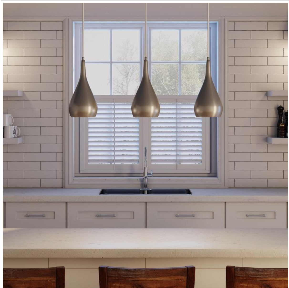
Figure 2: The 3-light multi pendant fixture installed in a kitchen setting, showcasing its matte nickel finish and adjustable