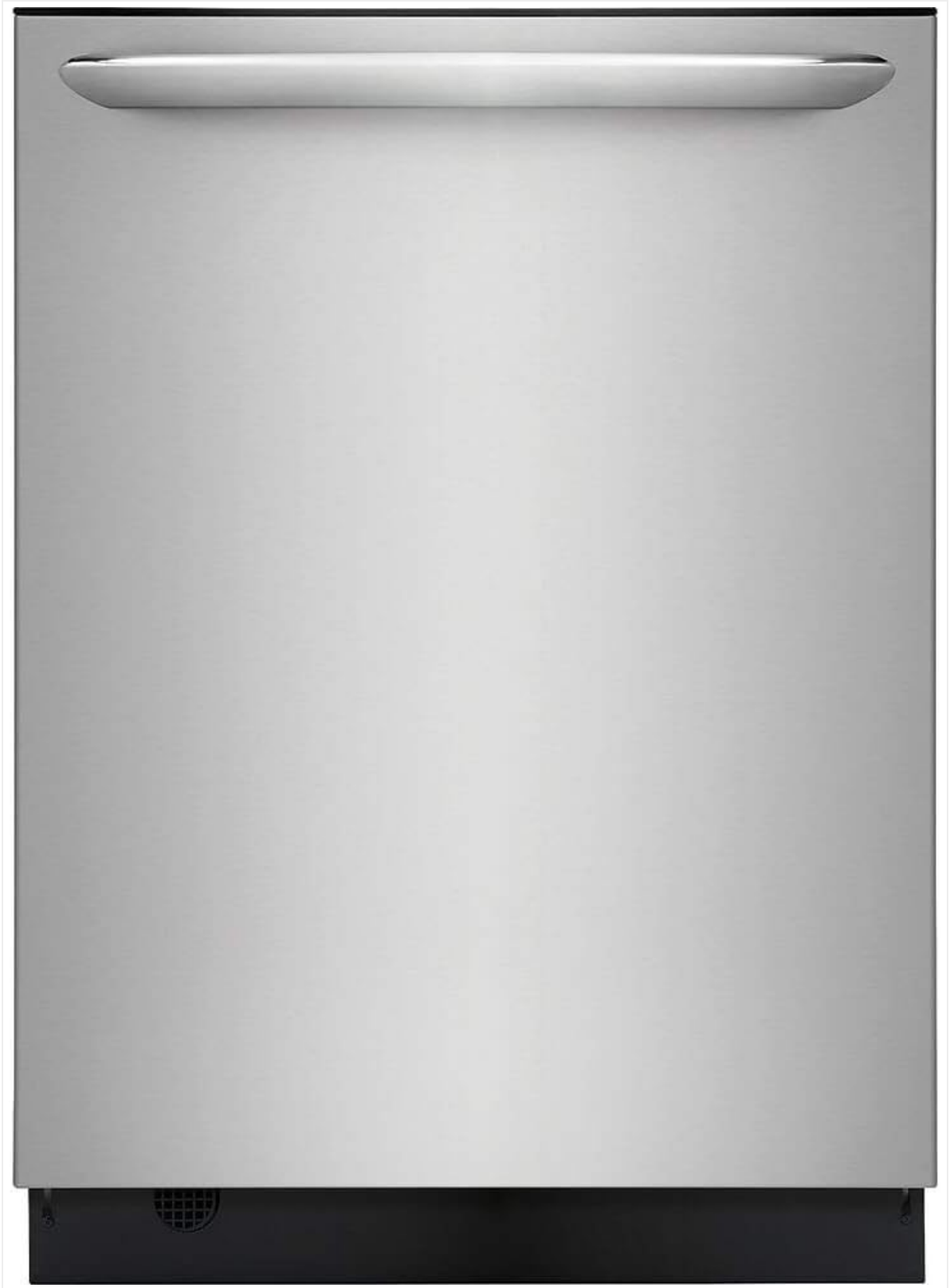
Figure 1.1: Frigidaire FGID2479SF Dishwasher (Front View)