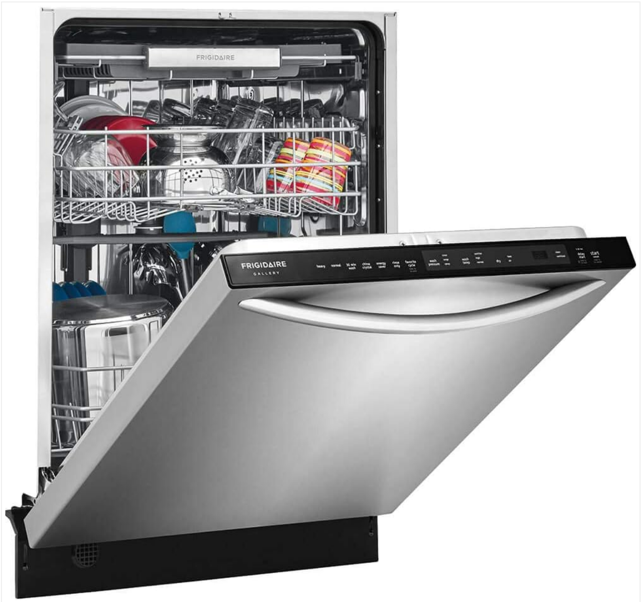
Figure 3.1: Dishwasher ready for installation

The Frigidaire FGID2479SF is a built-in dishwasher and requires professional installation. Ensure proper water supply, drainage, and electrical connections are established according to local codes and the provided installation guide. The unit is designed to fit standard 24-inch wide openings.