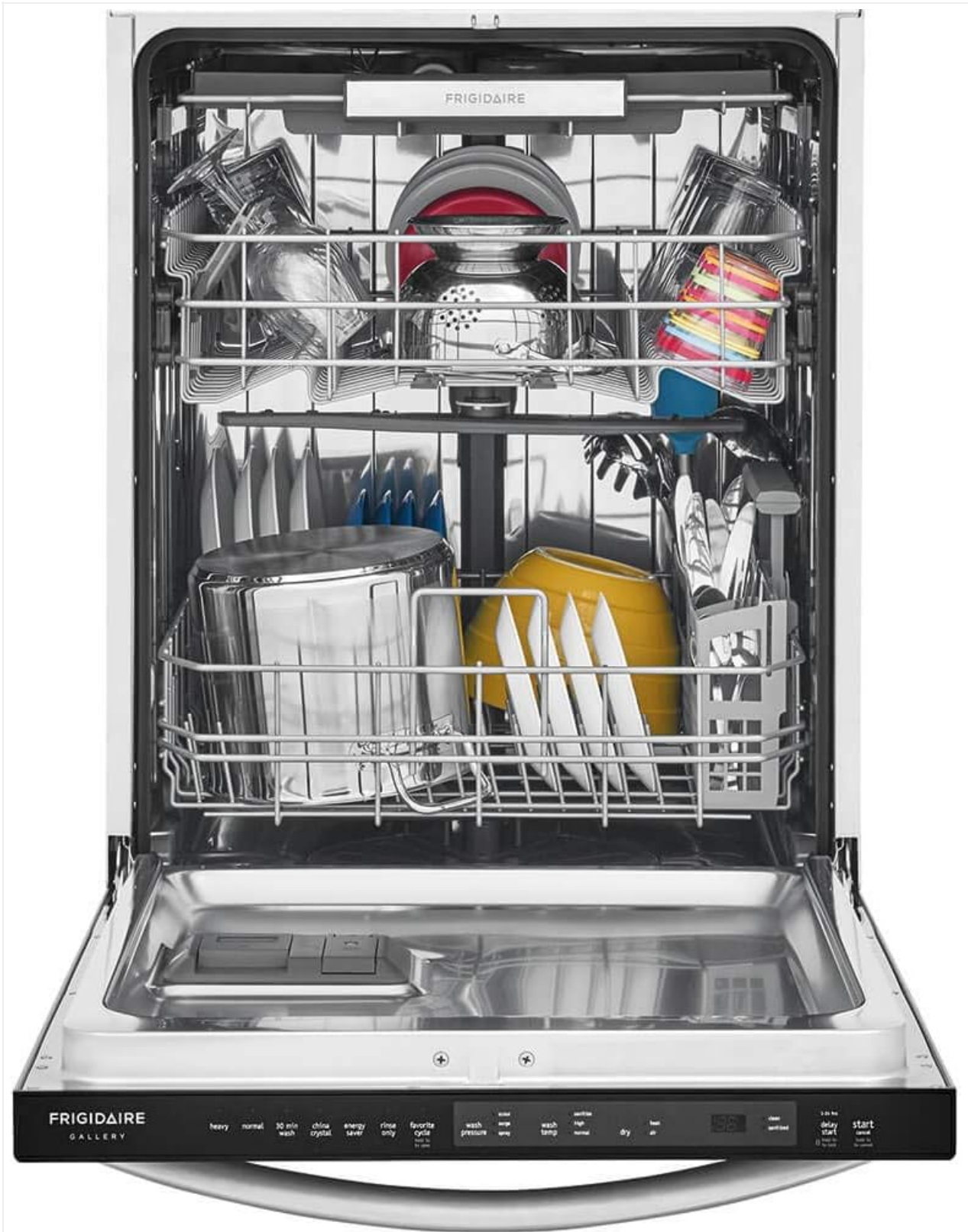
Figure 5.1: Properly Loaded Dishwasher