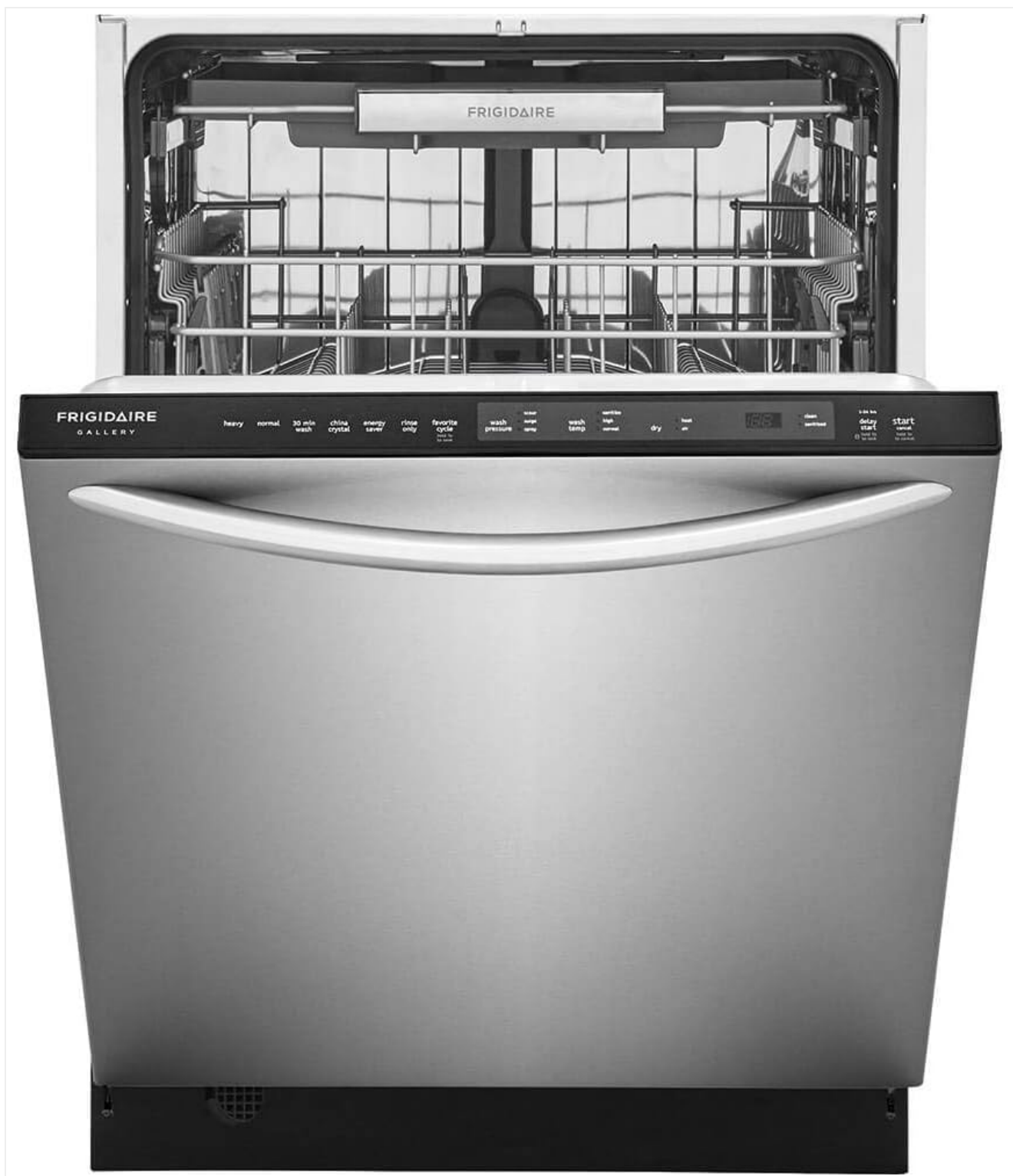
Figure 4.1: Control Panel