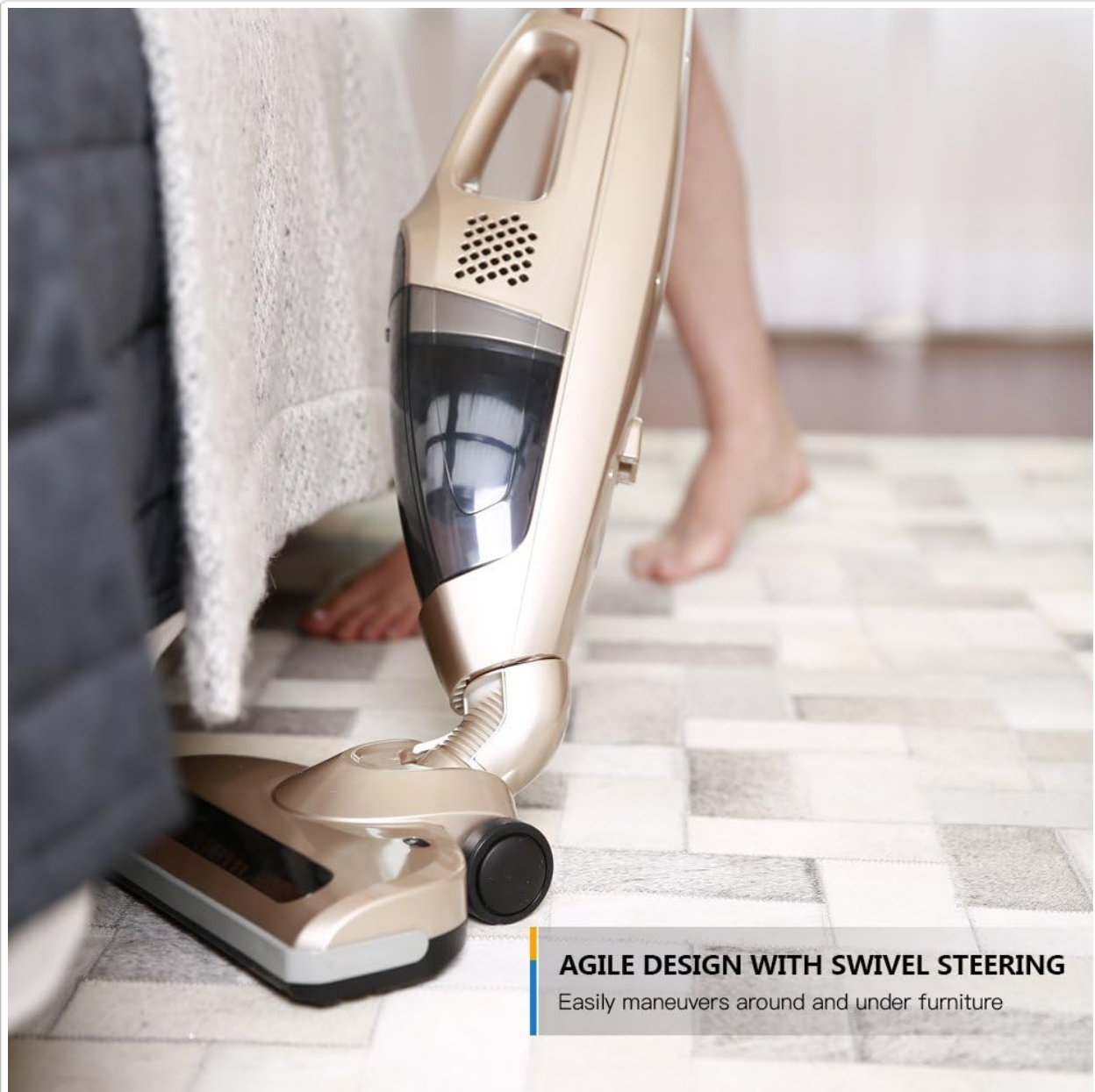
Figure 3: The flexible swivel steering allows the vacuum to maneuver easily around and under furniture, reaching difficult spots.