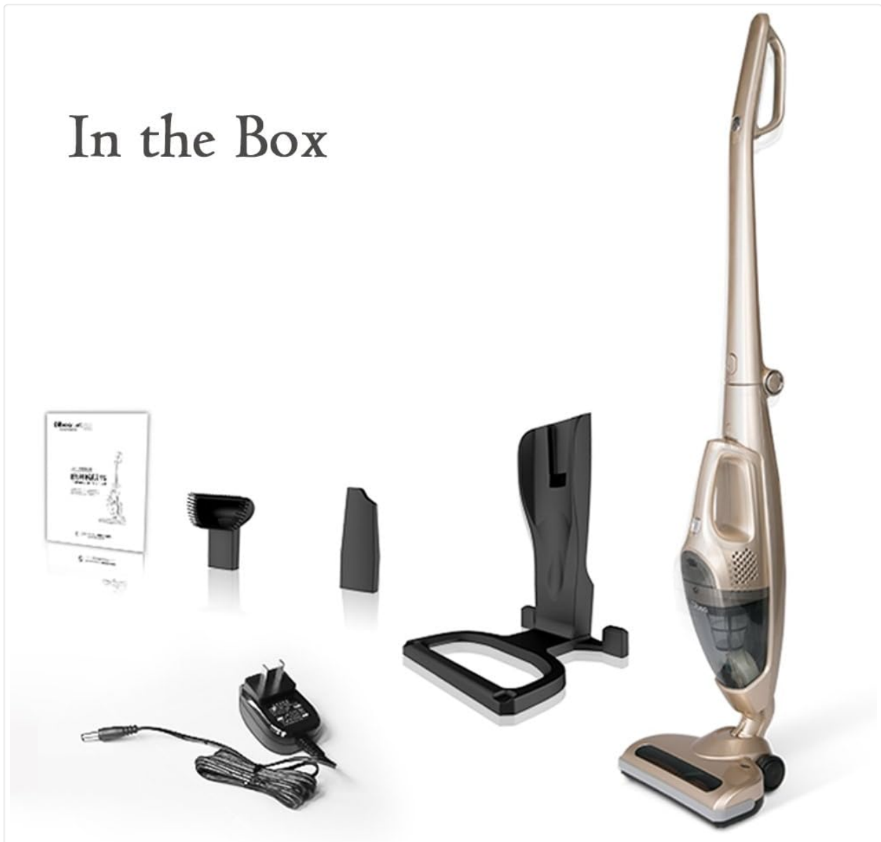
Figure 1: The package includes the main vacuum unit, a charging base, power adapter, crevice tool, and the user manual.

The Dibea KB-9008 Cordless Upright Vacuum Cleaner comes with several components designed for versatile cleaning. Familiarize yourself with each part before assembly and operation.