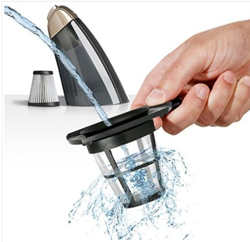
Figure 6: The vacuum's filter is washable, allowing for easy maintenance and prolonged filter life. Ensure the filter is completely dry before reinserting.