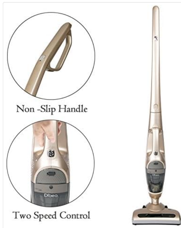
Figure 5: Features a non-slip handle for comfortable grip and a two-speed control button to adjust suction power for different cleaning needs.