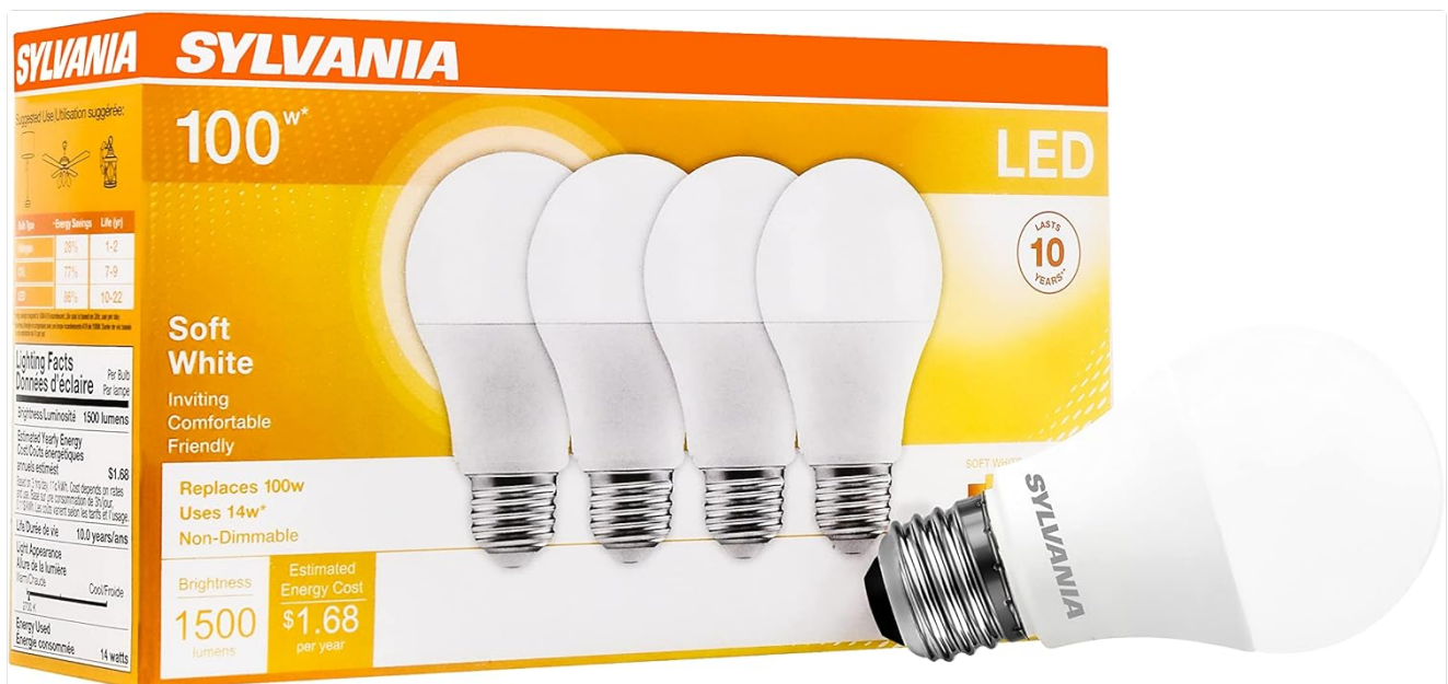
Figure 1: Sylvania LED A19 Light Bulb (4-pack) and individual bulb.

The bulbs are non-dimmable and feature a frosted finish. They are suitable for various indoor and outdoor applications, excluding fully enclosed fixtures. Each bulb has an estimated lifespan of 11,000 hours.