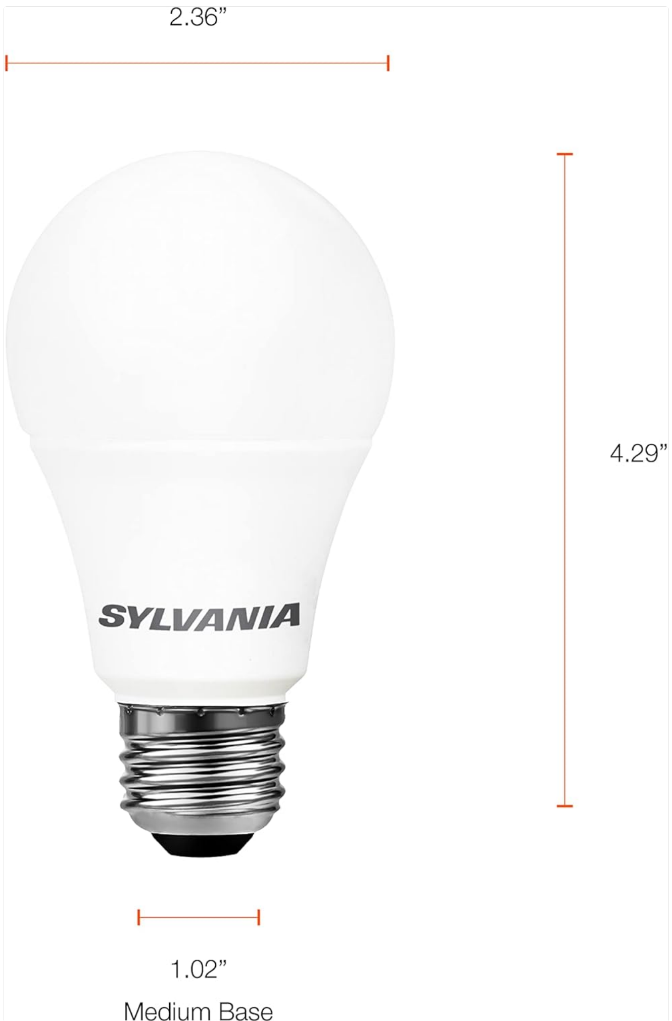
Figure 4: Physical dimensions of the Sylvania A19 LED bulb.