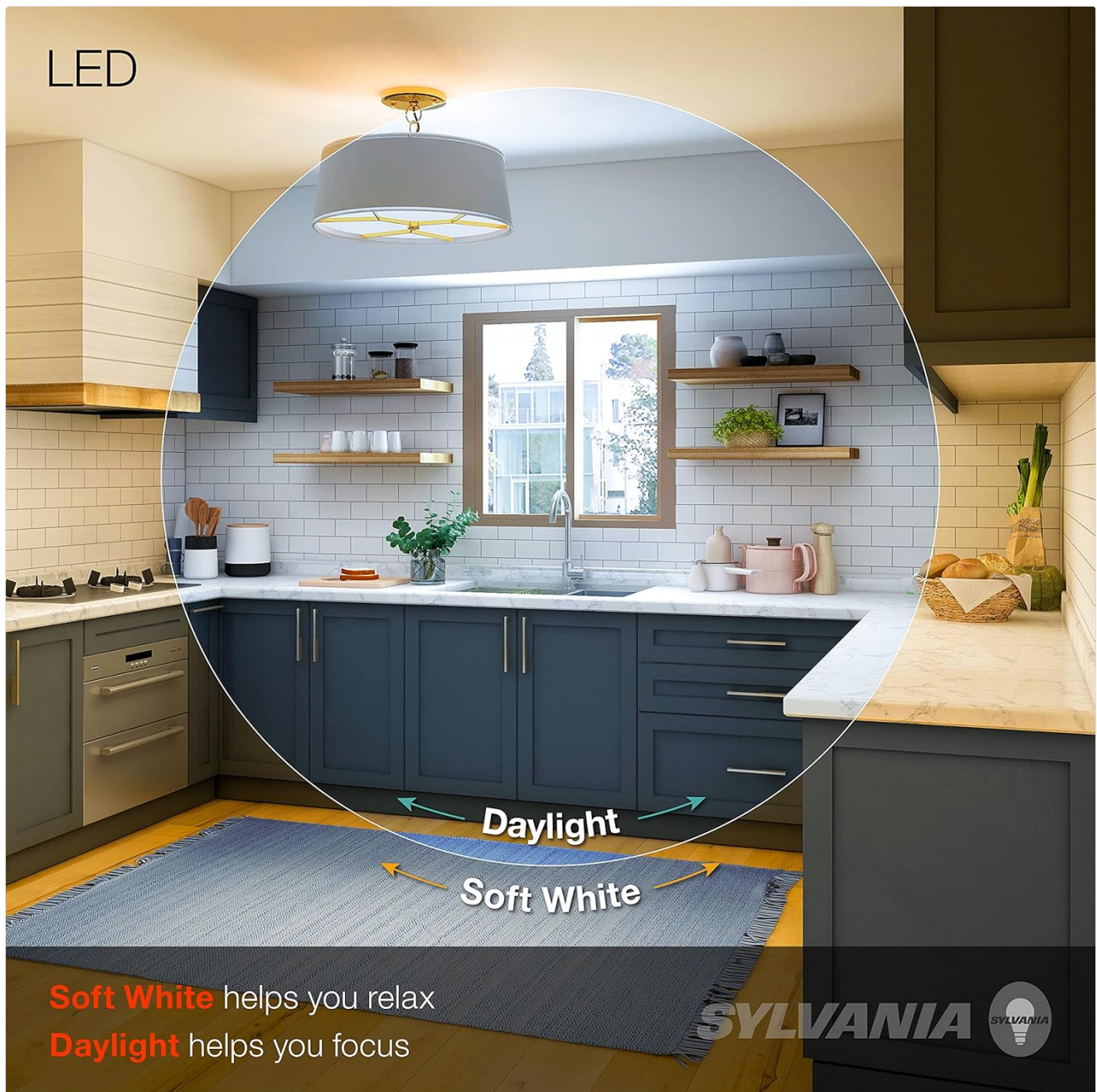
Figure 3: Comparison of Soft White and Daylight illumination in a kitchen setting.