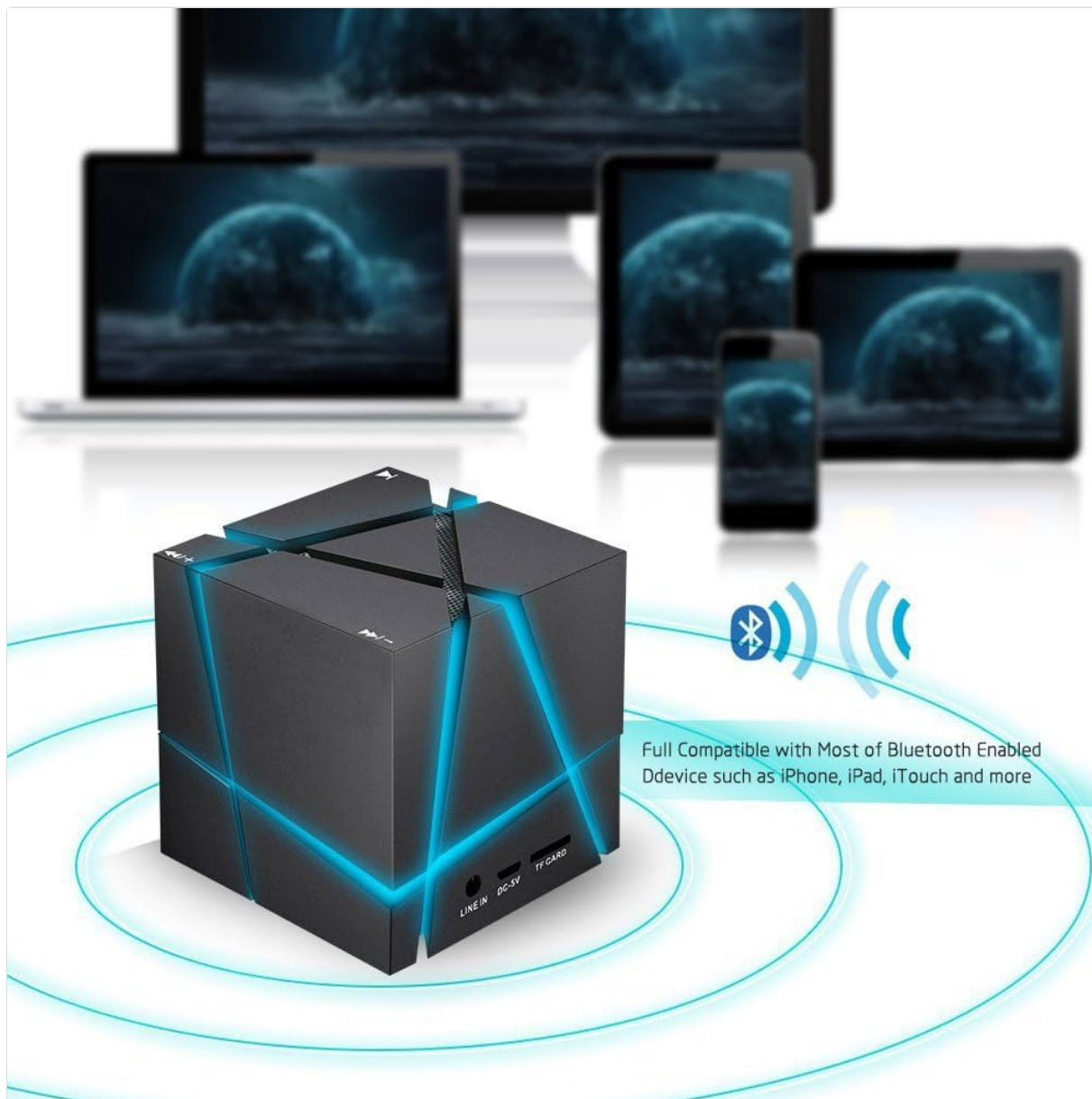
Image: The speaker demonstrating Bluetooth connectivity with multiple devices.

The speaker supports Bluetooth 4.0 technology with a transmission distance of up to 10 meters (32.8 feet).