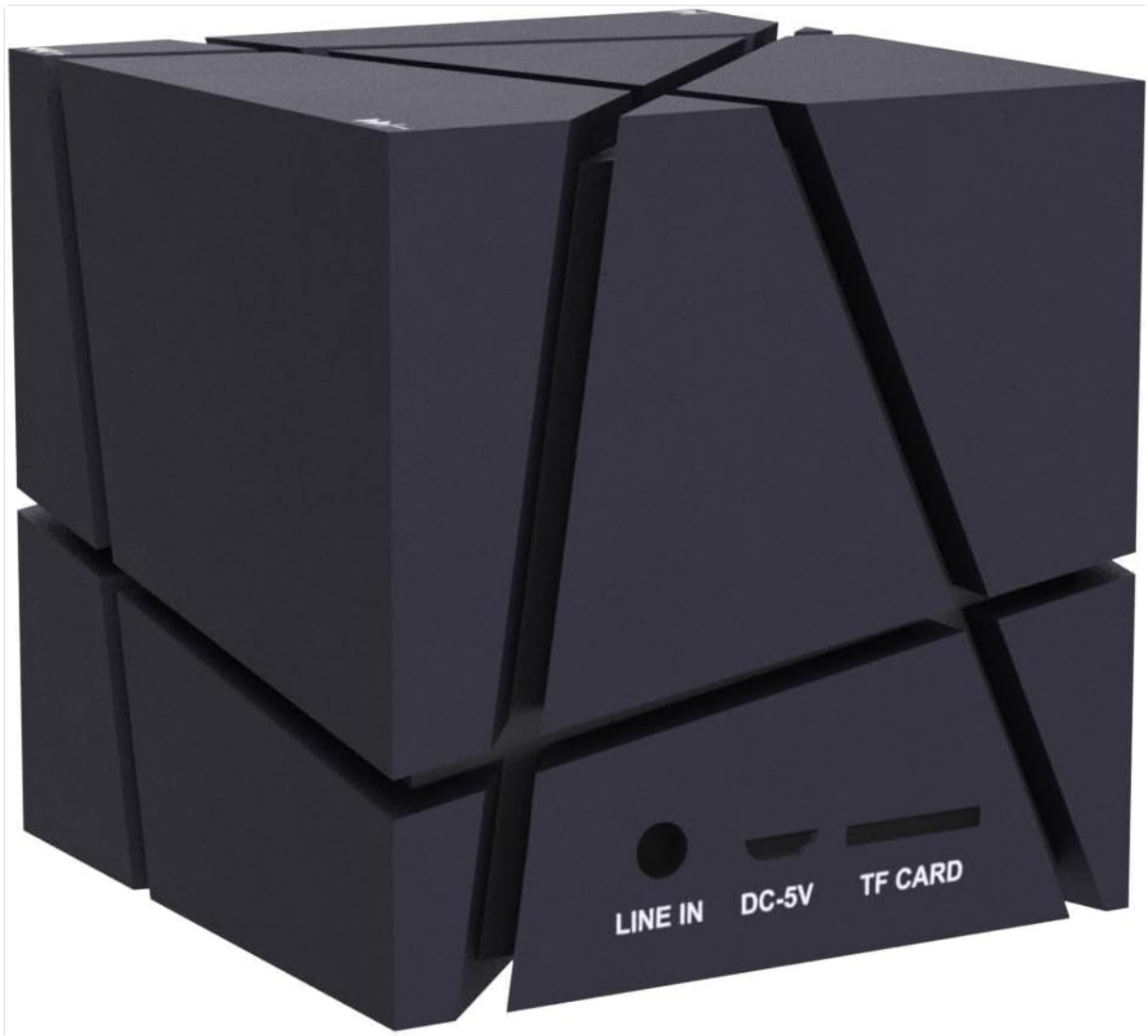
Image: Rear view of the speaker showing the LINE IN, DC-5V charging, and TF CARD slots.