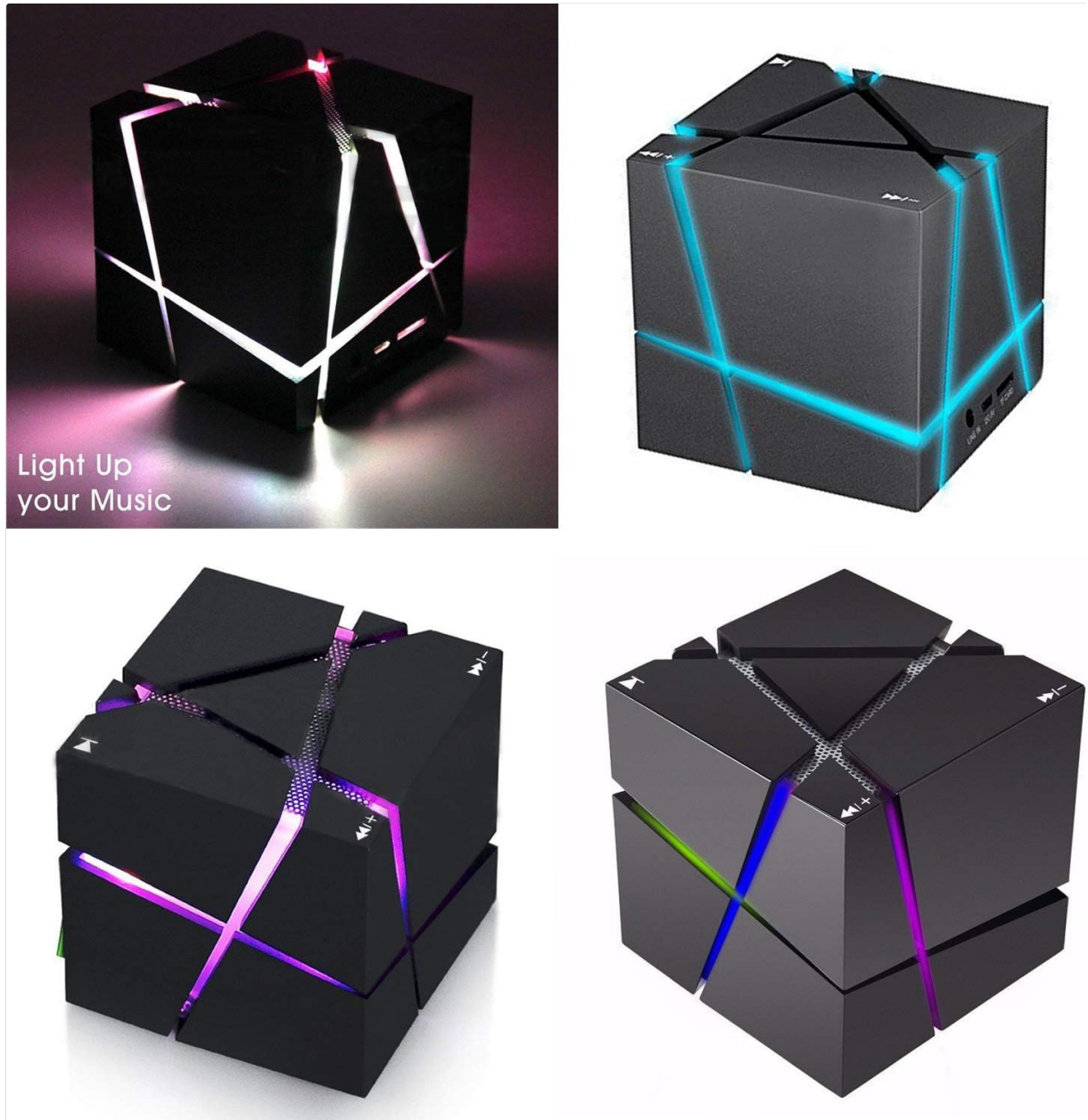
Image: The speaker showcasing its colorful LED light feature.

The speaker features dynamic colorful LED lights. To turn off the lights, press the Minus (-) button twice in quick succession .