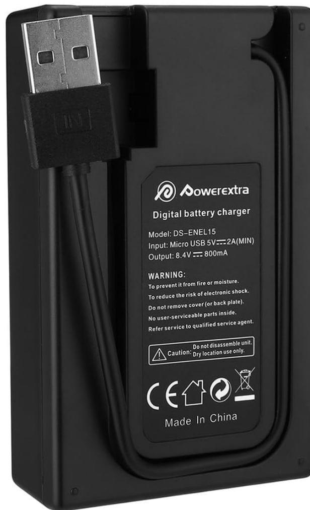
Figure 3.1: The integrated USB cable folds neatly into the back of the charger for easy transport.

The USB cable is folded in the charger backside, easy to carry around when out or travel