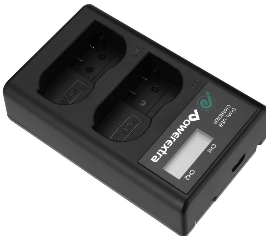
Figure 5.1: The charger incorporates multiple safety protections for reliable use.