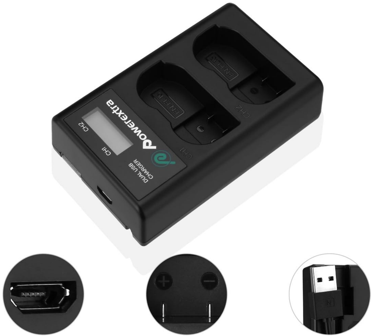
Figure 8.1: The charger's compact design makes it easy to store and maintain.