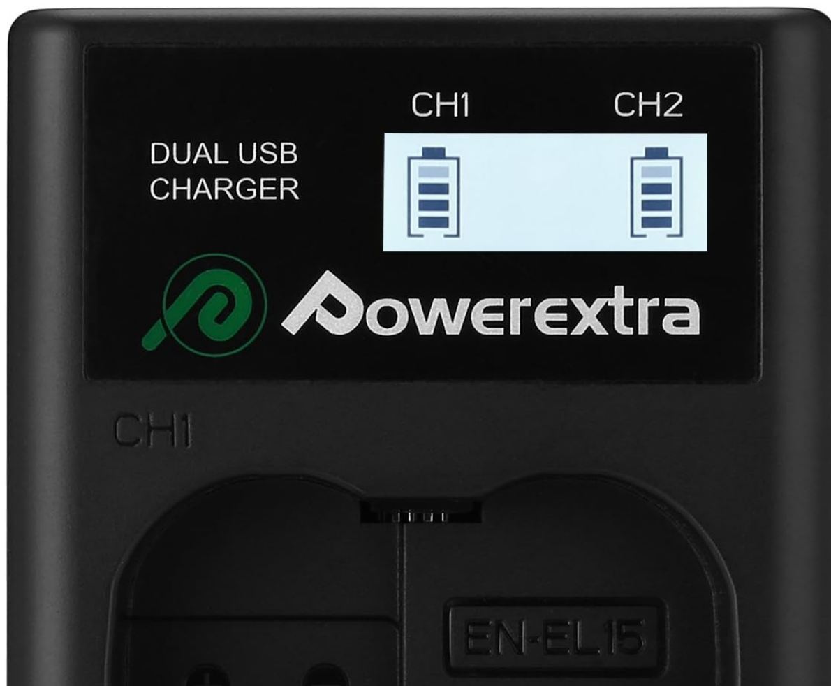
Figure 4.2: The intelligent LCD display provides real-time charging status and capacity for each battery.