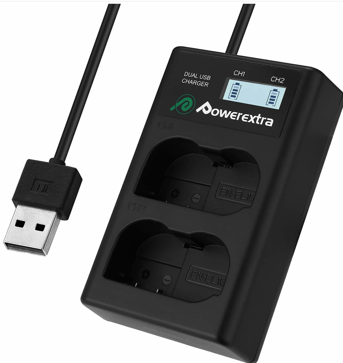
Figure 9.1: Powerextra Dual USB Battery Charger.