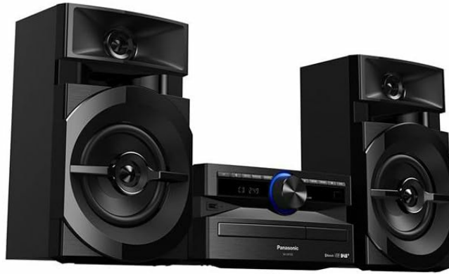
Image: The Panasonic SC-UX102E-K Mini System, featuring the central unit and two speakers.