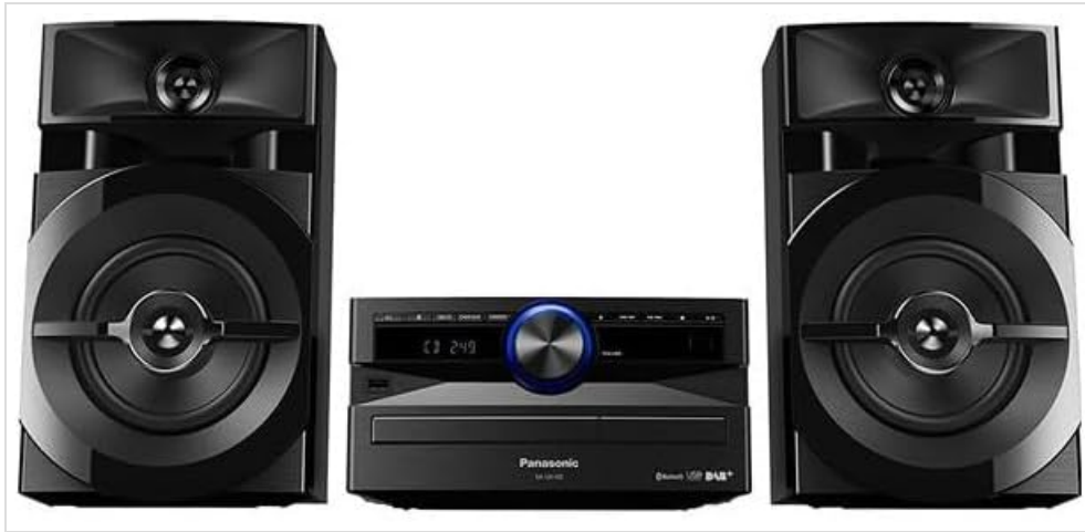
Image: Front panel of the main unit, showing the display and control buttons.