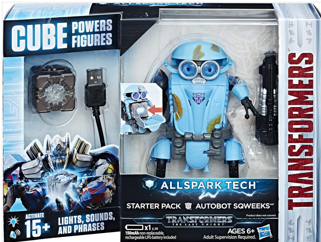
Image 1.1: The Transformers Allspark Tech Autobot Sqweeks figure, Allspark Tech cube, and USB charging cord as packaged.

The Transformers Allspark Tech Autobot Sqweeks figure is an interactive action figure designed to be powered by the Allspark Tech cube. This figure features motion-activated lights, sounds, and phrases when connected to an Allspark Tech cube. The Autobot Sqweeks figure is a 5.5-inch scale non-converting figure.