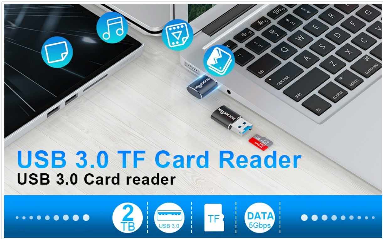
Image: Diagram illustrating the Rocketek TFU3R's compatibility with tablets and laptops, showing a Micro SD card being inserted.