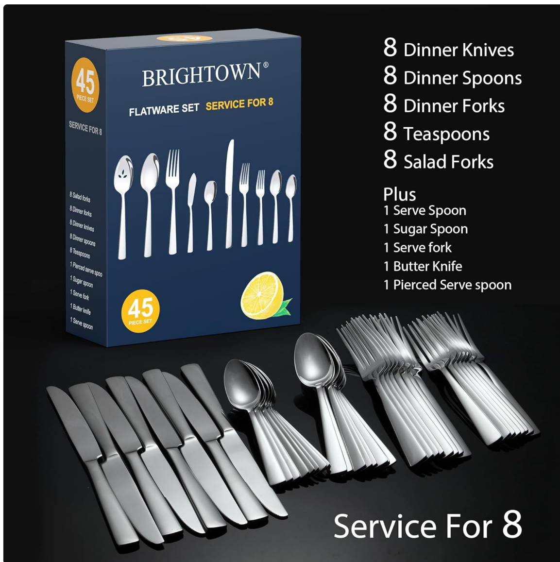
Image: A complete display of all 45 individual pieces from the flatware set.