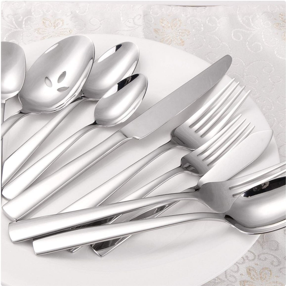
Image: A dining table set with the Brighttown flatware, illustrating its aesthetic appeal in a meal setting.