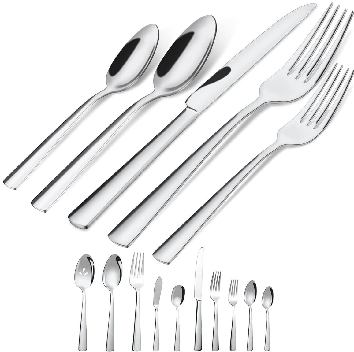
Image: The Brighttown 45-Piece Flatware Set box, illustrating the complete collection of utensils.