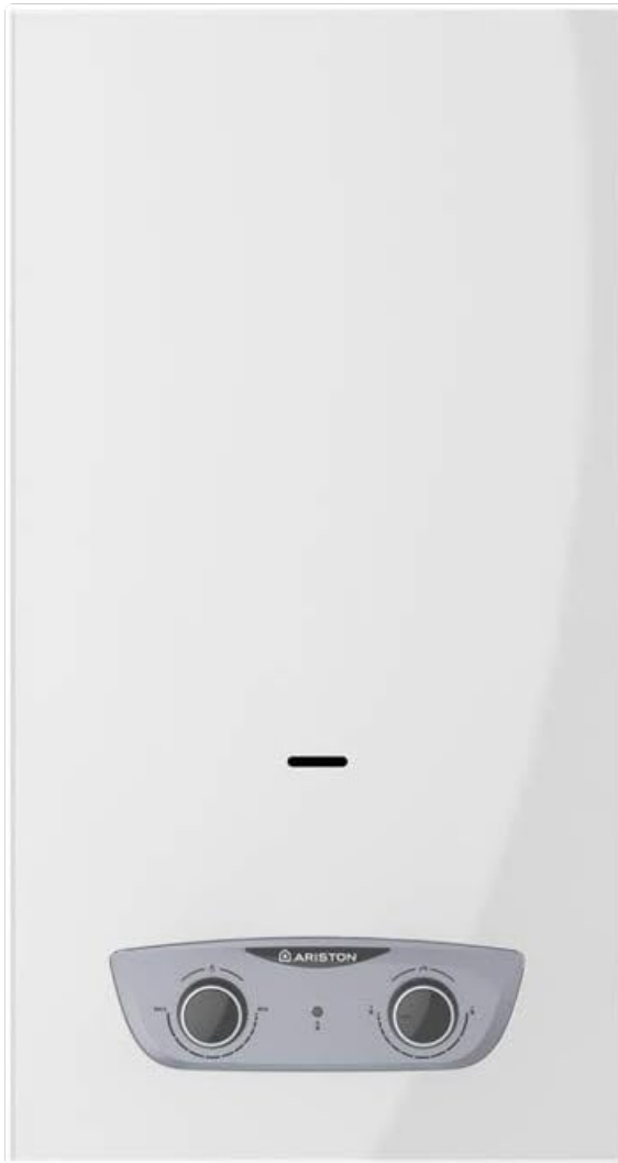
Figure 1: Front view of the Ariston Fast R 11 Instant Gas Water Heater, showing its compact white casing and control knobs at the bottom.