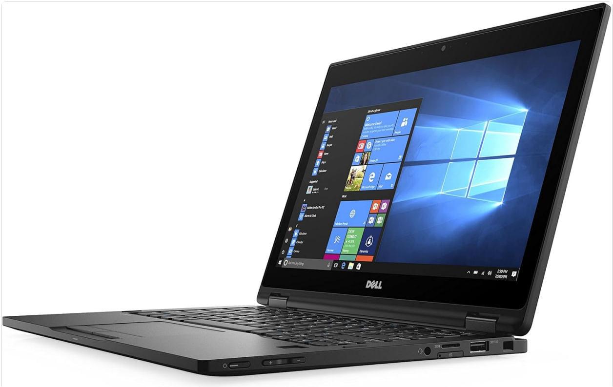
Figure 1: Dell Latitude 5289 2-in-1 Laptop in open position, displaying the Windows 10 Pro operating system on its screen and the full keyboard.

Please read this manual thoroughly to ensure proper use and to maximize the performance and longevity of your device.