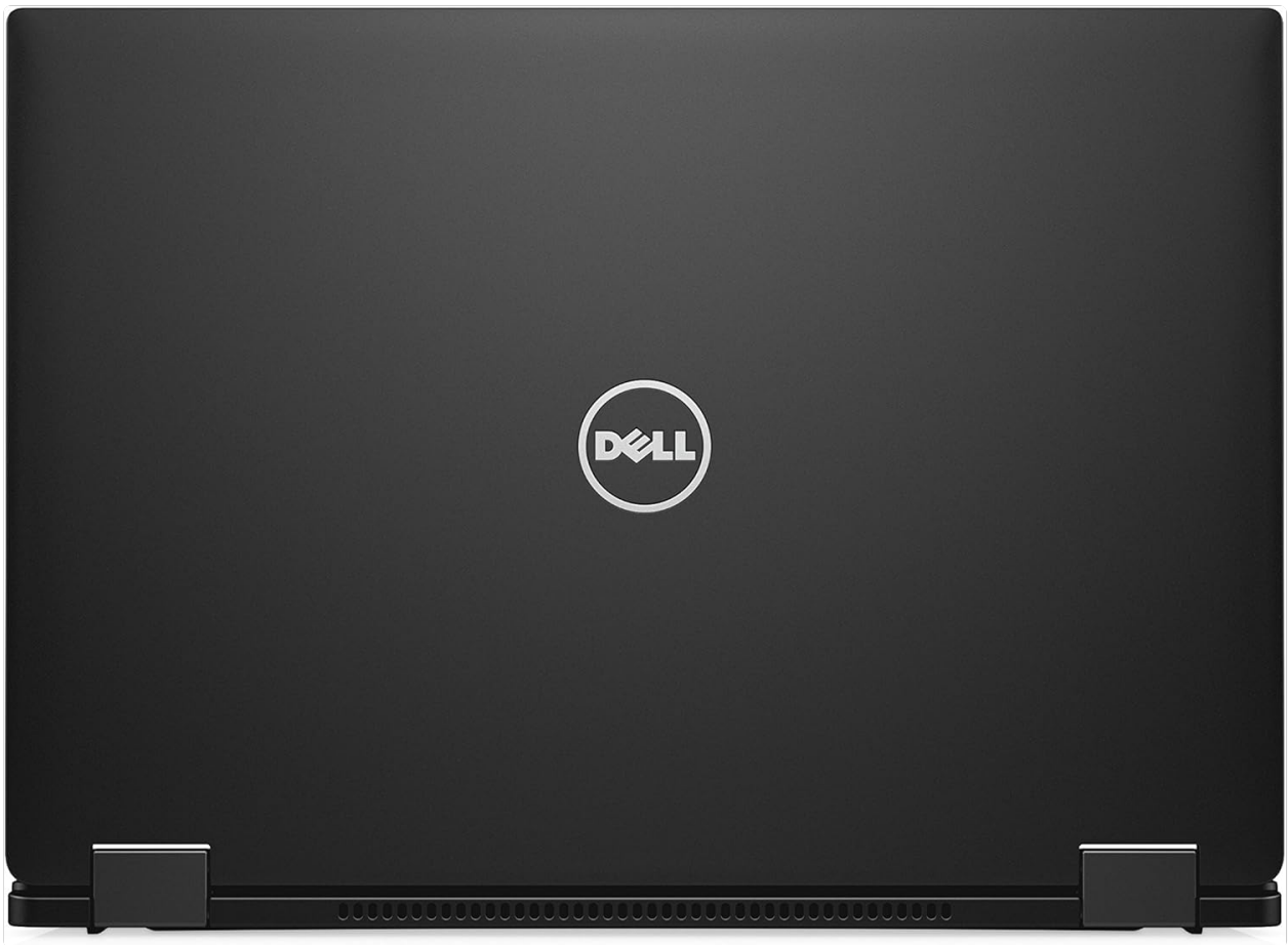
Figure 4: Back view of the Dell Latitude 5289, showing the Dell logo and ventilation grilles.

The back of the laptop features the Dell logo and ventilation grilles to ensure proper airflow and cooling during operation.