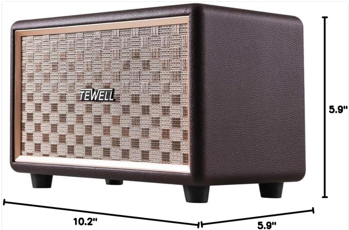
Image: Visual representation of the speaker's dimensions.