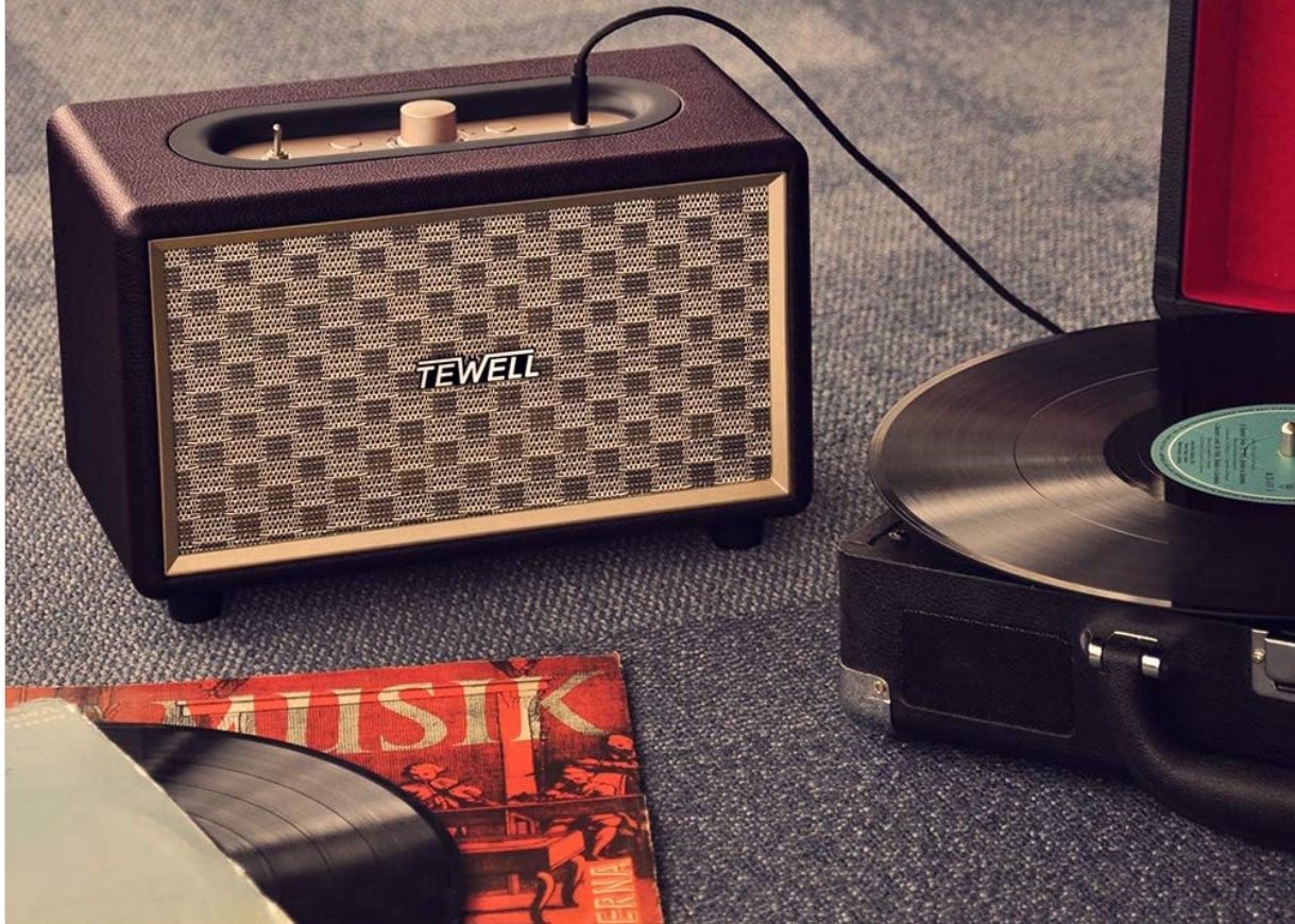
Image: The speaker connected to a turntable using the 3.5mm auxiliary input cable.