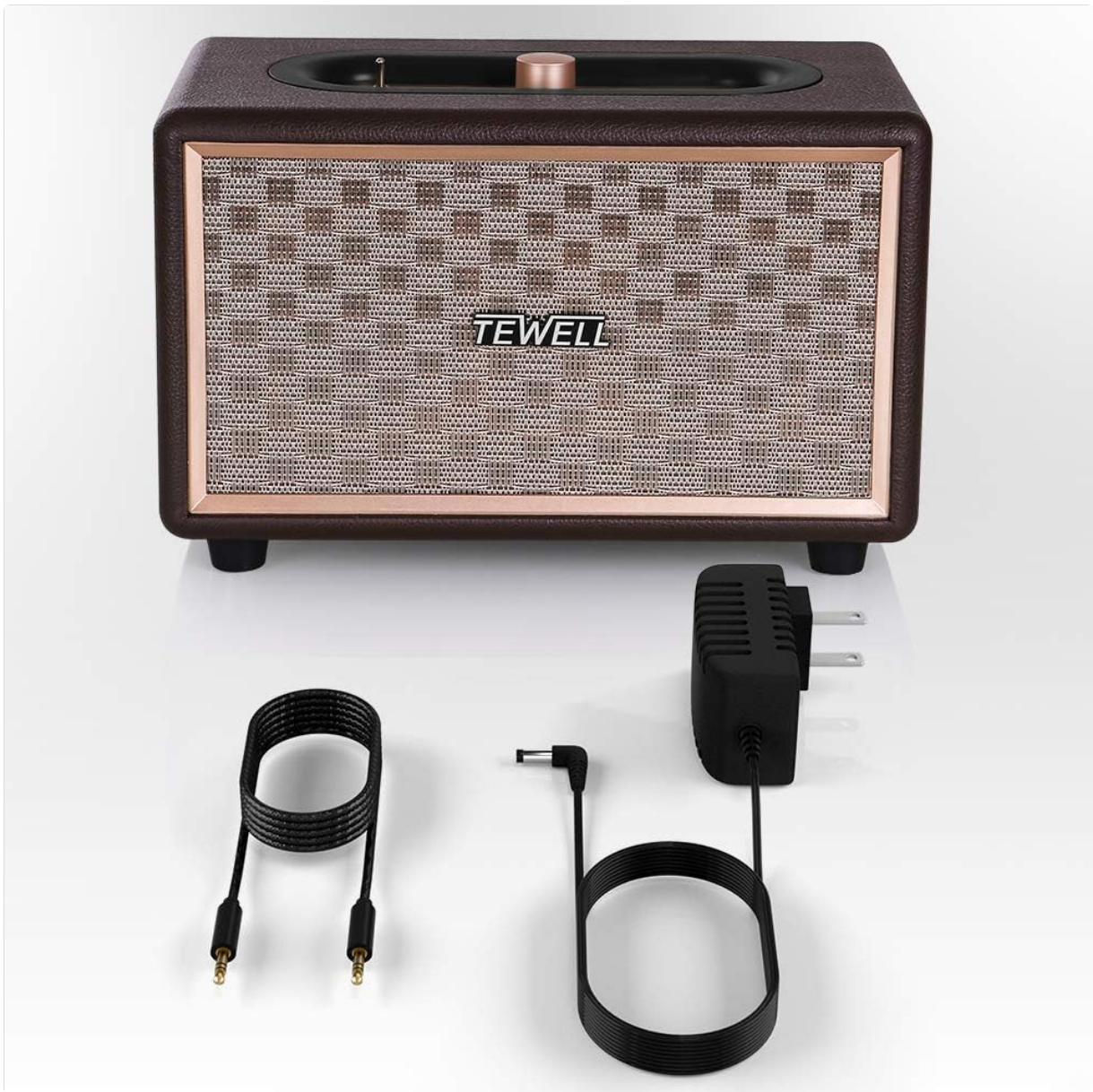
Image: Contents of the TEWELL Vintage Bluetooth Speaker package, including the speaker, power adapter, and auxiliary cable.