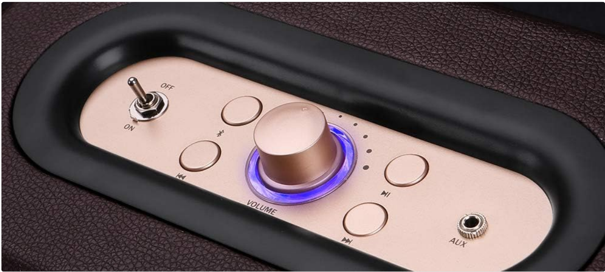
Image: Detailed view of the speaker's control panel, highlighting the power toggle, volume knob, and media control buttons.