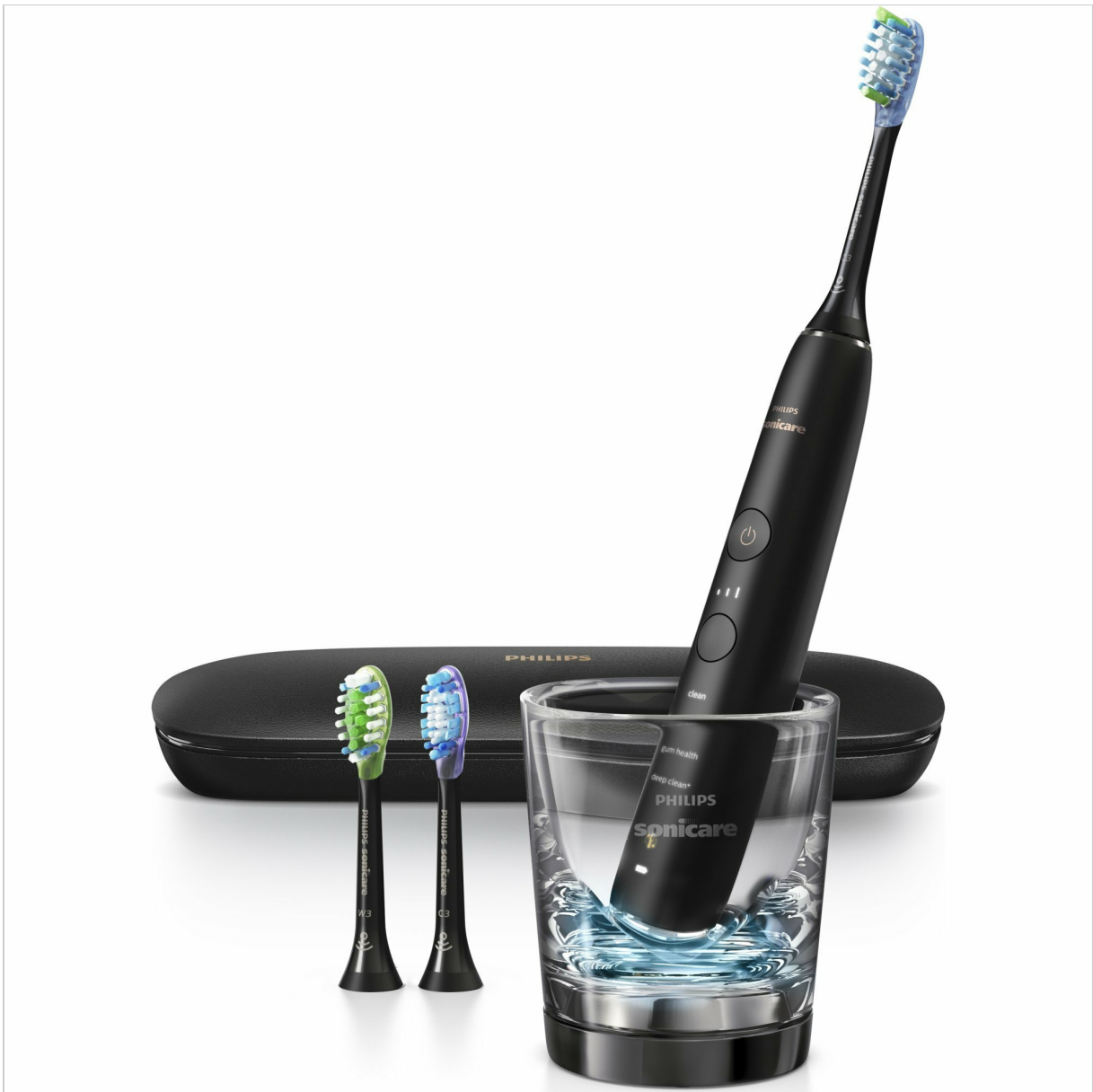
Image: Philips Sonicare DiamondClean Smart 9300 Electric Power Toothbrush in black, shown with its charging glass, a travel case, and a smartphone displaying the Sonicare app interface.