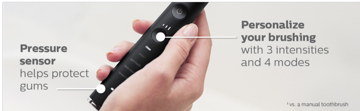
Image: A hand demonstrating the controls on the Philips Sonicare DiamondClean Smart 9300 handle, highlighting the power button and mode/intensity selection buttons.

A visual pressure sensor alerts you if you are brushing too hard, helping to protect your teeth and gums from excessive pressure.