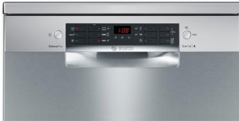
Figure 3: Detailed view of the Bosch SMS46KI01E Dishwasher control panel, showing program selection buttons and the digital display.

The control panel features intuitive buttons and an LED display for program selection and status indication.