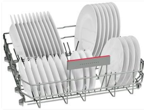
Figure 5: Lower basket of the dishwasher, suitable for plates and larger items.