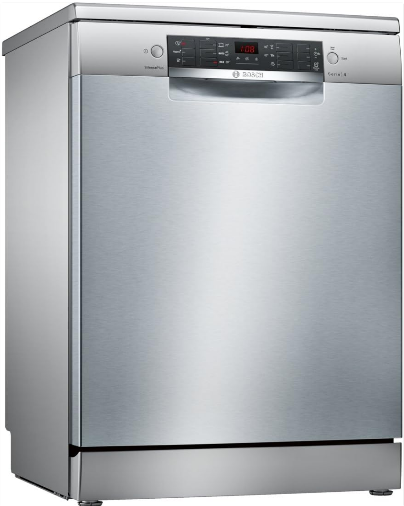
Figure 1: Front view of the Bosch Serie 4 SMS46KI01E Freestanding Dishwasher. This appliance features a stainless steel finish and a user-friendly control panel.