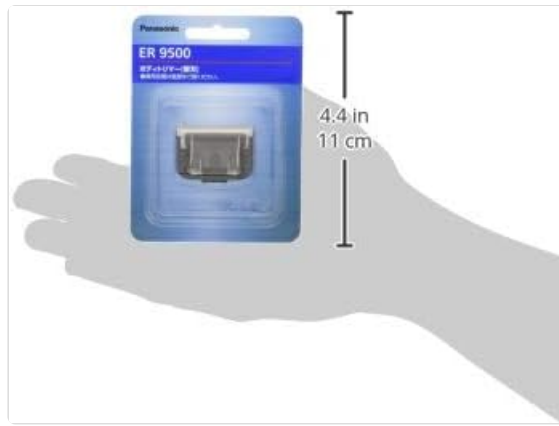
Image: The Panasonic ER9500 replacement blade, demonstrating its size and design.