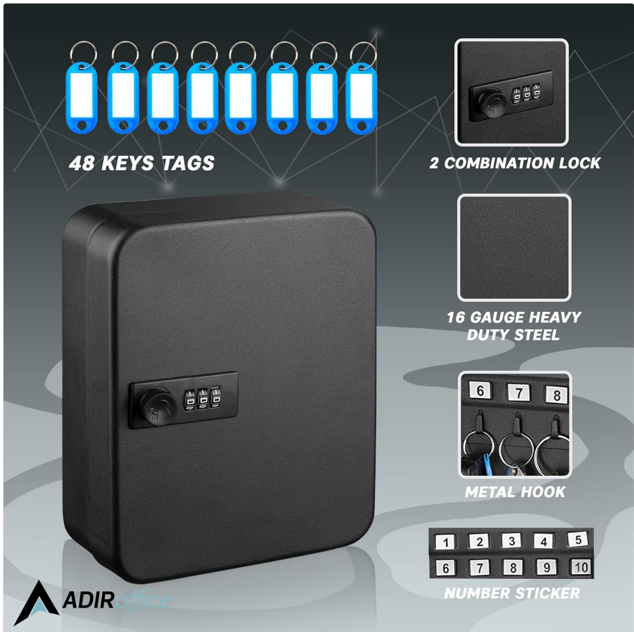
Image 3.1: Visual representation of the AdirOffice Key Lock Box highlighting its features, including the combination lock, 16-gauge steel construction, metal hooks, and included key tags and number stickers.