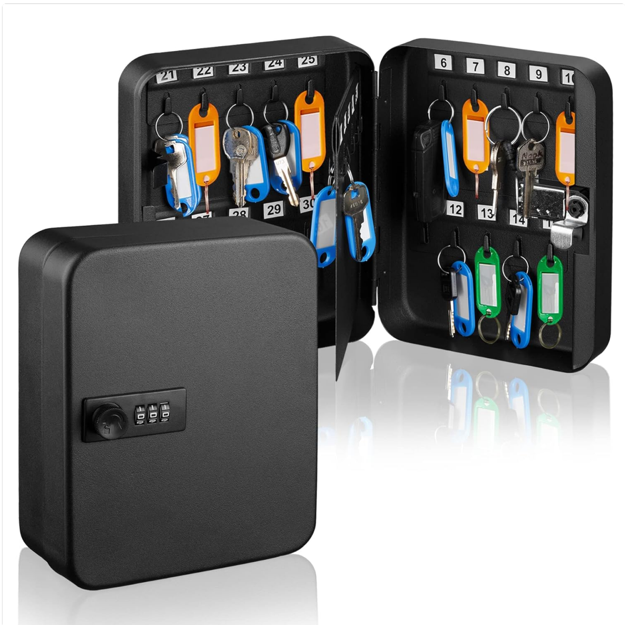
Image 1.1: AdirOffice Key Lock Box (Model ADI681-2) with its door open, displaying the internal key hooks and organized keys. The front of the closed box shows the combination lock.