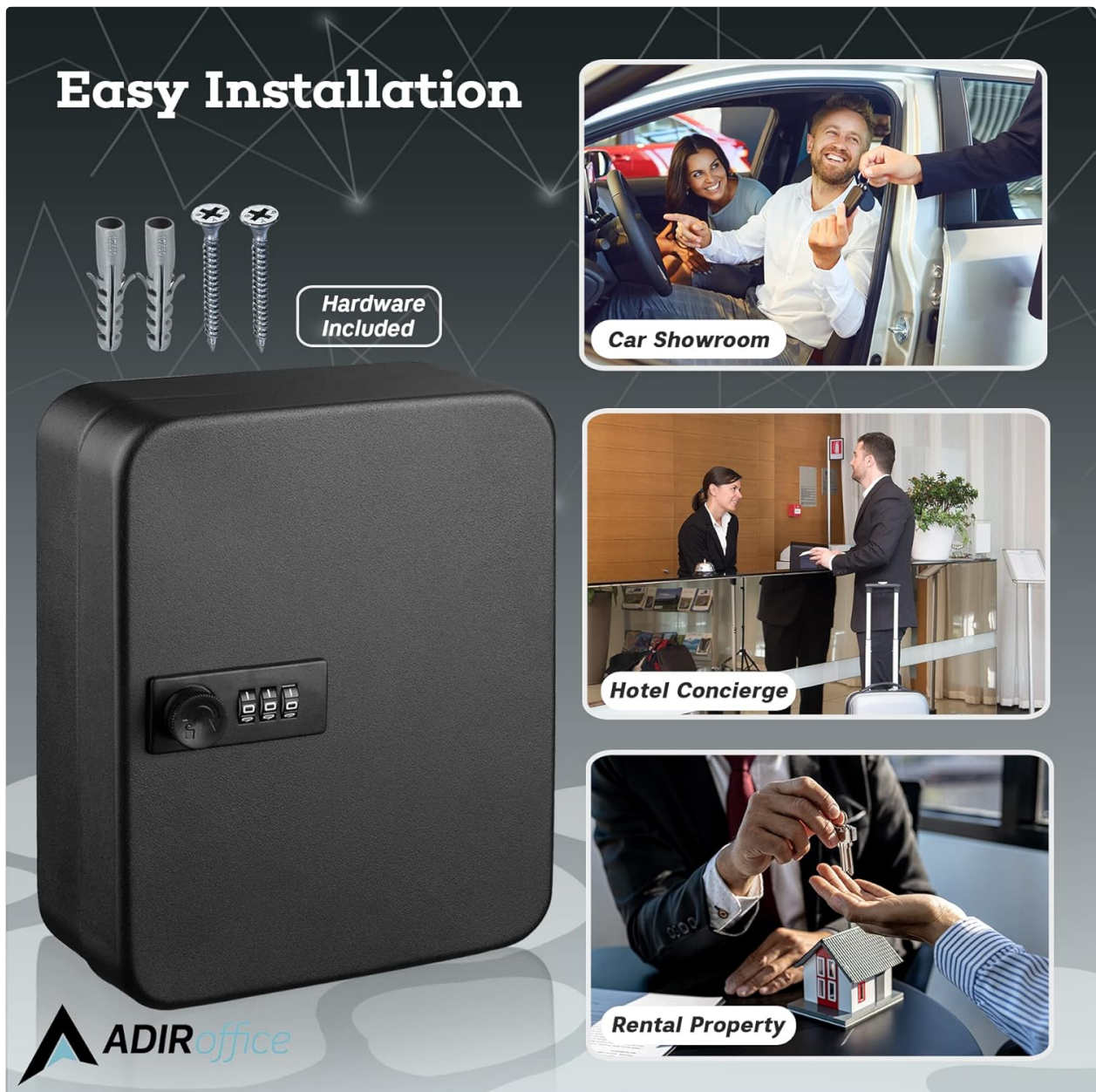
Image 4.1: The AdirOffice Key Lock Box shown with the included mounting hardware (screws and wall anchors), illustrating the ease of installation.