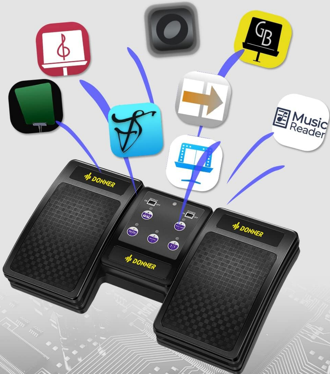
Image: A visual representation of the pedal's versatility and compatibility with multiple platforms and reading applications, showing various app icons.

Adapt to multiple platforms and reading apps