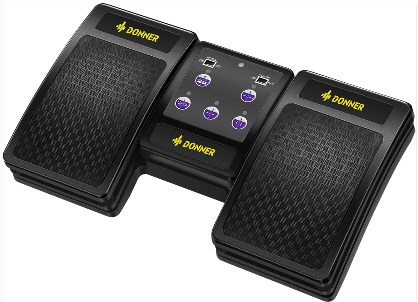
Image: The Donner Bluetooth Page Turner Pedal, showcasing its two large foot pedals and central control panel.