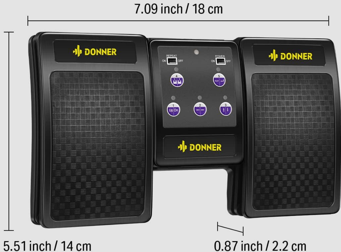
Image: A diagram illustrating the physical dimensions of the Donner Page Turner Pedal in both inches and centimeters.

Free your hands and make playing more free