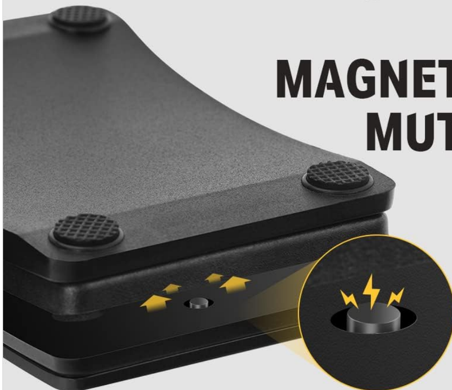
Image: Detailed view of the pedal's underside, highlighting the rubber anti-skid pads for stability and the magnetic touch mute switch.