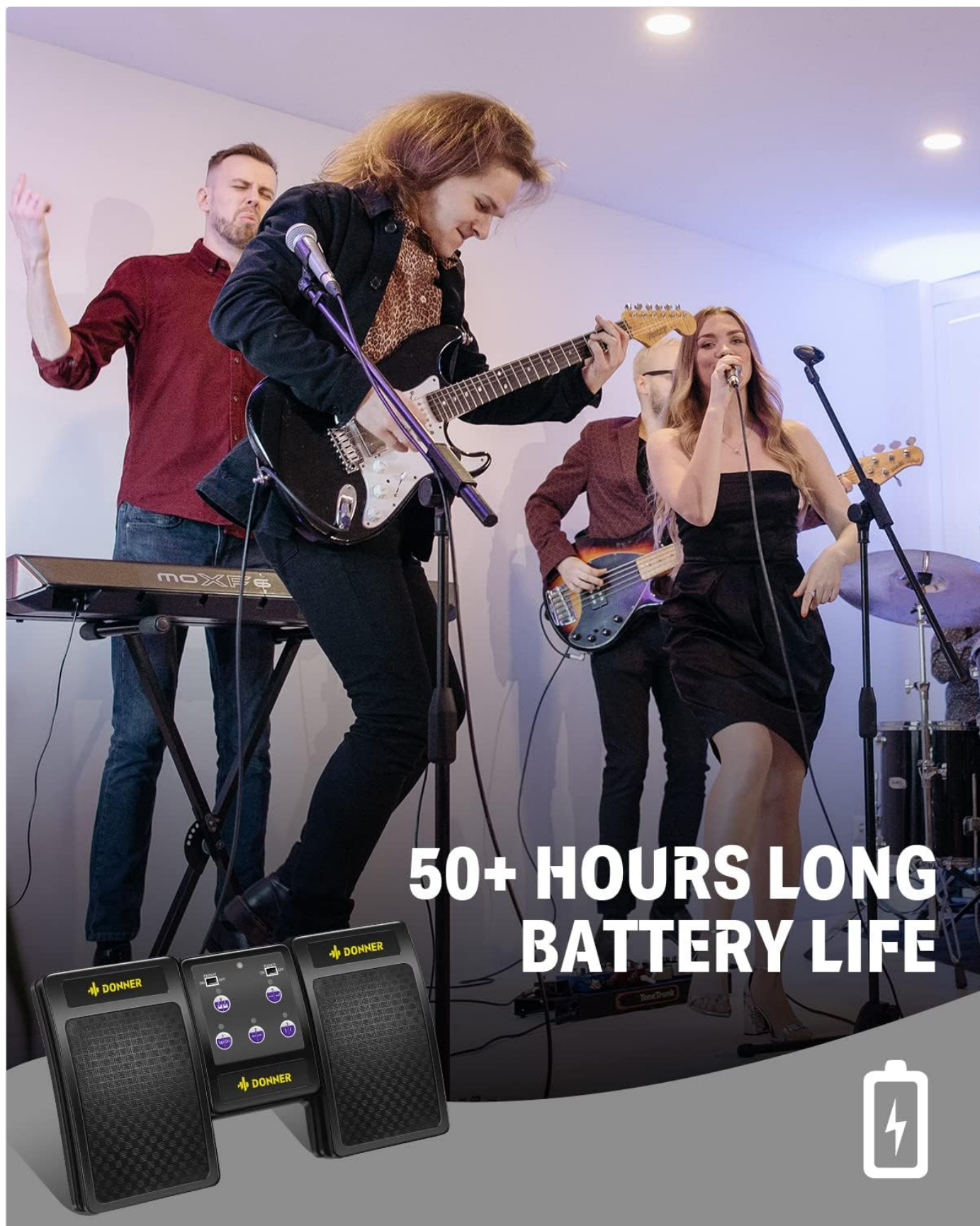
Image: Illustration highlighting the long battery life of the Donner Page Turner Pedal, indicating over 50 hours of use.