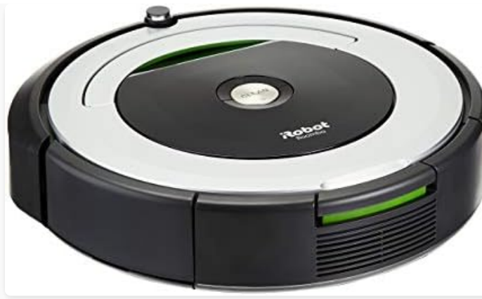
Image: Side view of the iRobot Roomba 690 Robot Vacuum, showcasing its low profile for cleaning under furniture.