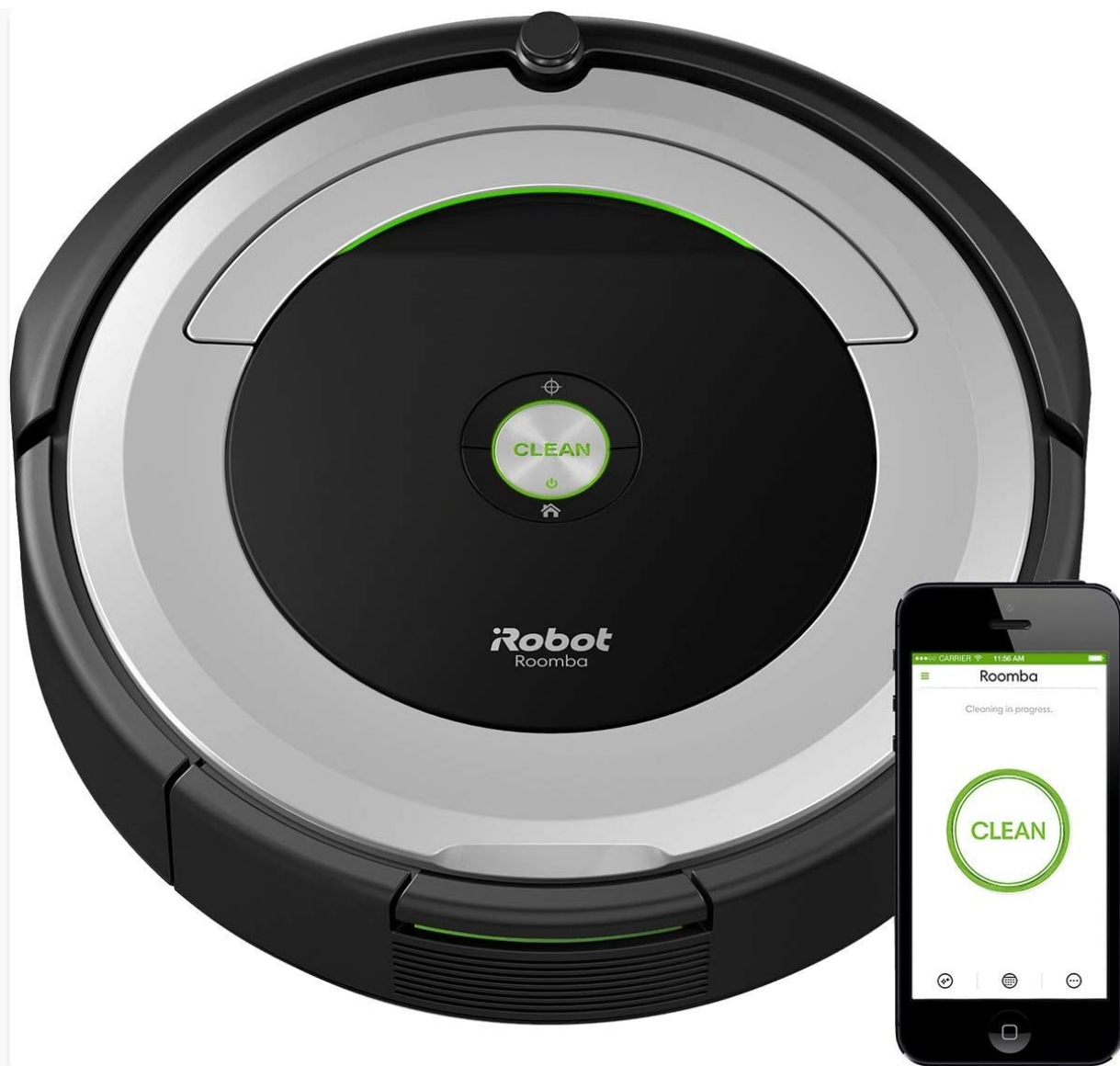
Image: iRobot Roomba 690 Robot Vacuum with its charging base and a smartphone showing the iRobot Home app interface.