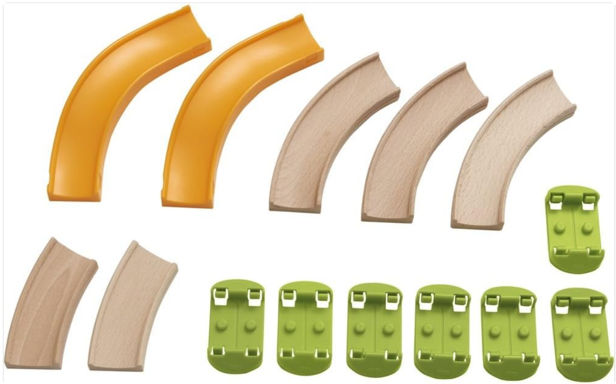
Image 1: All components included in the HABA Kullerbu Expansion Set Curves & Friends. This includes two orange wavy plastic curves, five natural wood curves of varying sizes, and seven green plastic connectors.