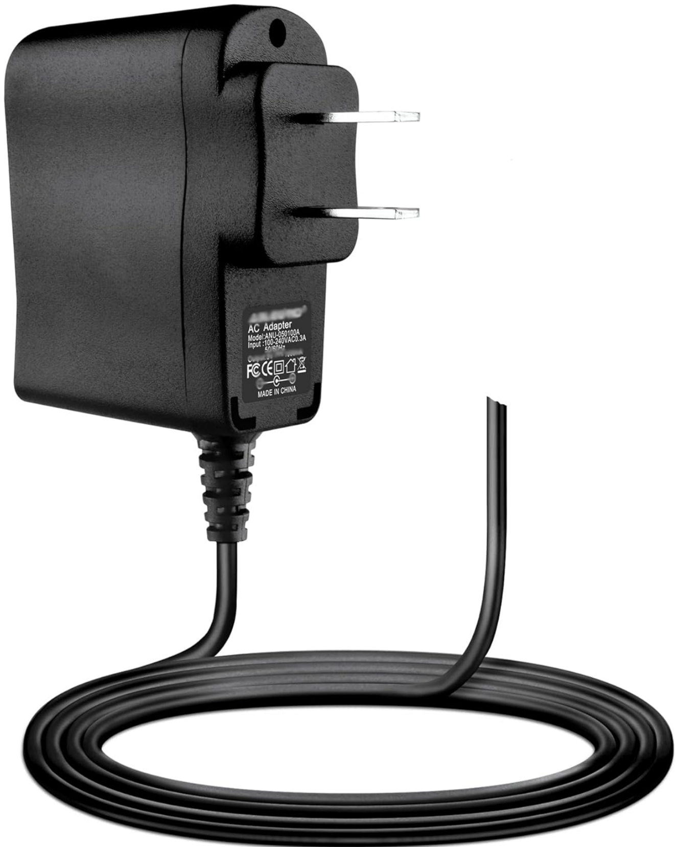
Figure 5: The PK Power AC/DC Adapter with its power cord extended, illustrating the full length of the cable for connection to a device.