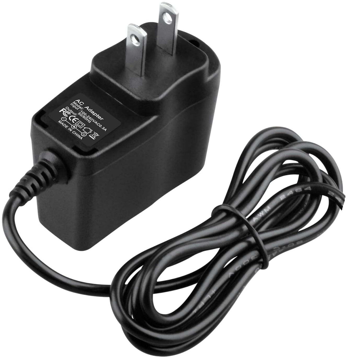
Figure 1: Front view of the PK Power AC/DC Adapter with its integrated power cord coiled. This image shows the main body of the adapter, which plugs into a wall outlet, and the attached cable.