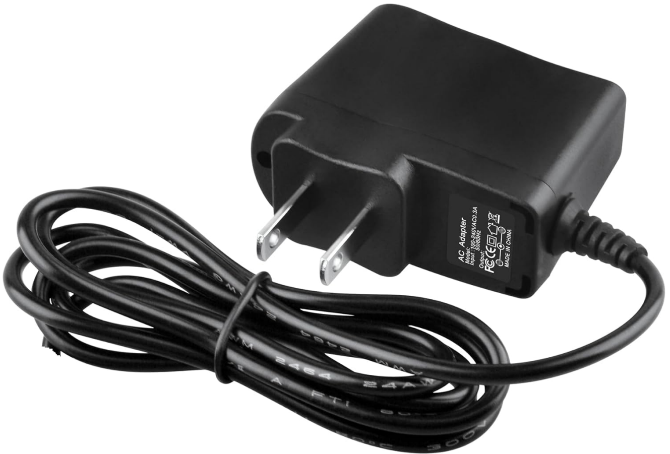
Figure 2: Angled view of the PK Power AC/DC Adapter, highlighting the plug prongs and the cable connection point. The label with specifications is visible on the side.