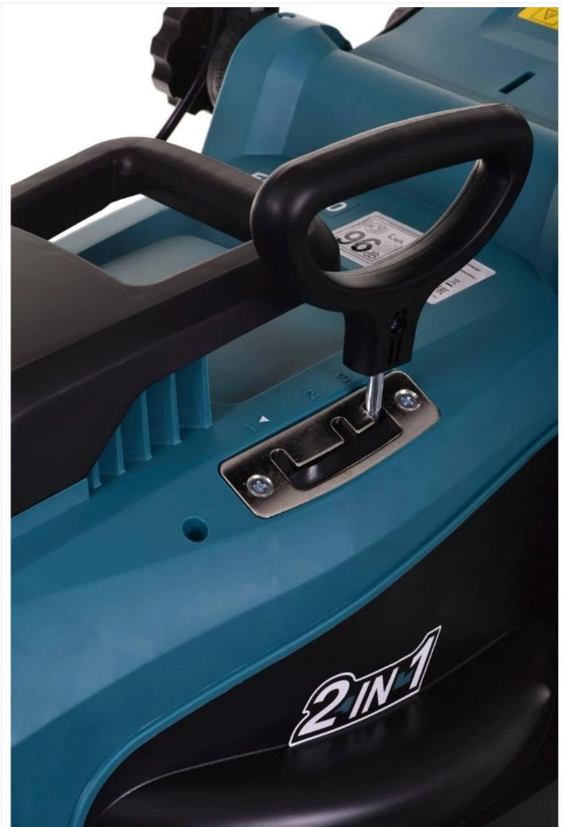
Close-up of the cutting height adjustment lever on the Makita ELM3720 Electric Mower, with settings indicated by numbers.