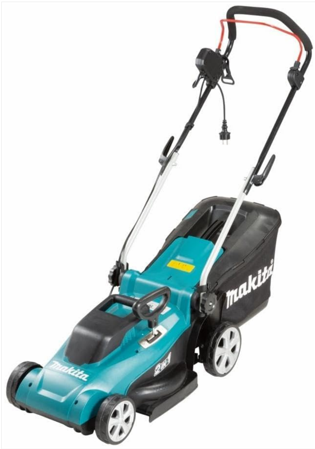
The Makita ELM3720 Electric Mower with its handle assembly partially attached, showing the main body and grass collection bag.