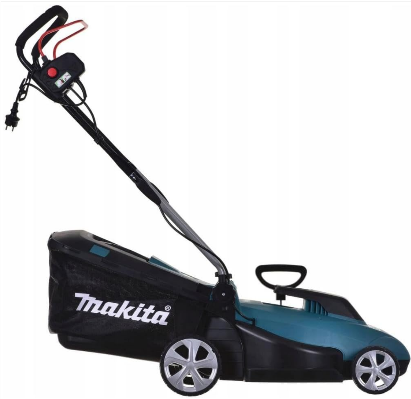
Side view of the Makita ELM3720 Electric Mower, highlighting the handle and grass collection bag.