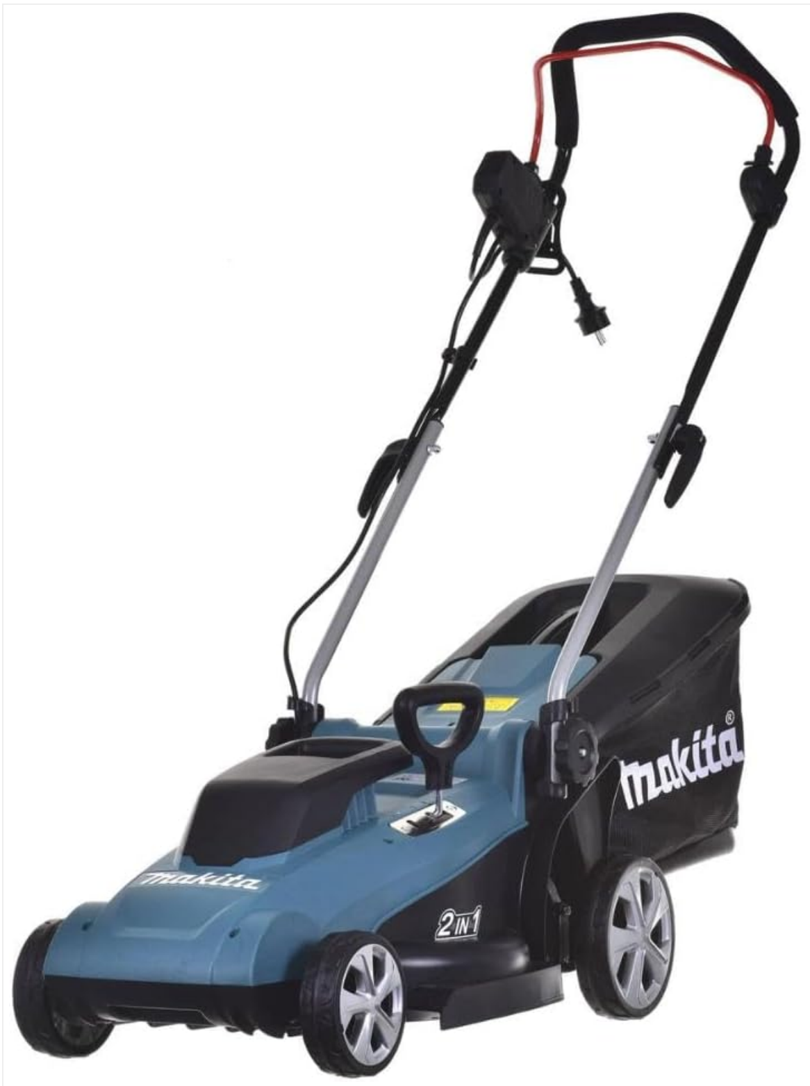
The fully assembled Makita ELM3720 Electric Mower, ready for operation, showcasing its compact design.