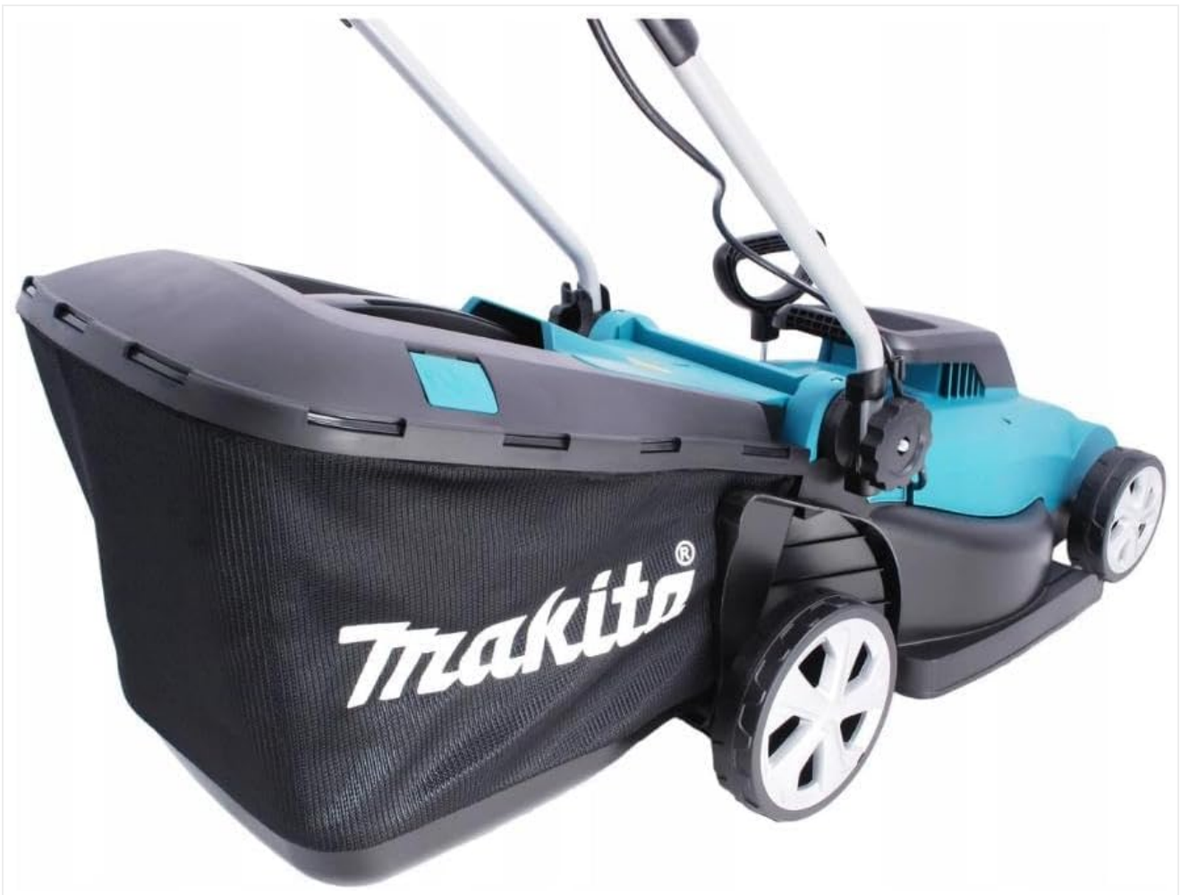
The grass collection box attached to the rear of the Makita ELM3720 Electric Mower.