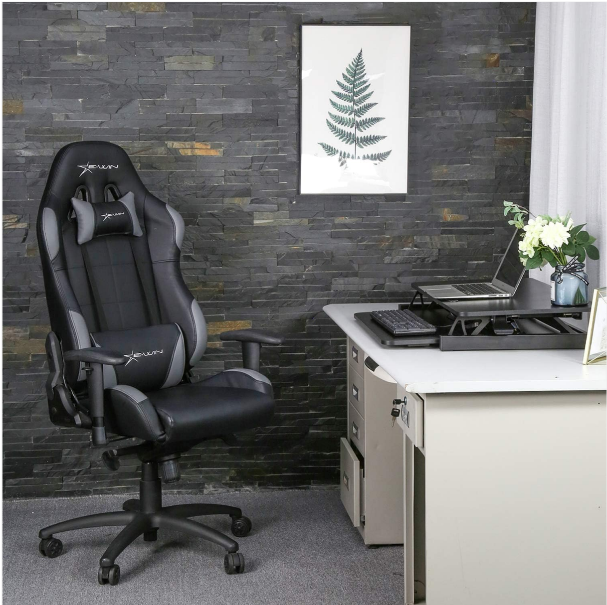
Image 8.4: Various views illustrating the chair's design and structural elements.