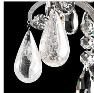
Figure 2: Detailed view of the Heritage Handcut Crystal and Quartz Rock Crystal components, highlighting their unique craftsmanship and natural beauty.

Timelessly representing nature's artistic signature, Schonbek Quartz Crystal is crafted to enhance its natural splendor, luminosity and dazzling prismatic beauty