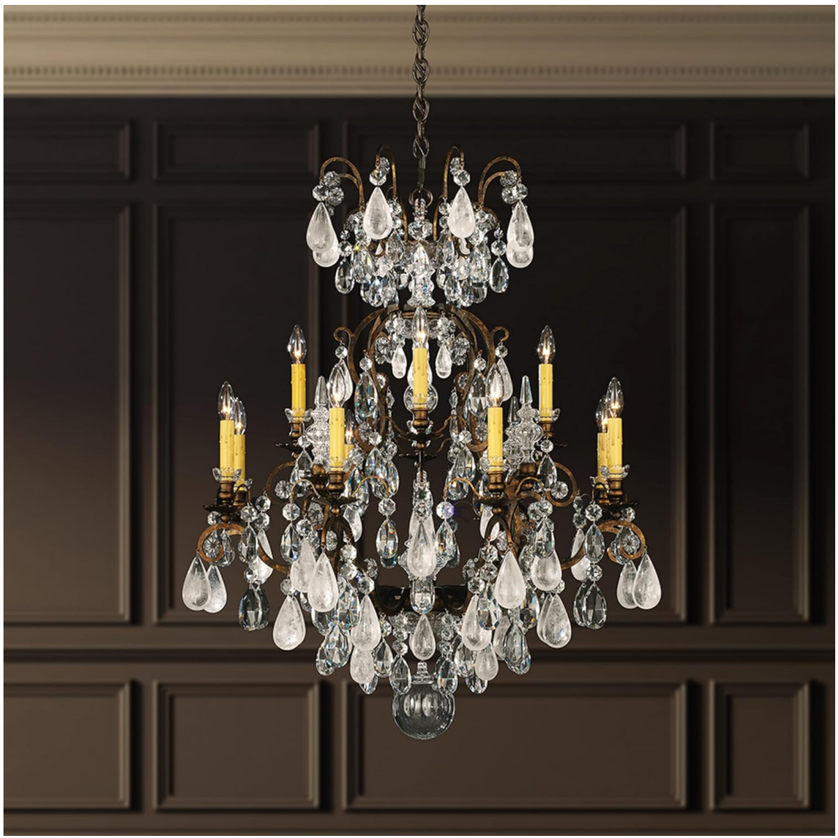
Figure 3: The Schonbek Renaissance Chandelier elegantly installed in a room, demonstrating its aesthetic appeal and illumination.